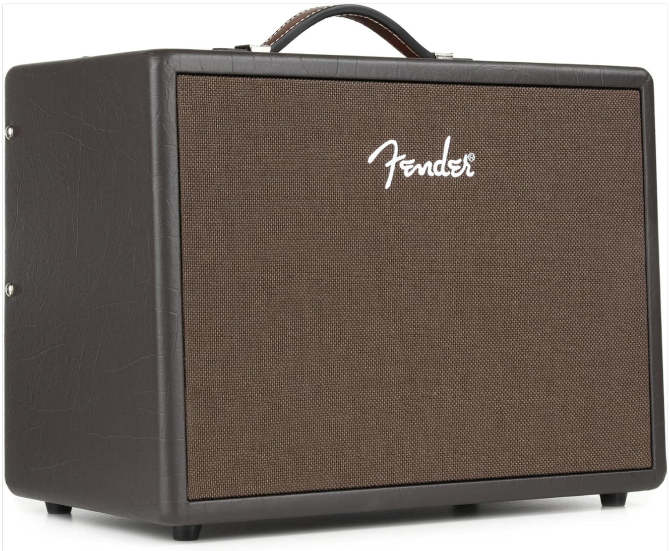
Figure 1: Front view of the Fender Acoustic Junior Guitar Amplifier. This image displays the amplifier's dark brown finish and the Fender logo on the speaker grille.