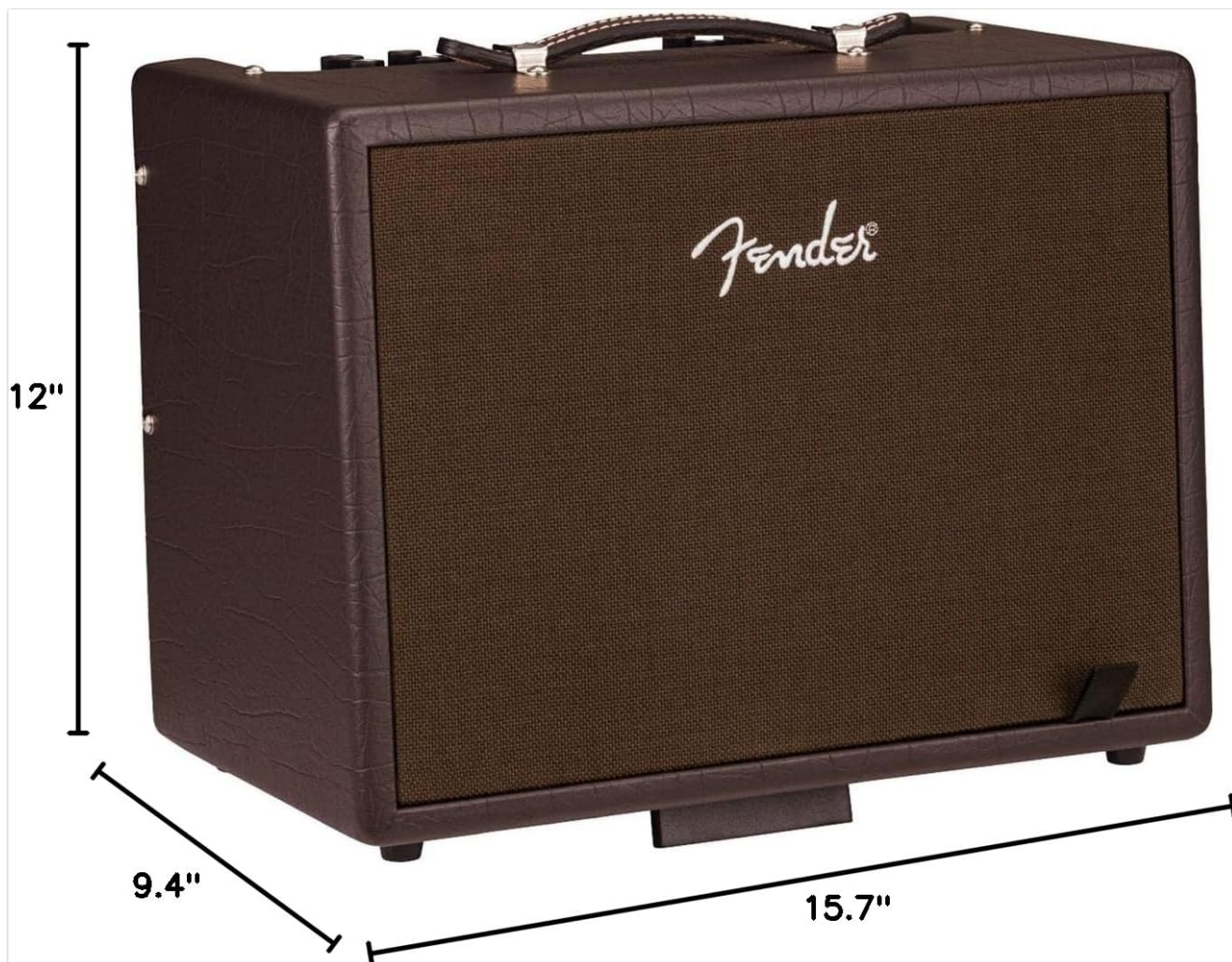
Figure 2: Side view of the Fender Acoustic Junior Guitar Amplifier, illustrating its dimensions: 9.4 inches deep, 15.7 inches wide, and 12 inches high.