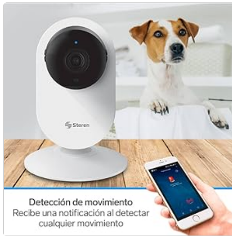
Image: The camera's motion detection feature sends alerts to your phone.