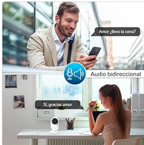
Image: Illustration of two-way communication using the camera's audio features.