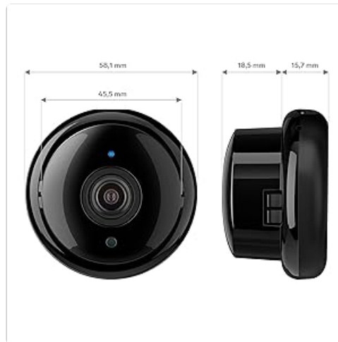
Image: Detailed dimensions of the STEREN CCTV-204 camera.