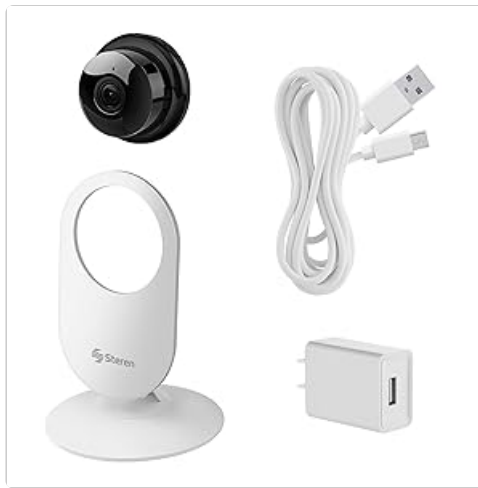
Image: All items included in the STEREN CCTV-204 camera package.