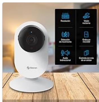
Image: Monitoring your space from your mobile phone using the Steren Home app.