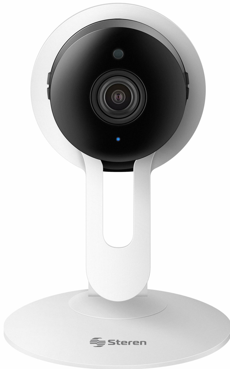
Image: STEREN CCTV-204 Wi-Fi Full HD Fixed Security Camera and its packaging.