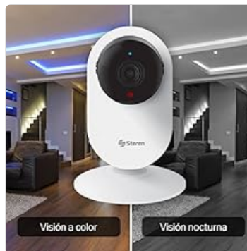
Image: The camera incorporates night vision for clear monitoring in darkness.