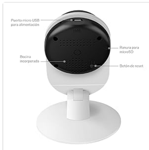
Image: Key product attributes and features of the STEREN CCTV-204 camera.

Detailed technical specifications for the STEREN CCTV-204 Wi-Fi Full HD Fixed Security Camera: