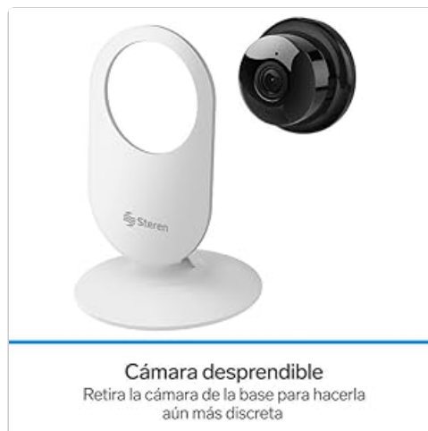
Image: The camera can be detached from its base for more discreet placement.