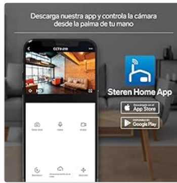
Image: The Steren Home app icon and options to download from App Store or Google Play.