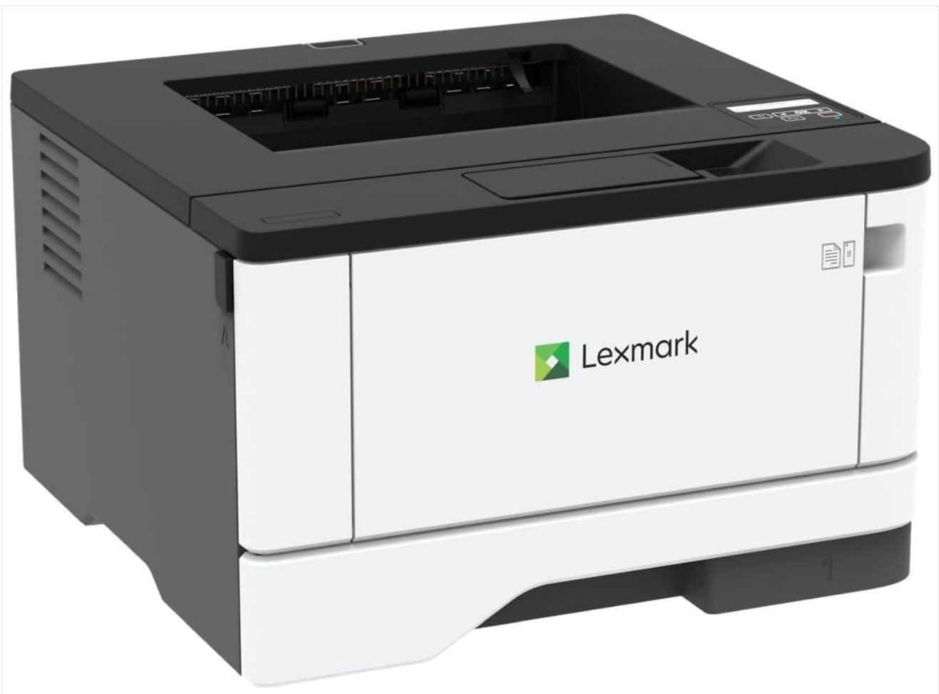
Image: Front-right view of the Lexmark MS431dw Monochrome Laser Printer.