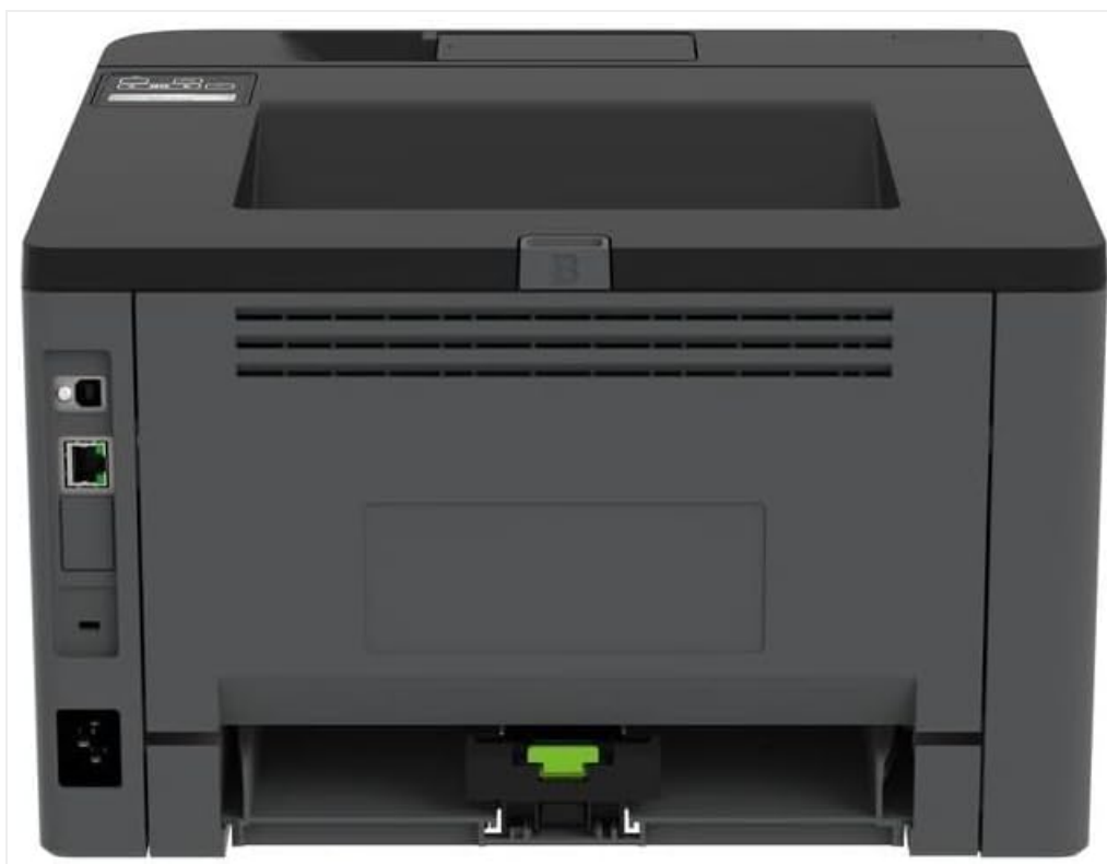
Image: Rear view of the Lexmark MS431dw, highlighting the Ethernet and power connection ports.