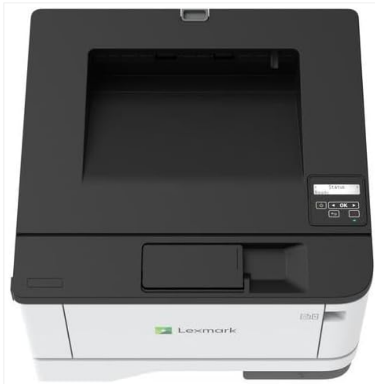
Image: Top view of the Lexmark MS431dw, showing the printer's control panel with display and buttons.

The control panel features a display screen and navigation buttons (Up, Down, OK, Back) to access printer settings, status, and functions. Refer to the on-screen menus for specific options.