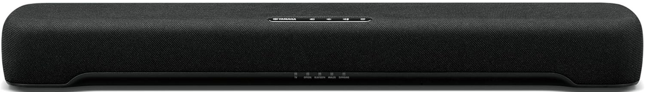
Figure 2.2: Front view of the Yamaha SR-C20A Soundbar. The front grille is visible, along with the Yamaha logo and touch controls on the top surface.