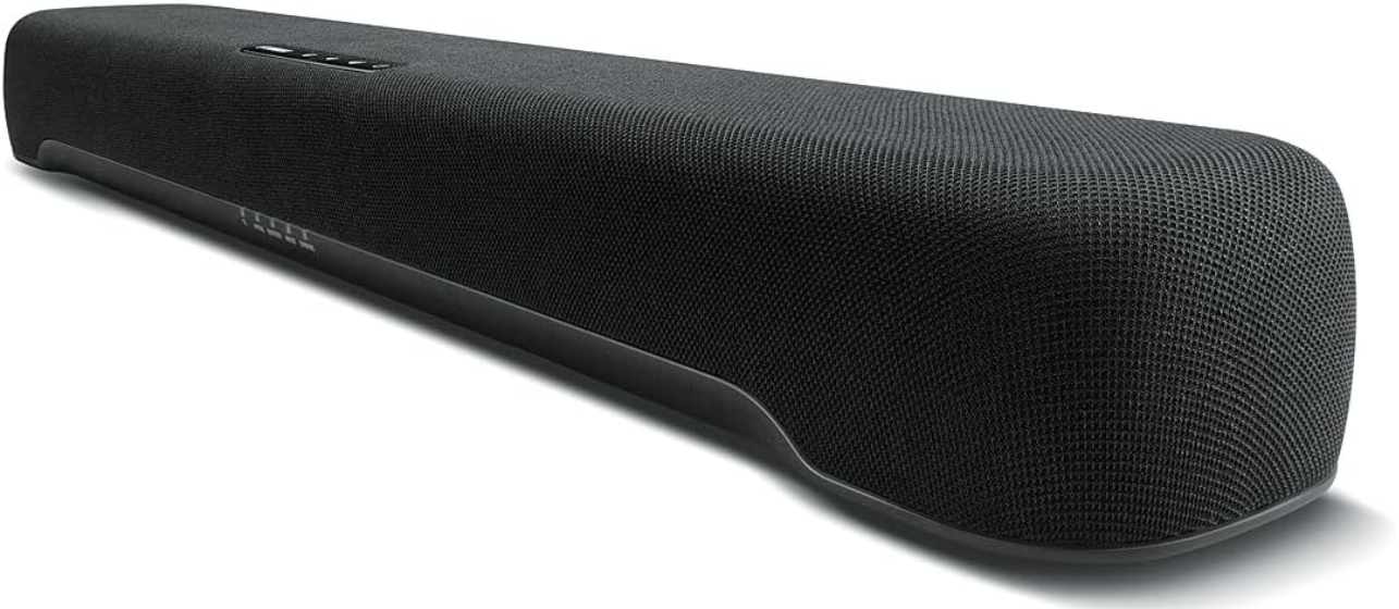
Figure 2.1: Angled view of the Yamaha SR-C20A Soundbar. This image shows the compact, sleek design of the soundbar, covered in a high-quality black fabric.