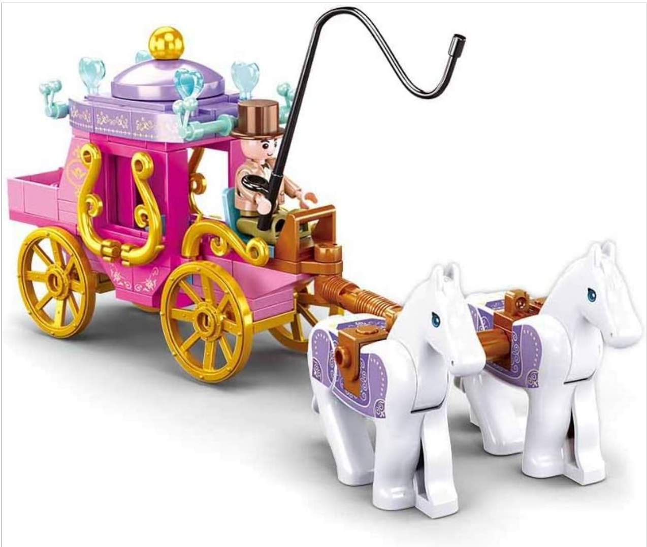
Image: The fully assembled Sluban Dream Carriage, featuring two white horses, a pink and gold carriage, and a driver figure.