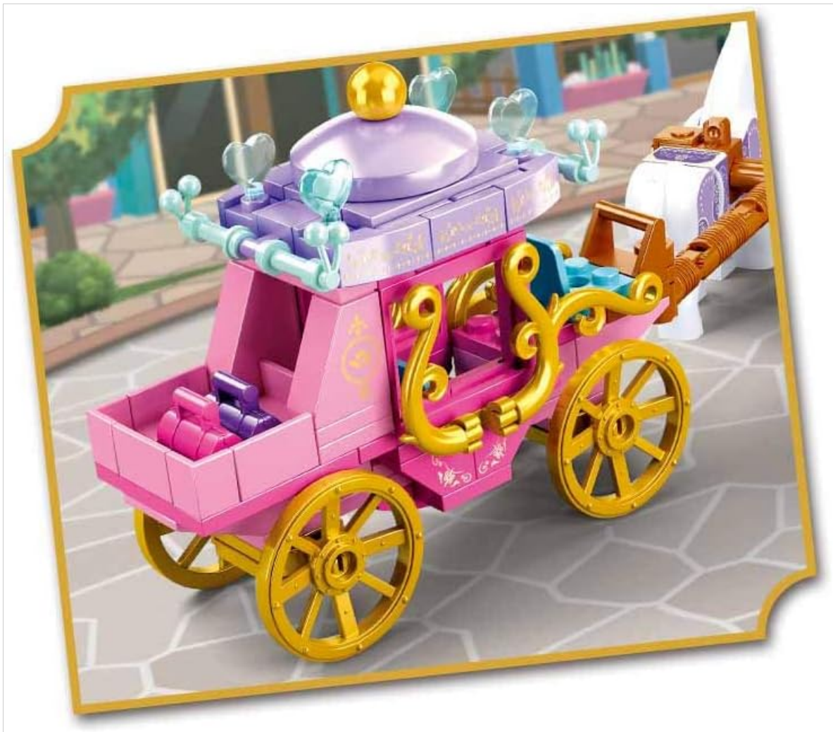
Image: The assembled Dream Carriage with its driver figure and horses, ready for play or display.