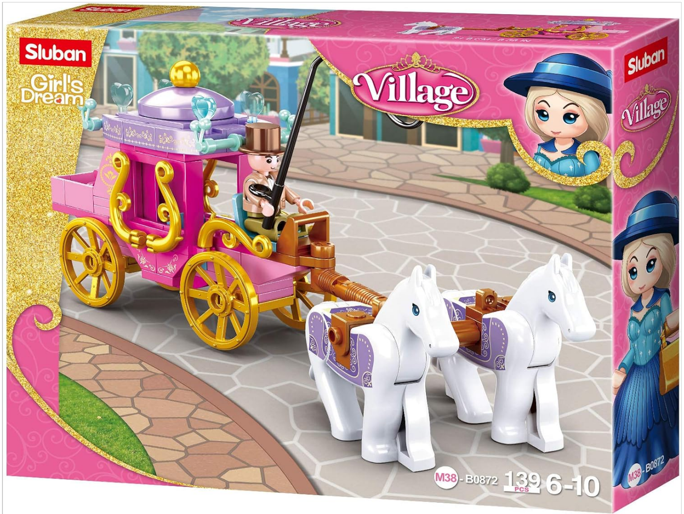
Image: The product packaging, which contains all the building blocks and the instruction manual.

5. Verify each step: Before moving to the next step, double-check that you have correctly assembled the current section as shown in the manual.