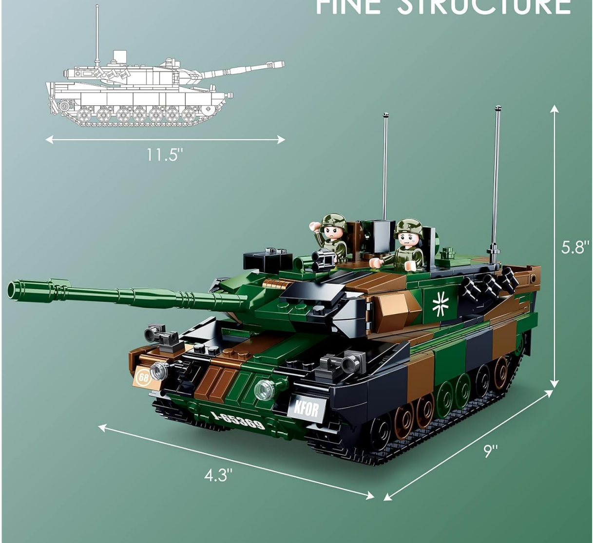
Figure 5.1: The tank model with included figures positioned in the turret, demonstrating interactive play features.