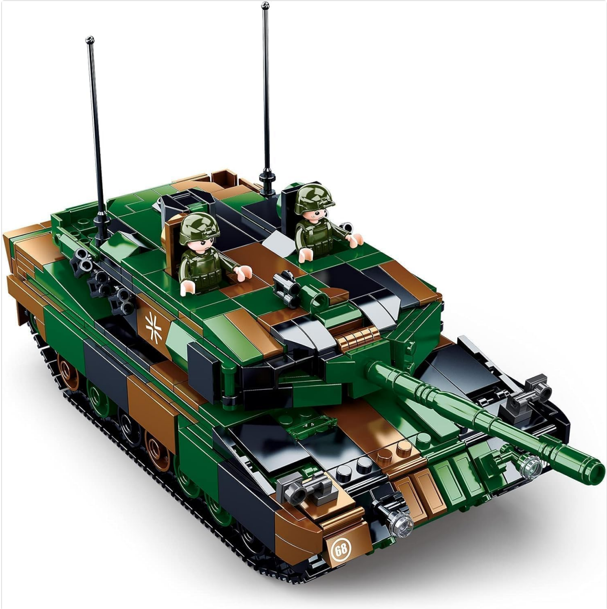
Figure 4.1: Fully assembled Sluban Leopard 2A5 Main Battle Tank model.