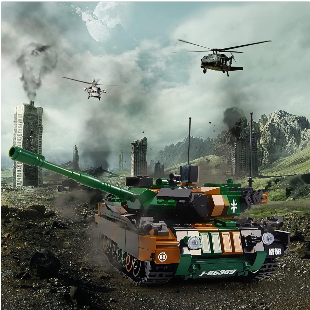
Figure 5.2: A close-up showing the detailed turret design and the placement of the figures.