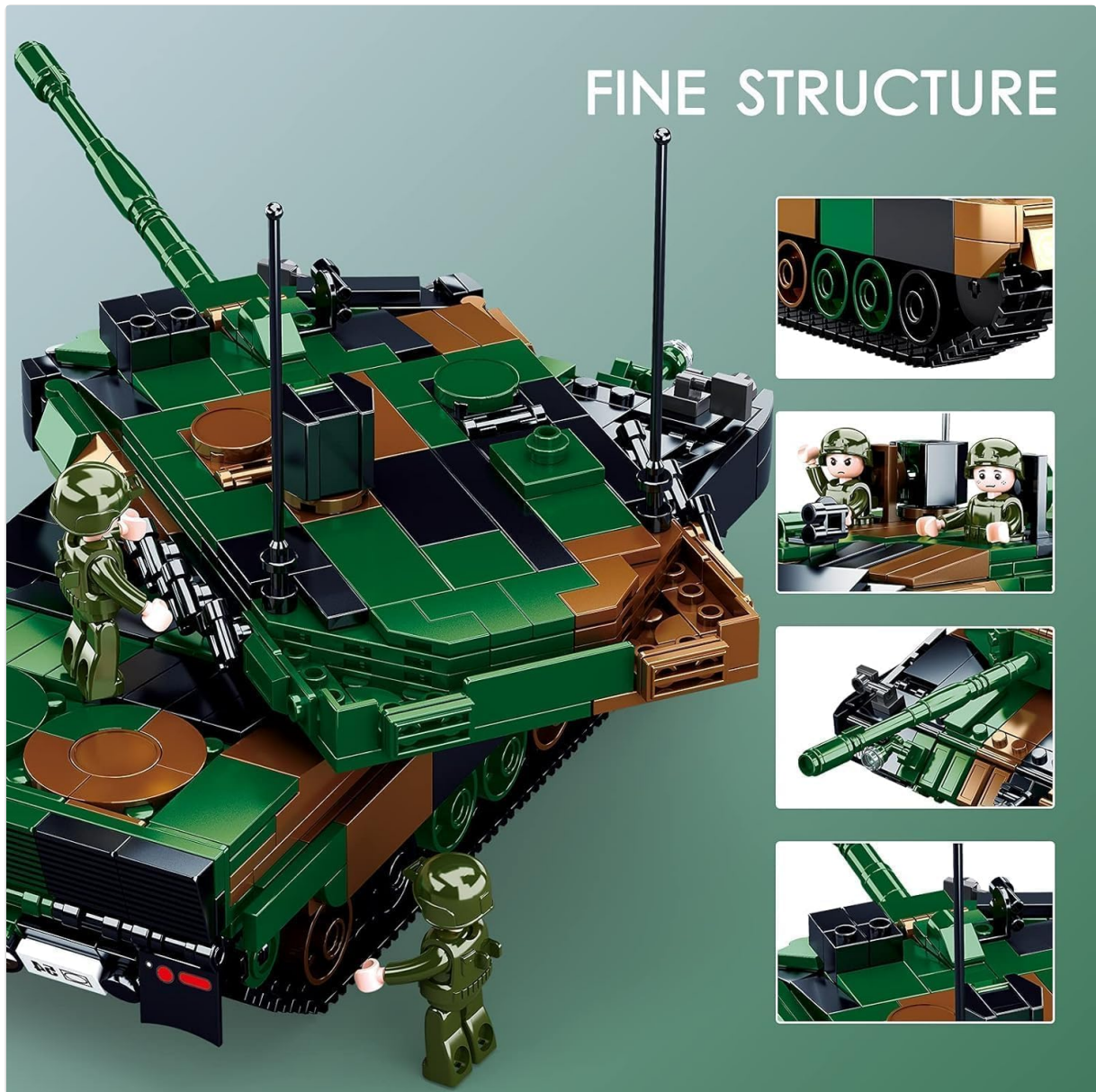
Figure 4.2: Detailed view of the model's fine structure, highlighting intricate brick connections.