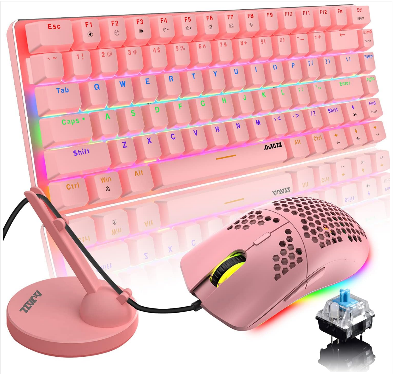
Image 1.1: ZIYOU LANG Pink Gaming Keyboard, Mouse, and Bungee Combo