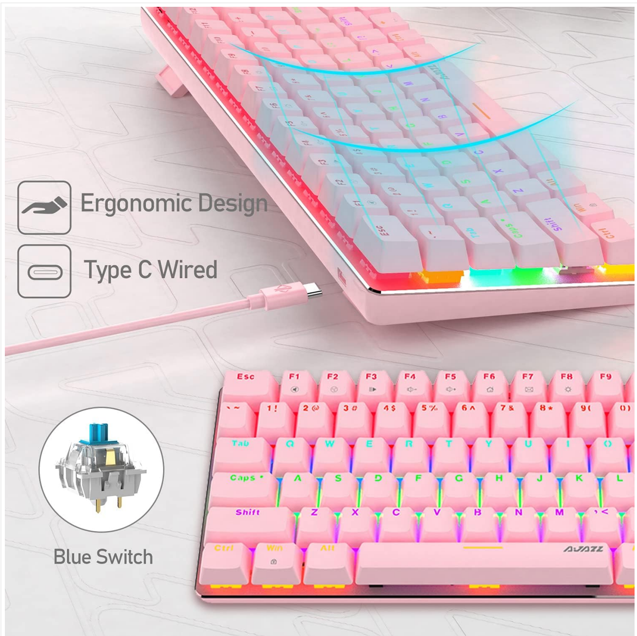
Image 2.1: Keyboard featuring Type-C wired connection and Blue Switch mechanism