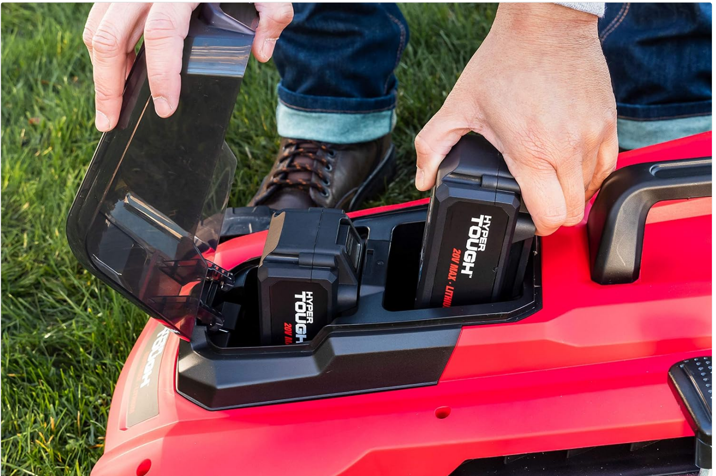
Figure 5: Inserting the charged battery packs into the mower's battery compartment.