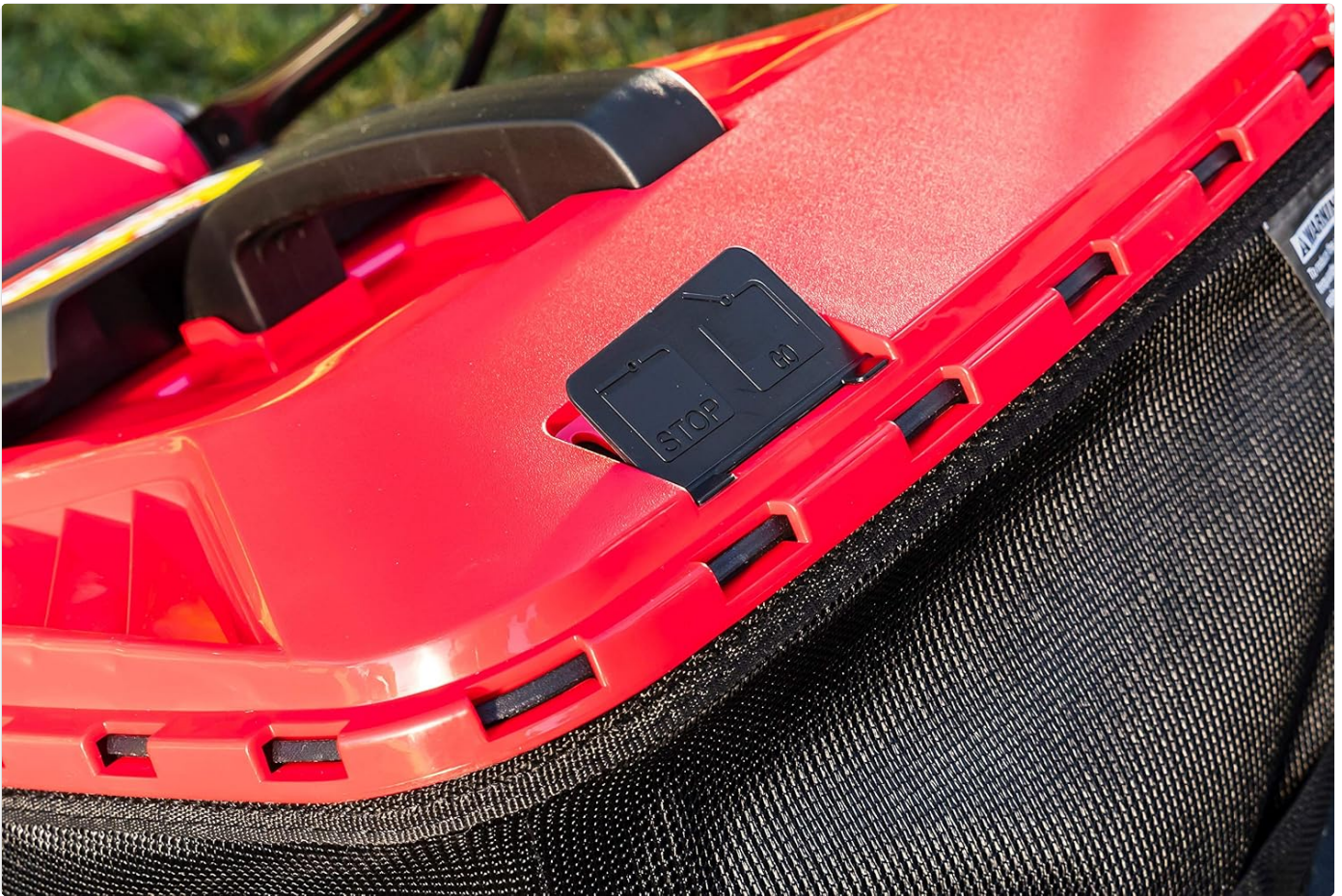
Figure 3: View of the grass bag indicator, showing when the bag is full.