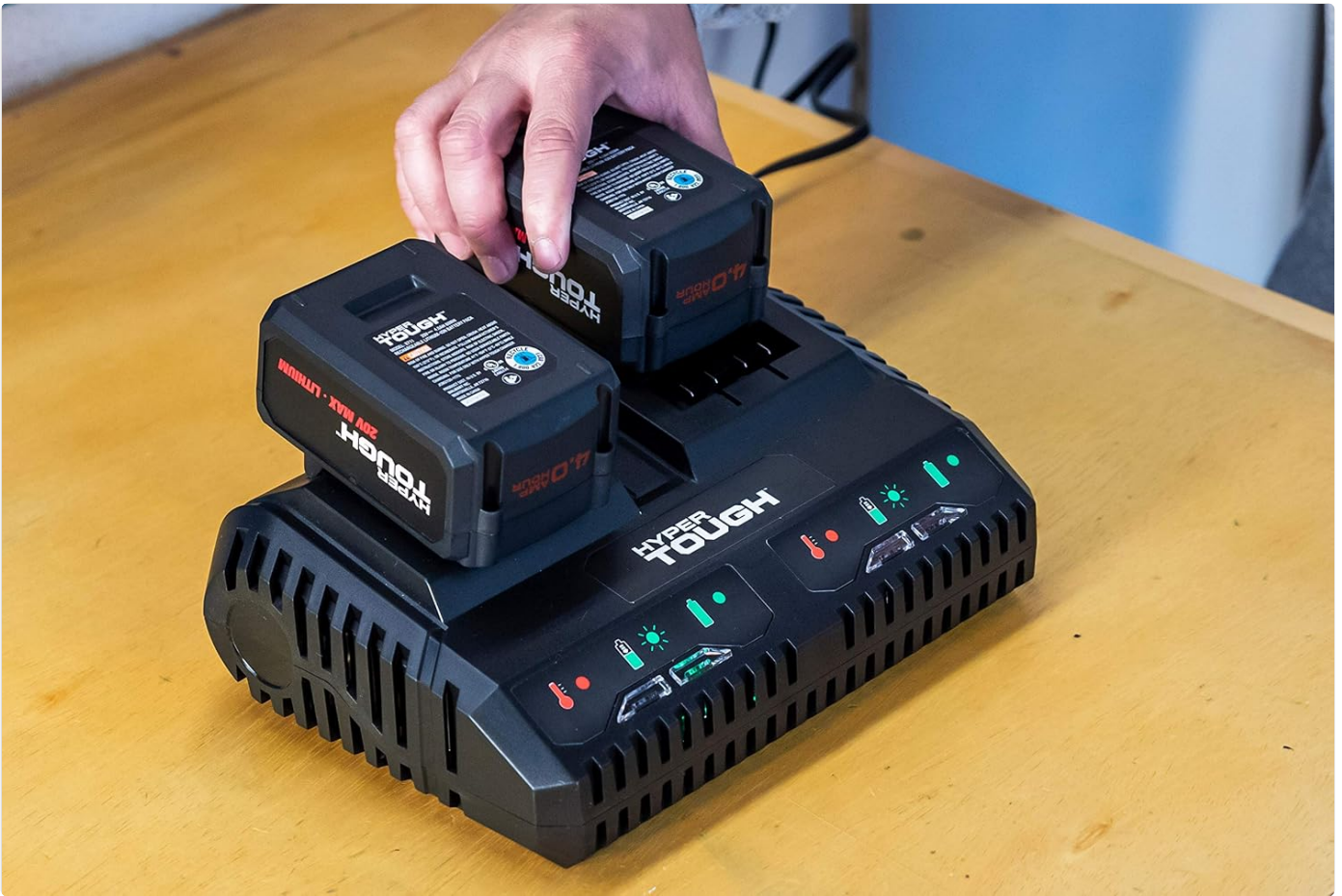
Figure 4: Two 4.0Ah battery packs being charged simultaneously on the dual port fast charger.