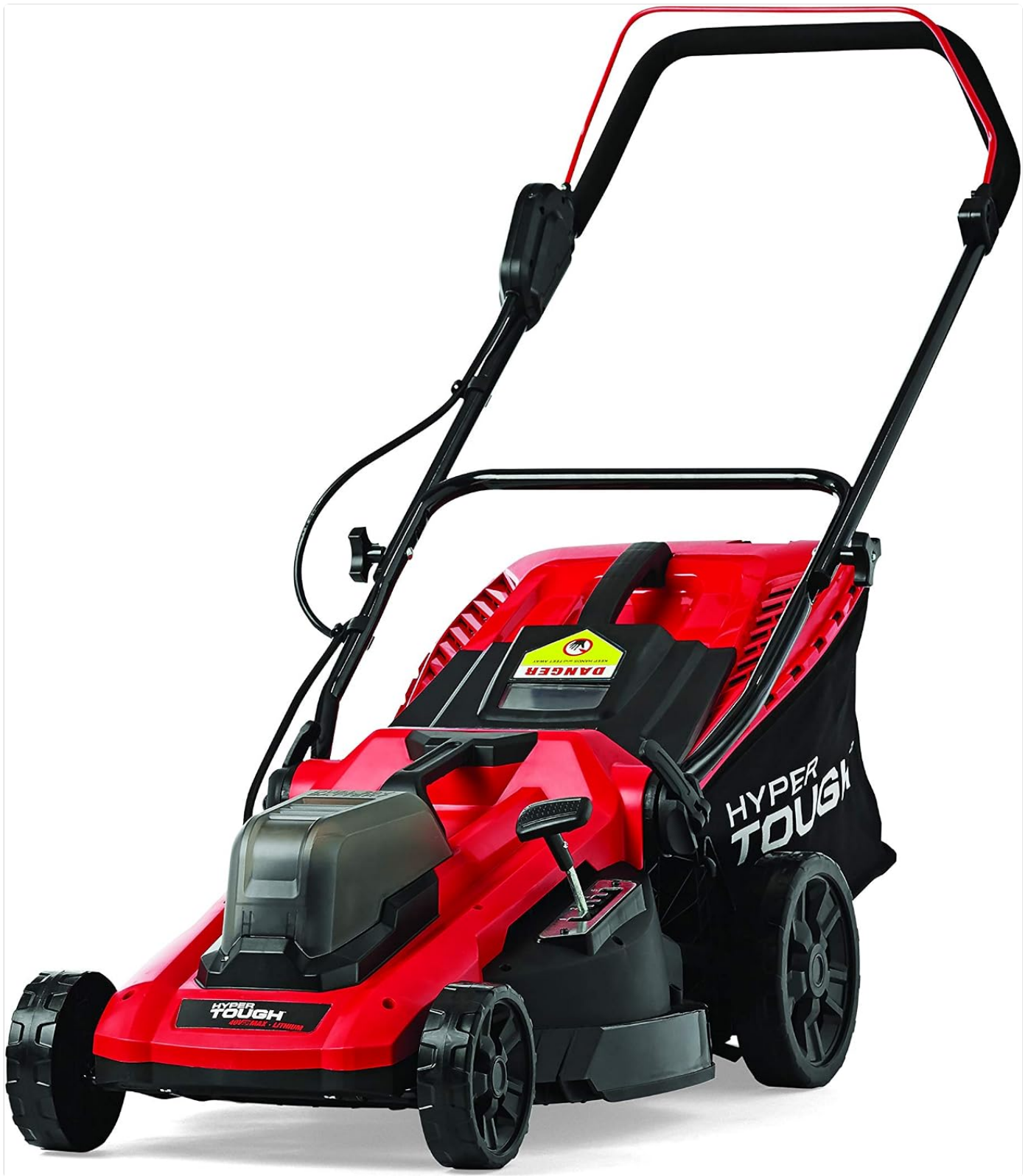
Figure 1: Hyper Tough 40-Volt 16-Inch Cordless Lawn Mower, front-side view.