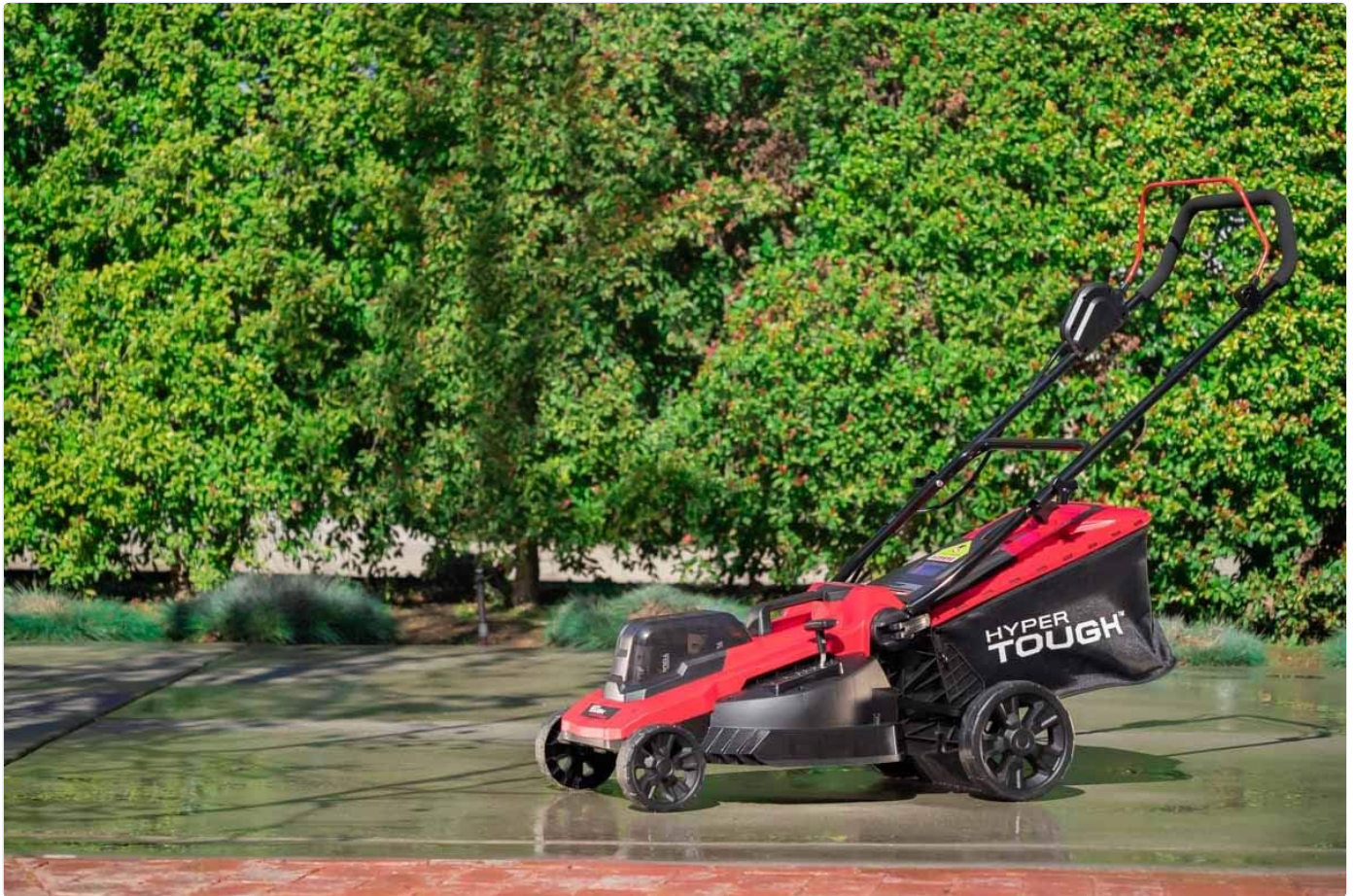
Figure 6: The Hyper Tough cordless lawn mower positioned on a paved surface next to a lawn.