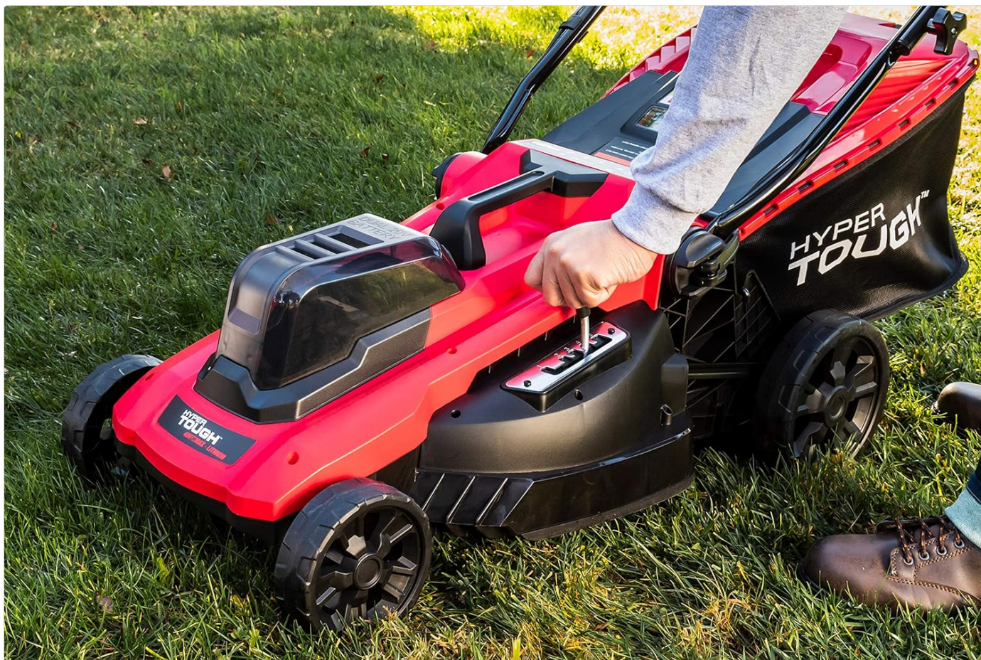
Figure 7: A hand adjusting the cutting height lever on the side of the mower.