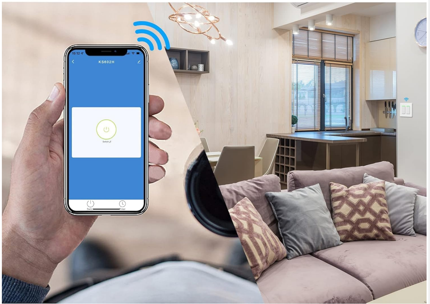
Image: APP Remote Control Interface