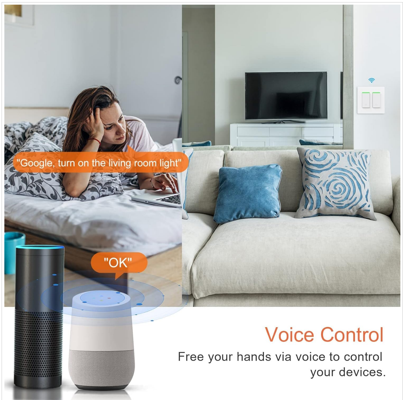
Image: Voice Control with Alexa and Google Assistant