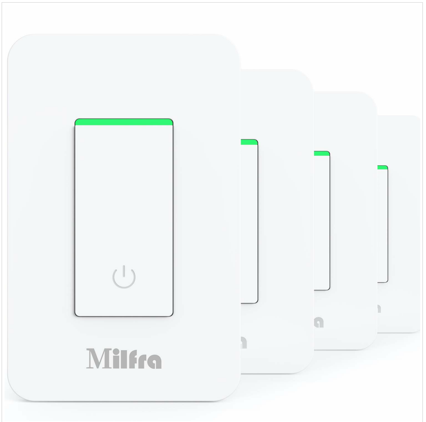
Image: Milfra Smart Light Switch 4-Pack