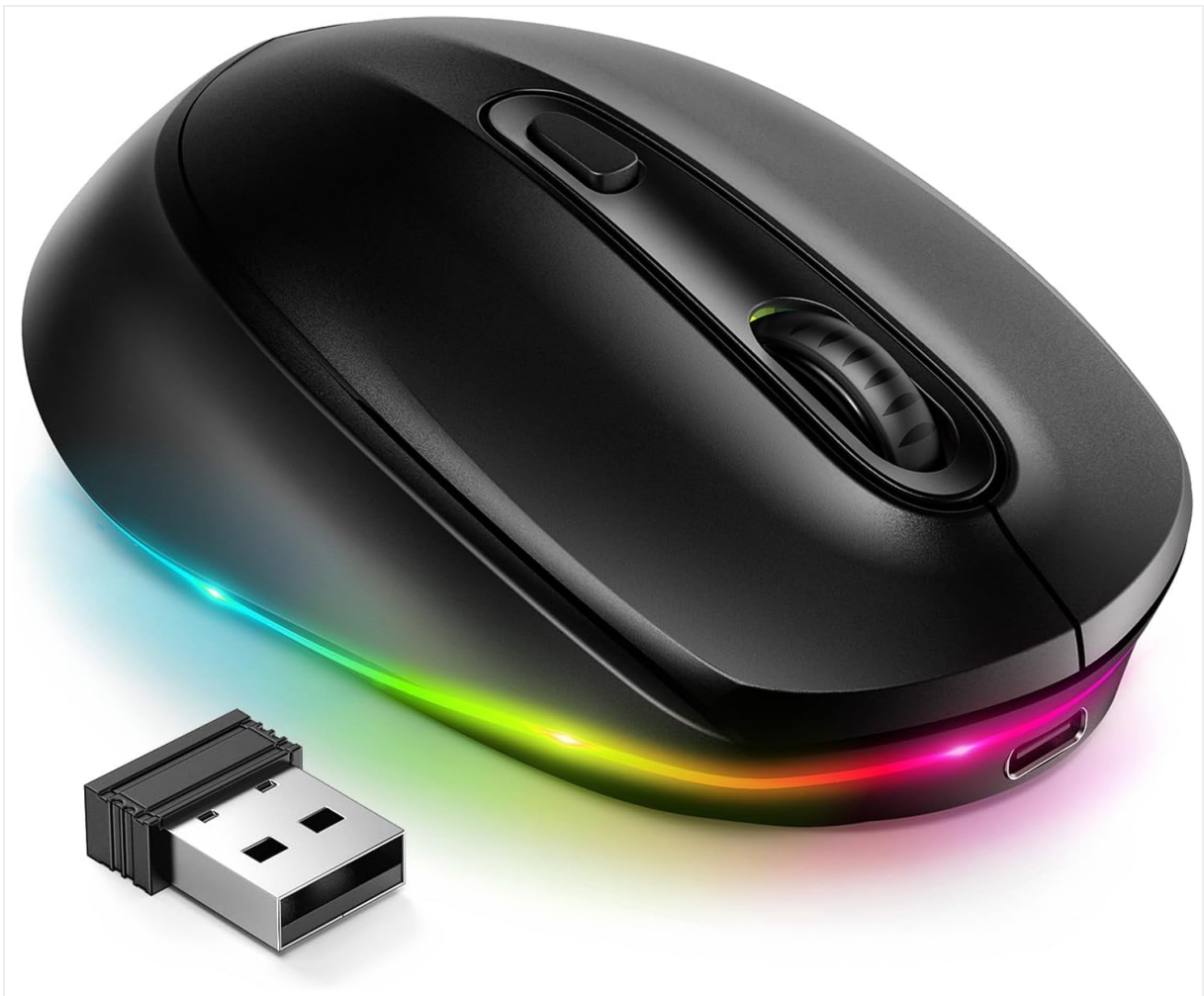
Image: The seenda Rechargeable Wireless Mouse in black, shown alongside its compact USB Nano receiver. The mouse features a subtle LED light strip along its base.