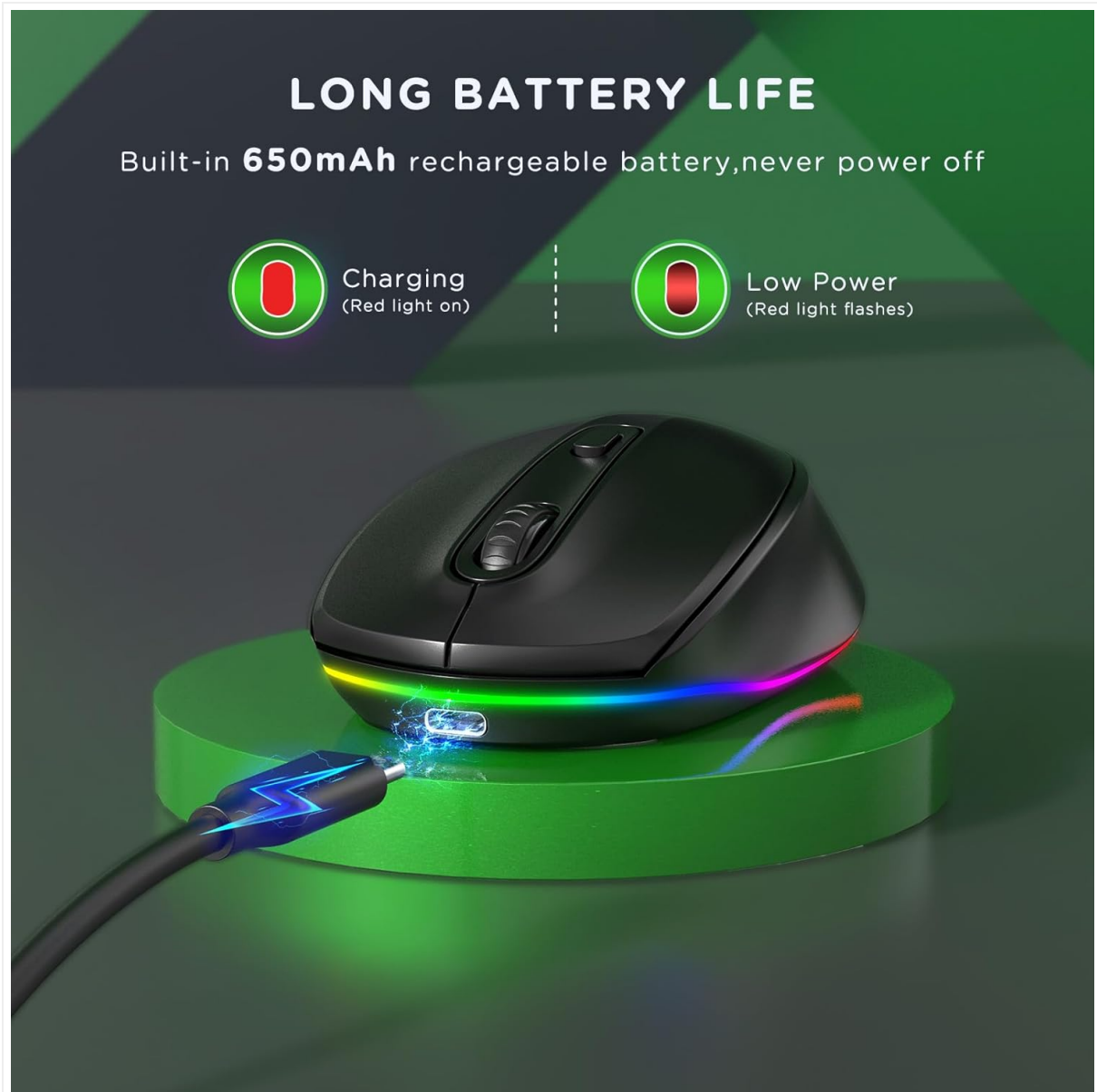
Image: The seenda wireless mouse connected to a charging cable. A green icon indicates a full charge, while a red icon indicates low power, with the red light flashing.

charging cable. The mouse features a built-in 650mAh rechargeable battery.