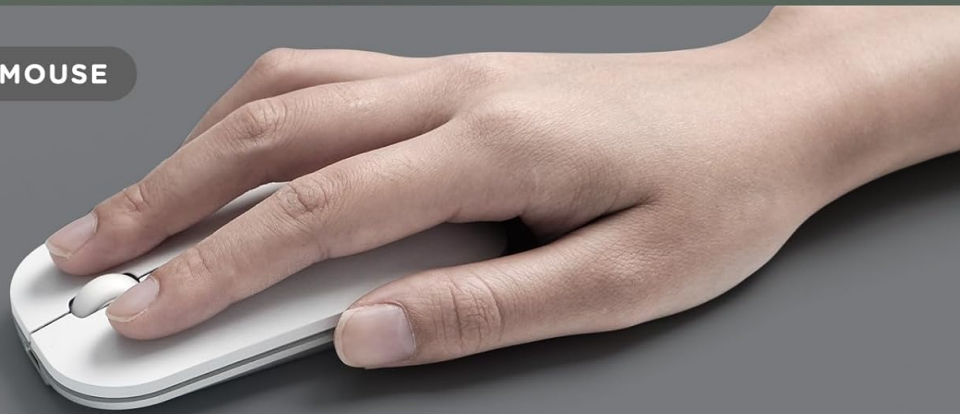
Image: A hand comfortably resting on the seenda mouse, illustrating its ergonomic design for reduced wrist strain.