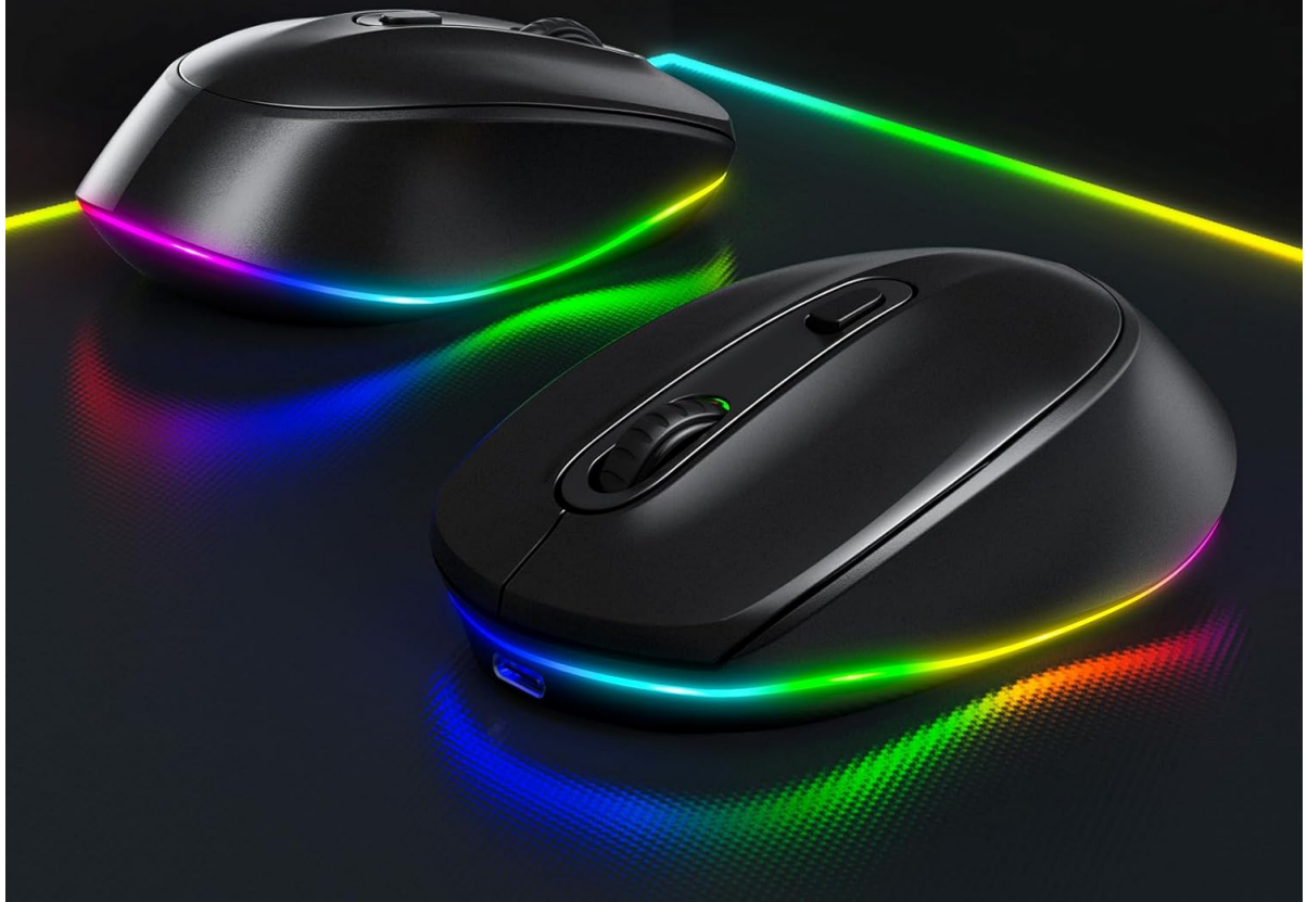
Image: Two seenda wireless mice showcasing their switchable LED lights, with vibrant colors emanating from their bases.

Comes with 15 backlight modes and you can easily switch them by a single button