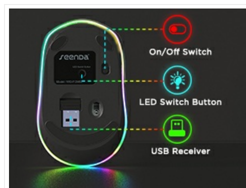
Image: An illustration of the bottom of the seenda mouse, highlighting the location of the On/Off Switch, LED Switch Button, and the USB Receiver storage slot.

The USB Nano receiver is conveniently stored in a compartment on the bottom of the mouse. Gently slide open the compartment cover and remove the receiver.