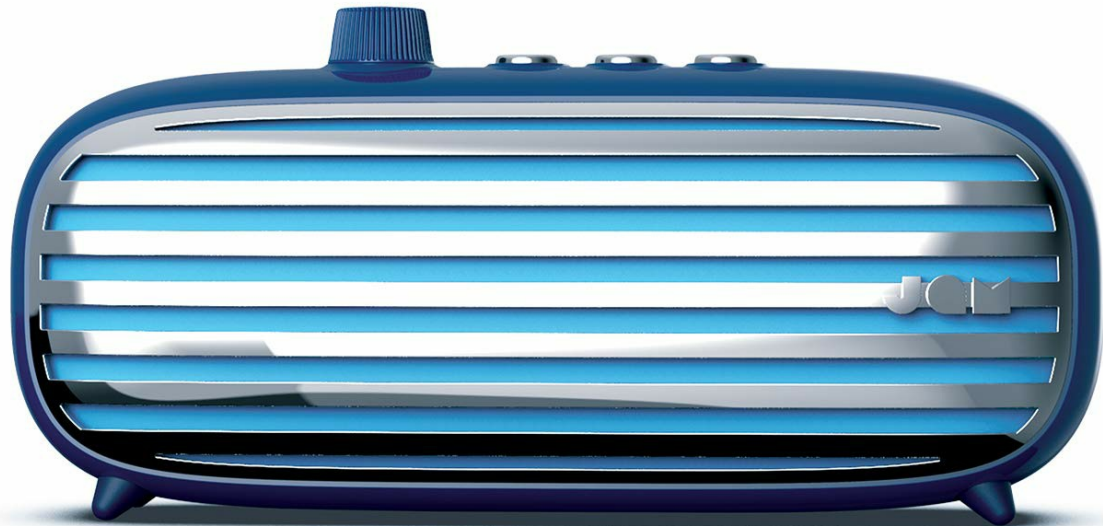
Image: A blue JAM Retro Classic+ Bluetooth Speaker with its volume dial illuminated in blue, indicating it is powered on.