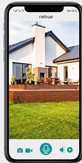
Image 4.1: Visual guide for the three main setup steps: power connection, app download, and live view activation.