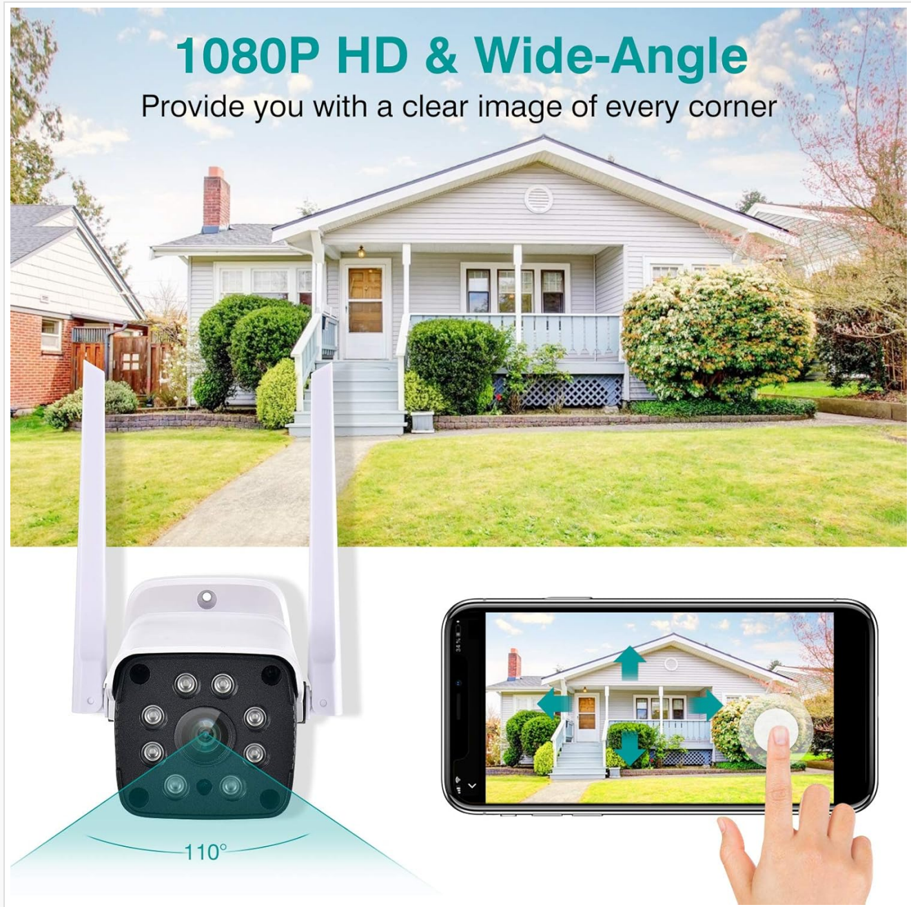
Image 2.1: Illustration of the camera's 1080P HD and wide-angle viewing capability.