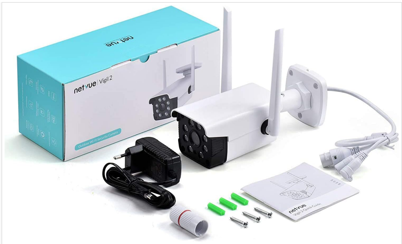
Image 3.1: All items included in the NETVUE Outdoor Security Camera package.