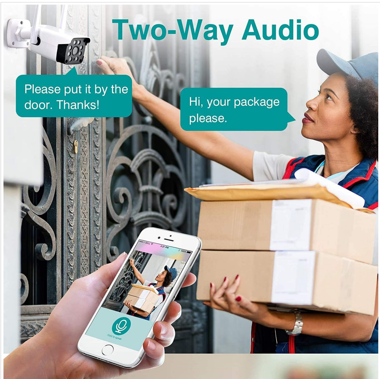
Image 5.2: Depiction of the two-way audio feature, showing a user speaking through the app to a person at the door.