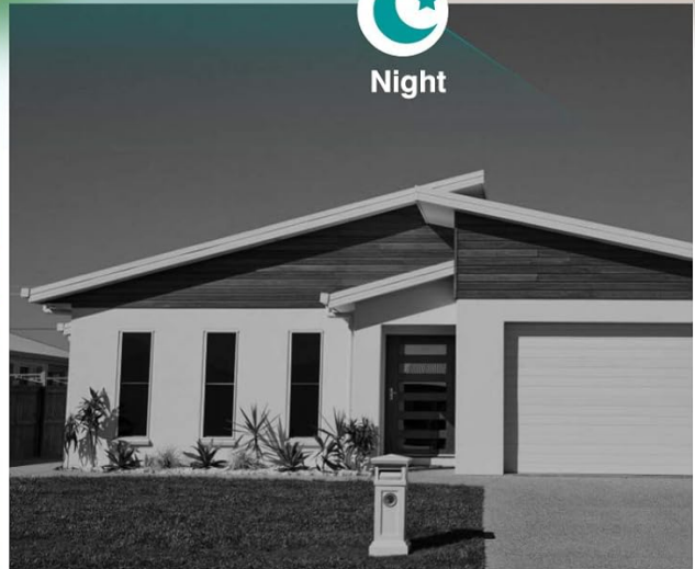
Image 2.2: Demonstration of the camera's Super Night Vision feature, showing day and night views.