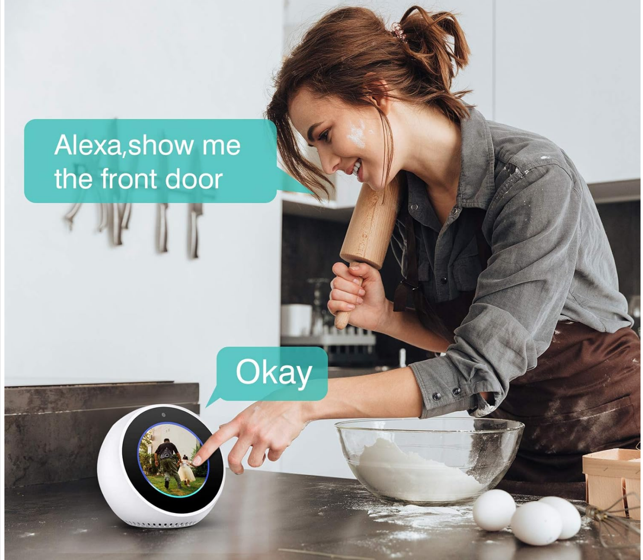
Image 5.3: A user interacting with an Alexa device to view the camera feed, demonstrating smart home integration.