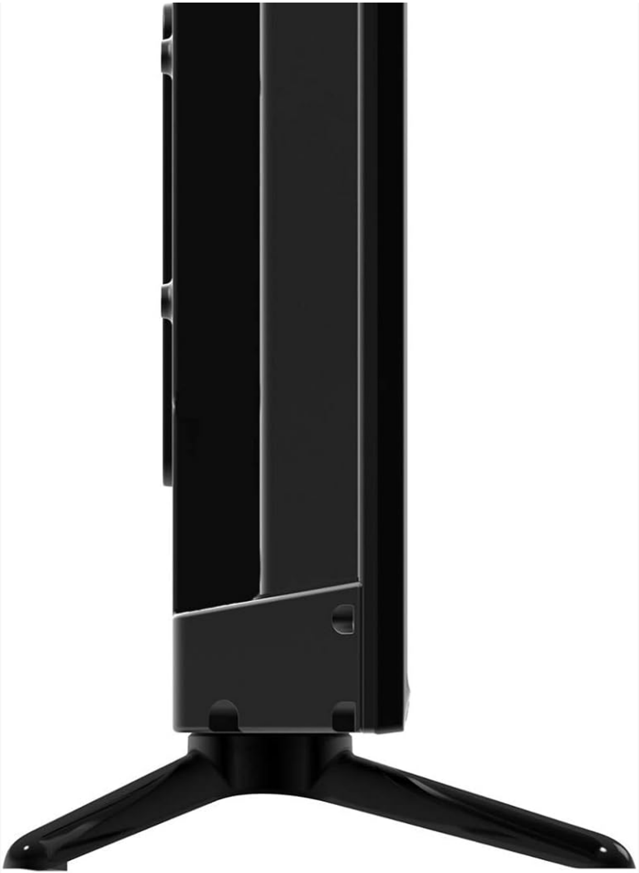
Right Side View: Illustrates the slim profile of the television.