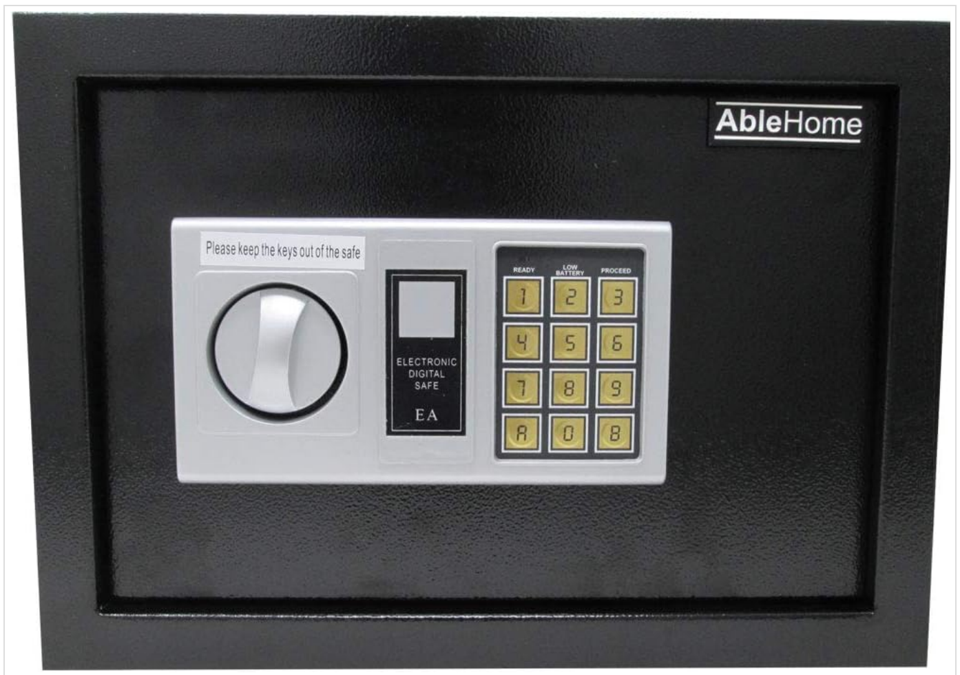
Image: A detailed view of the electronic keypad, showing the number buttons and indicator lights.