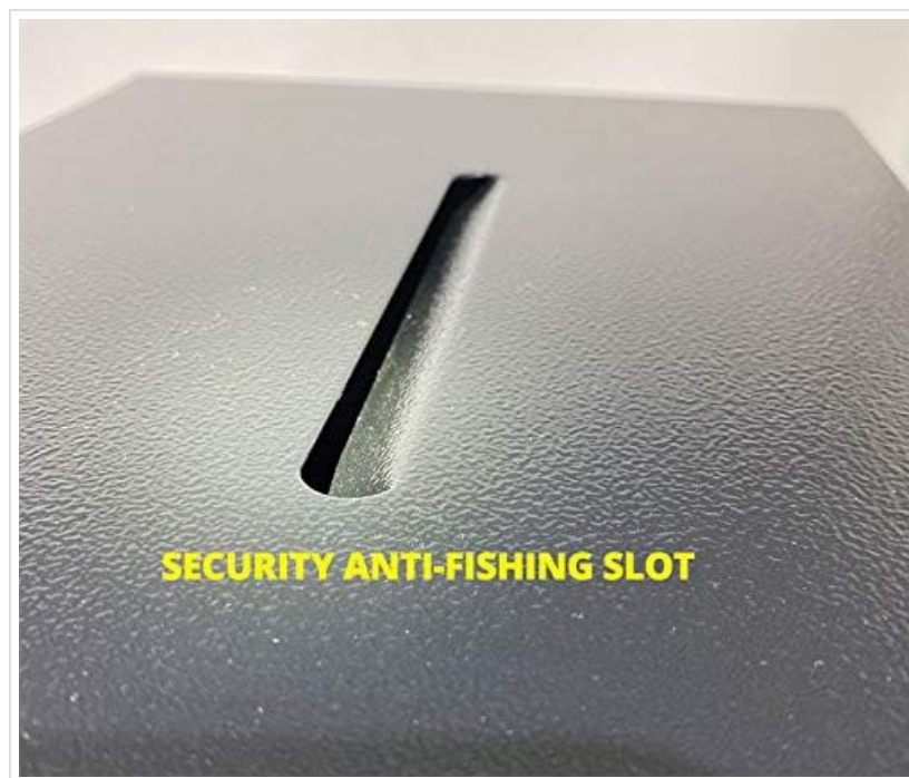
Image: The top deposit slot, highlighting its anti-fishing design to prevent removal of deposited items.