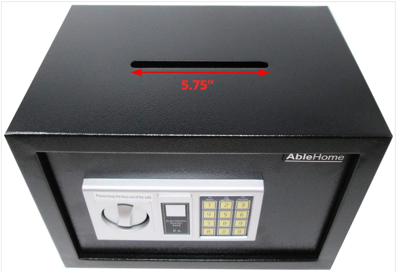
Image: A close-up view of the top deposit slot, indicating its dimensions for various items.