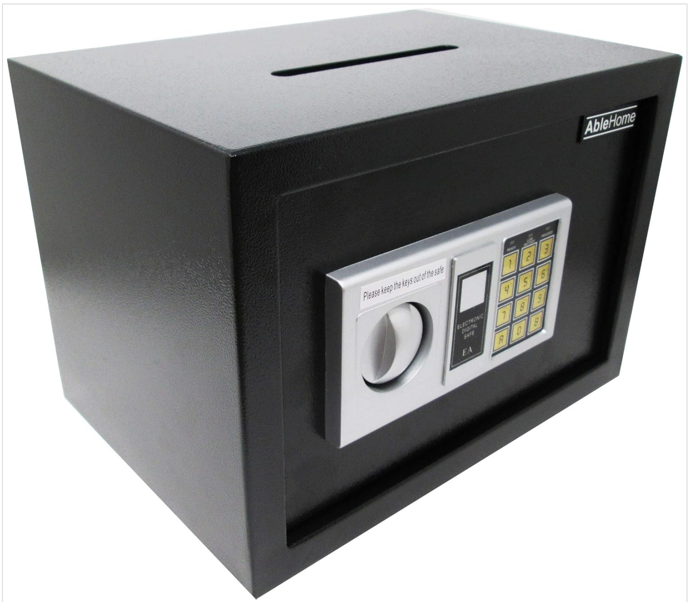
Image: The AbleHome Electronic Digital Cash Drop Depository Safe, showcasing its compact design and electronic keypad.