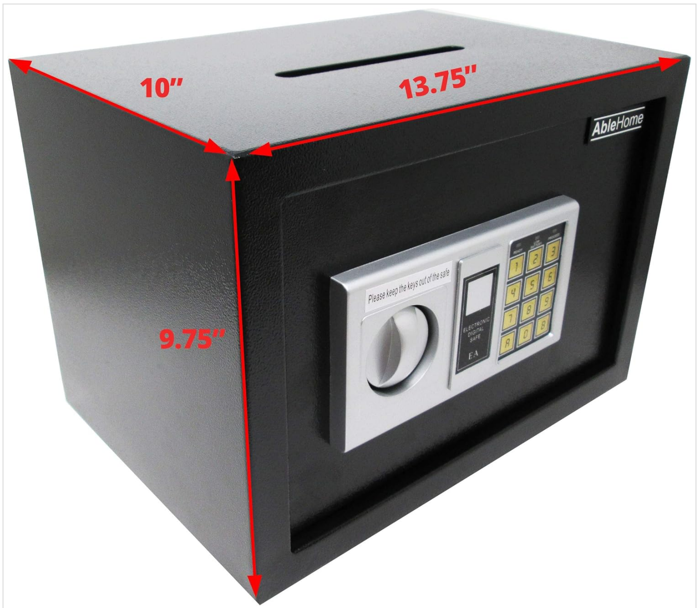
Image: The safe with key dimensions indicated: 13.75" (width), 10" (depth), 9.75" (height).