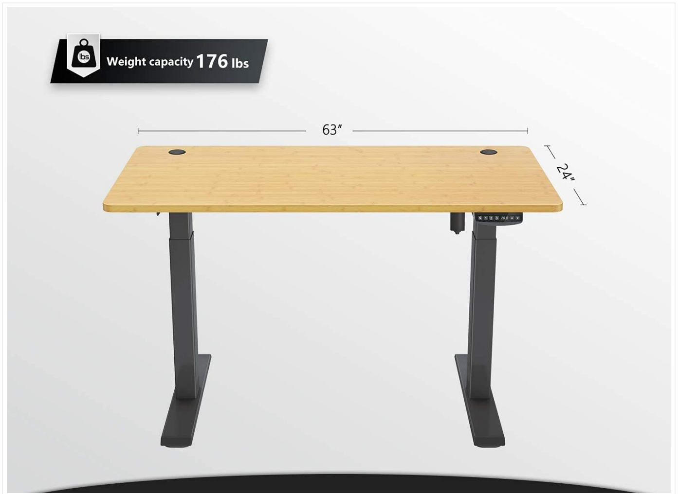
Image: The desk's dimensions and maximum weight capacity are displayed.

Cable Management: The desk includes a cable tray for organizing power cords and other cables, contributing to a tidy and safe workspace.