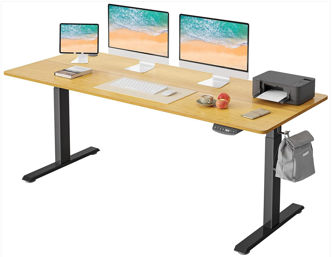
Image: The FEZIBO electric standing desk in a typical setup, highlighting the control panel.

Height Adjustment: The desk can be adjusted between 28.3 inches and 45.5 inches (or 30.3 inches to 48.5 inches if detachable lockable casters are installed). Use the up and down arrow buttons on the control panel to precisely adjust the desk to your desired height. The desk moves at an average speed of 0.8 inches per second with minimal noise.