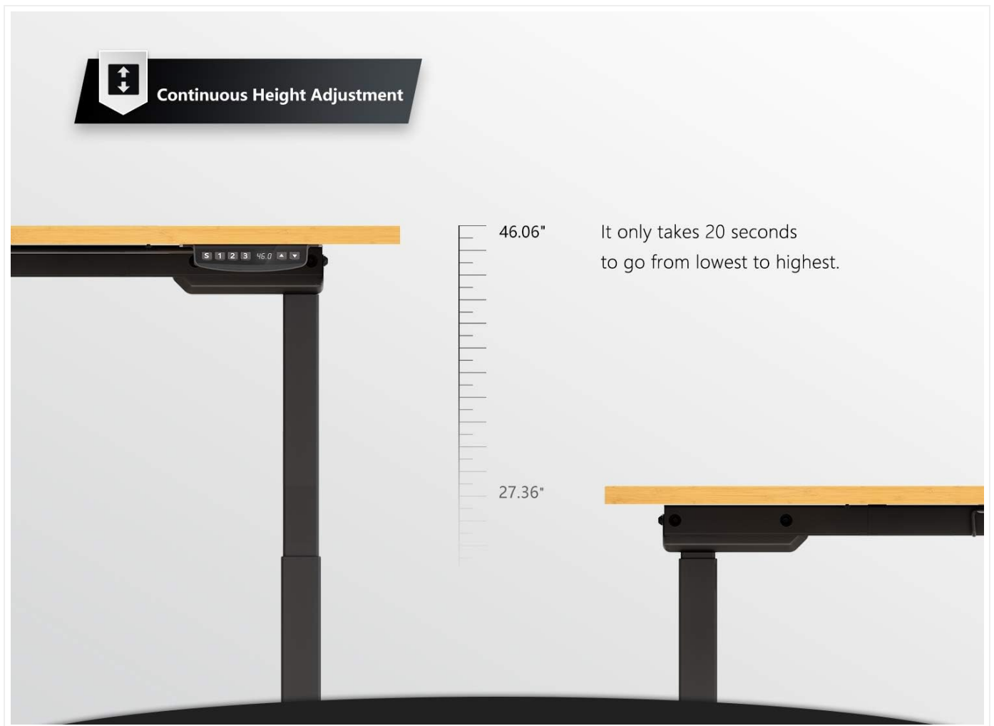
Image: Visual representation of the desk's continuous height adjustment capability.

Memory Height Settings: The control panel features 3 programmable memory height buttons (labeled 1, 2, 3). To save a preferred height, adjust the desk to the desired position, then press the 'S' button followed by one of the numbered memory buttons (1, 2, or 3). The desk will then move to this saved height with a single press of the corresponding memory button.