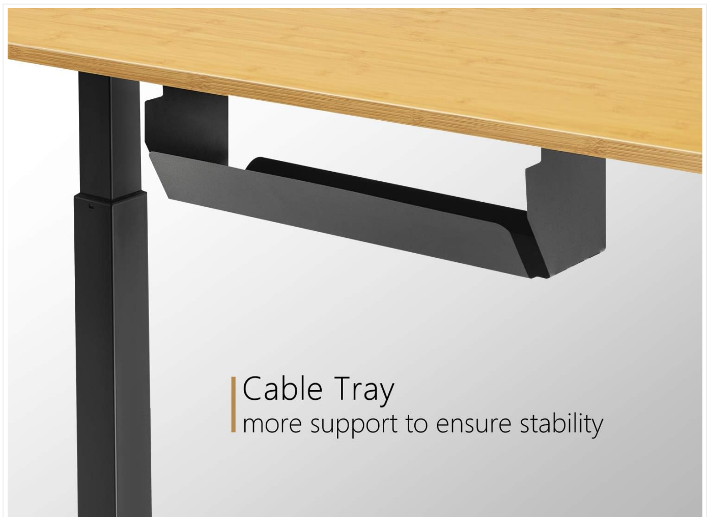
Image: The integrated cable tray provides support and helps maintain stability by organizing cables.