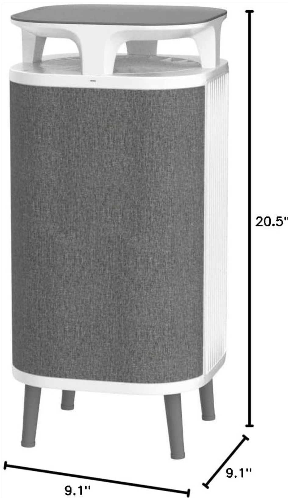
Figure 6: Product dimensions for the Blueair DustMagnet 5240i.