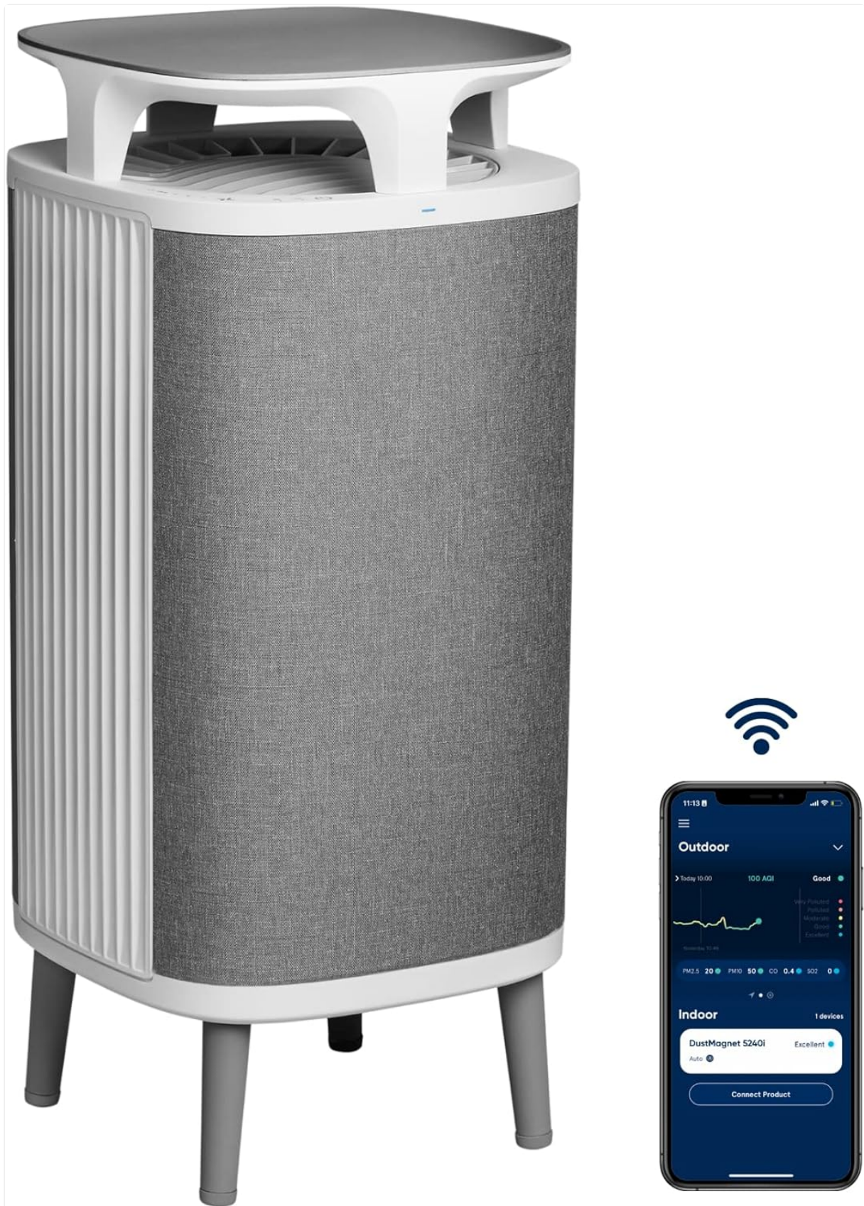
Figure 1: Blueair DustMagnet 5240i Air Purifier in a home environment, showcasing its design and integration.

store. Follow the in-app instructions to connect your air purifier to your home Wi-Fi network. This unlocks smart features and real-time air quality tracking.