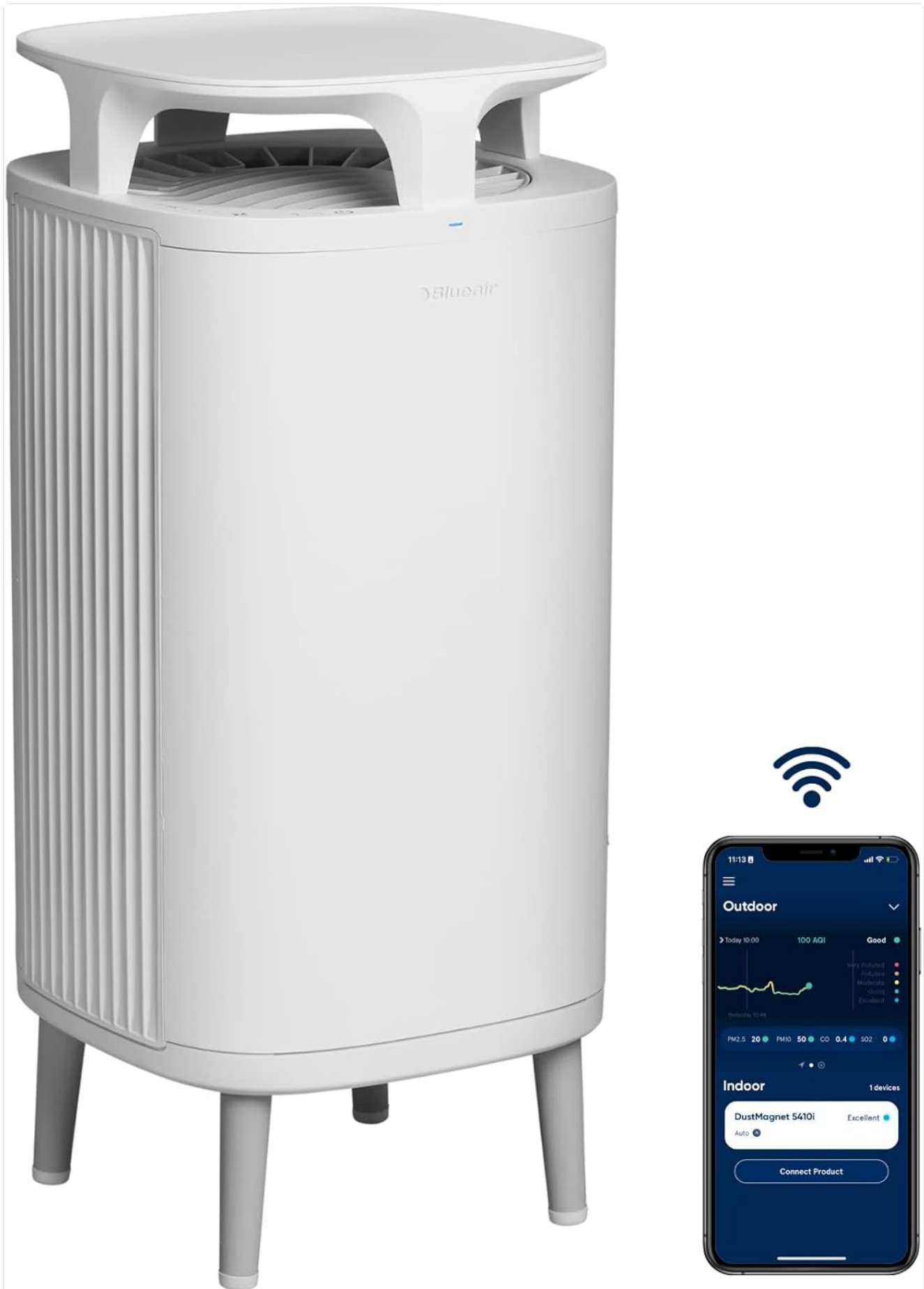
Figure 3.1: BLUEAIR DustMagnet 5410i Air Purifier and App Interface

This image shows the complete air purifier unit in white, featuring its unique design with a top air outlet and side air inlets. A smartphone next to it displays the Blueair app, illustrating smart control capabilities.