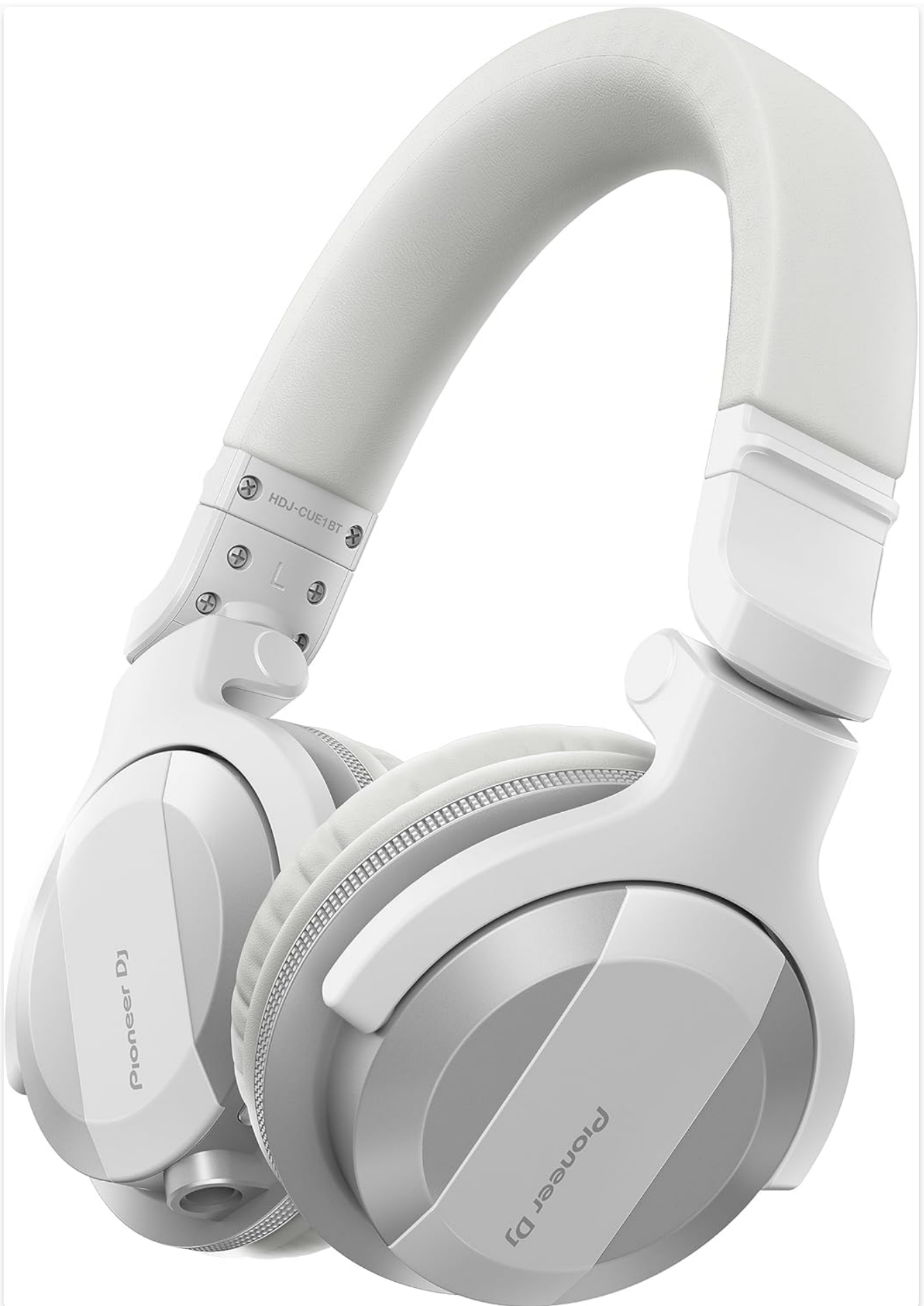
Image 3.1: Side view of the headphones, illustrating the location of the audio input and control buttons on the earcup.