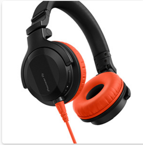
Image 5.1: An earcup shown swiveling 90 degrees, highlighting the flexibility for single-ear monitoring during DJ performances.