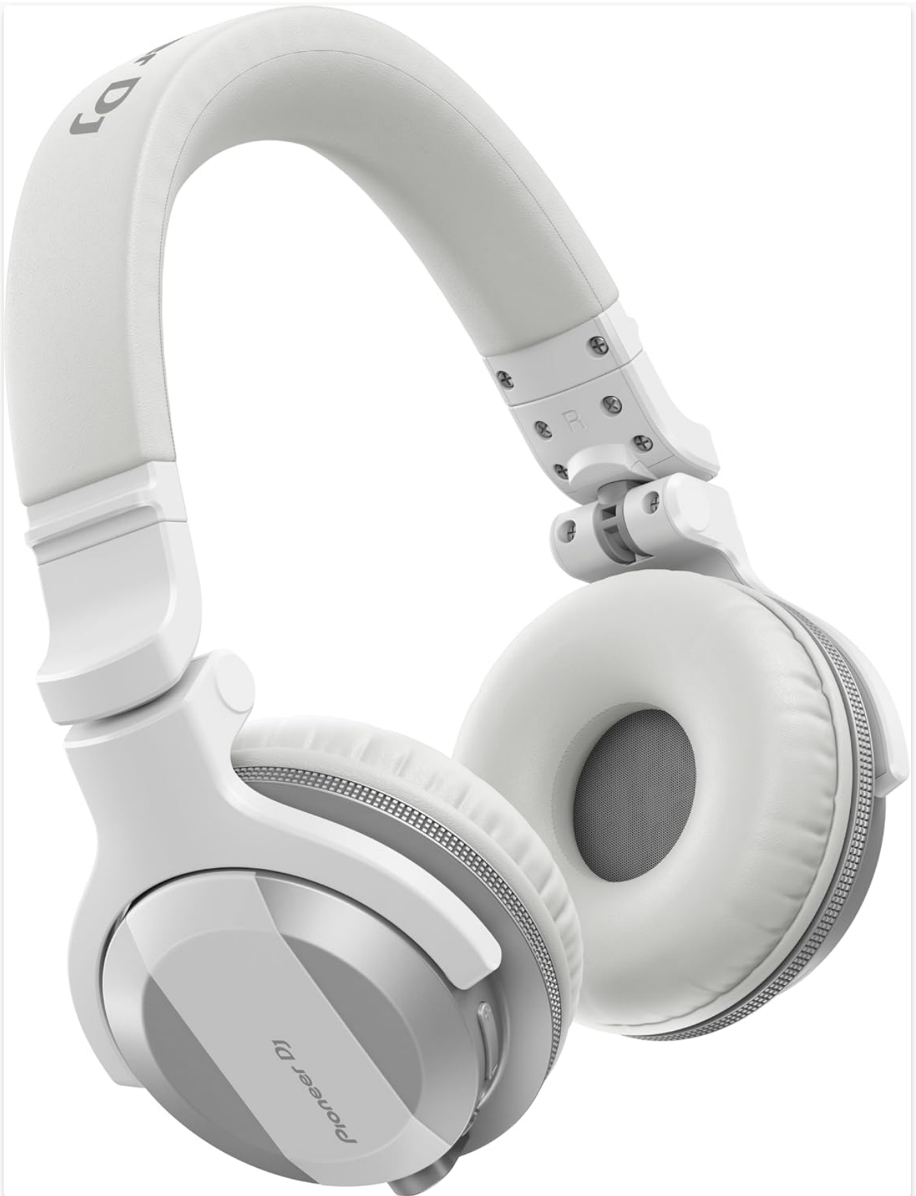
Image 1.1: Pioneer DJ HDJ-CUE1BT Bluetooth DJ Headphones, front-angled view. These headphones feature a sleek white design with cushioned earcups and a flexible headband.