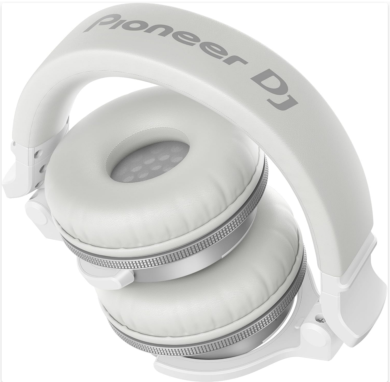
Image 6.1: The Pioneer DJ HDJ-CUE1BT headphones shown in their folded configuration, demonstrating their portability and ease of storage.