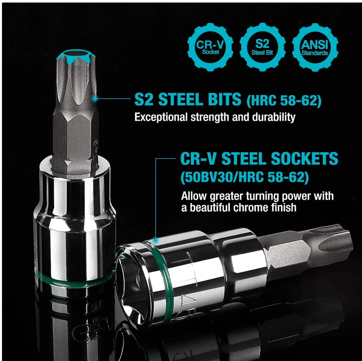
Image: A detailed view highlighting the S2 steel bit and the CR-V steel socket, emphasizing their robust construction and chrome finish.