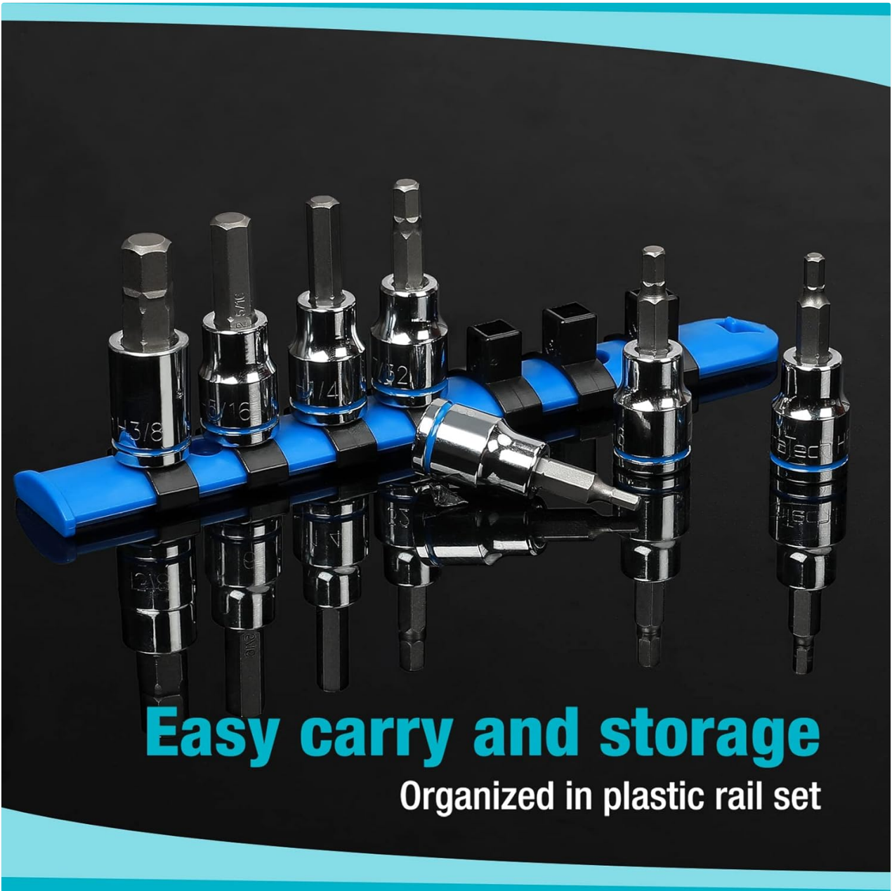
Image: The bit sockets neatly arranged on their plastic storage rails, demonstrating the convenient organization for easy carrying and storage.