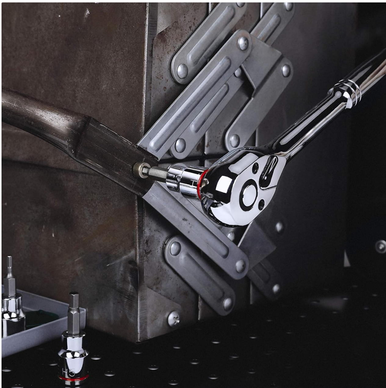
Image: The bit socket attached to a ratchet, demonstrating its application on a mechanical component, showcasing the secure fit.