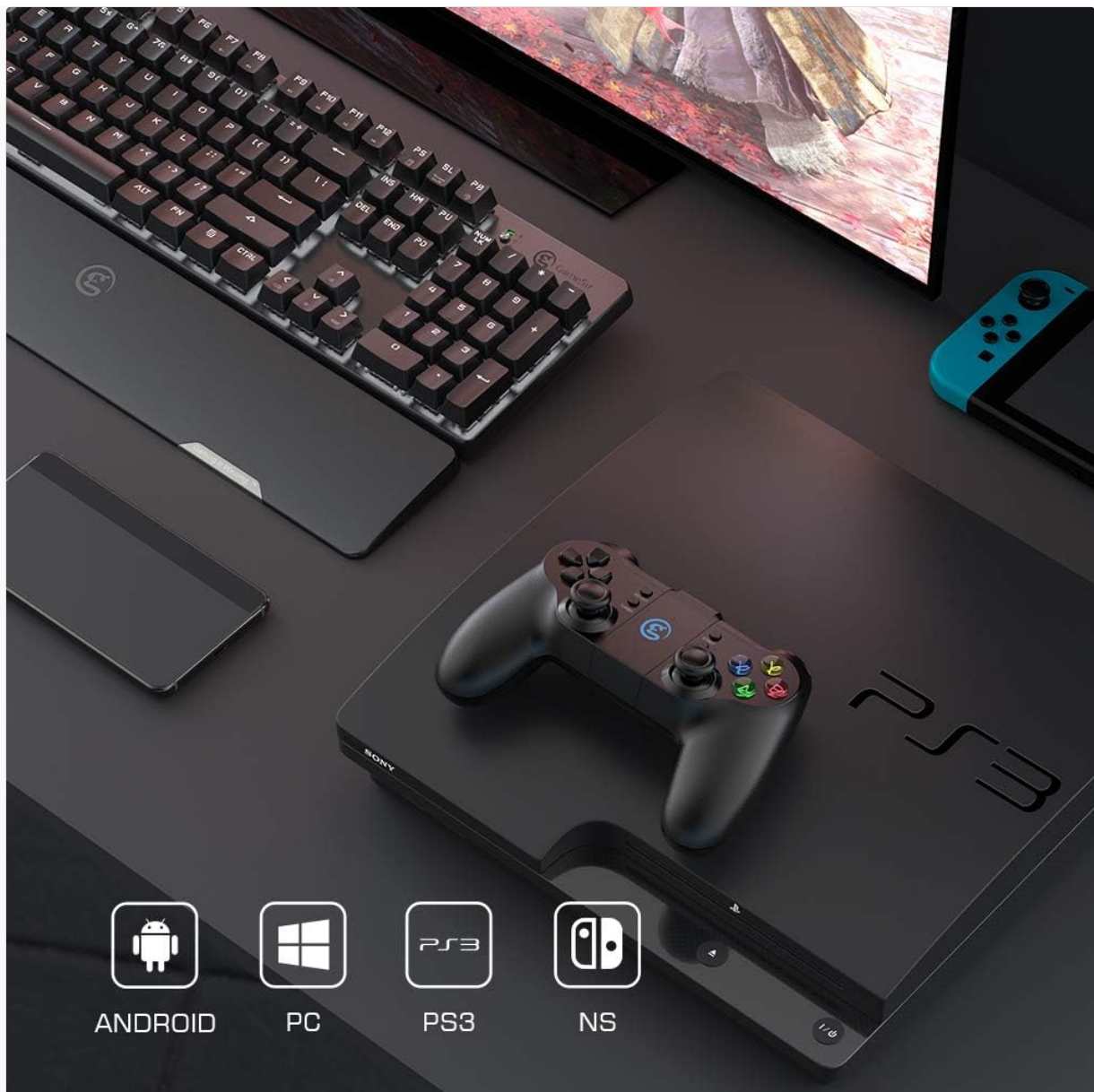
Image: The GameSir T1s controller on a desk with a PC, PS3, and Nintendo Switch, illustrating its broad compatibility with Android, PC, PS3, and NS platforms.