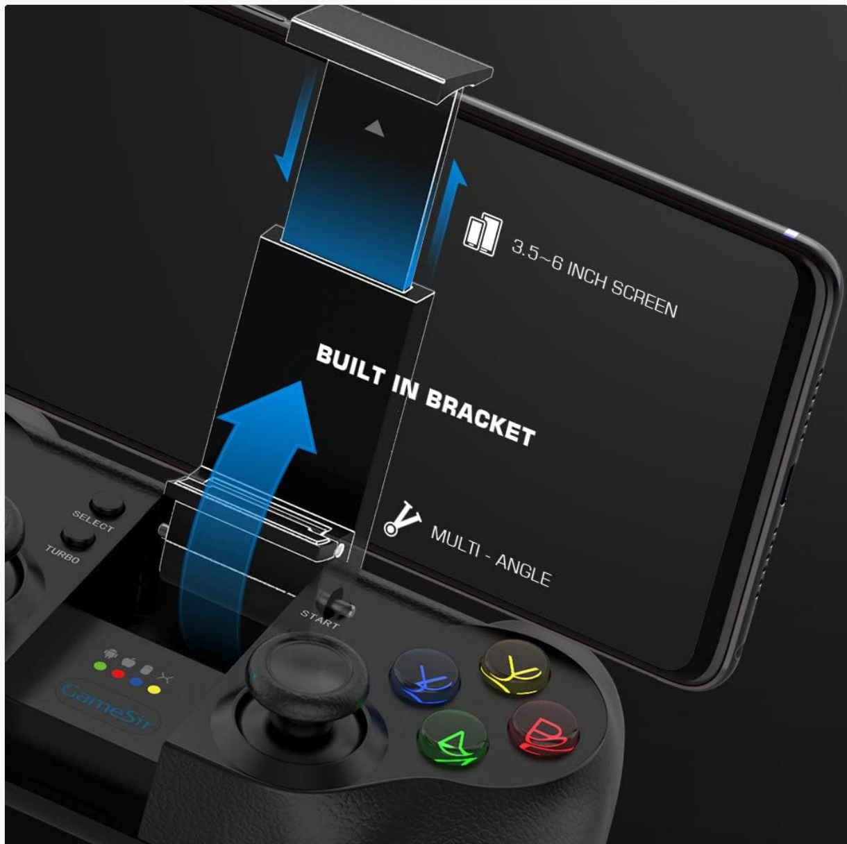
Image: A close-up view of the GameSir T1s controller demonstrating the built-in, retractable, and multi-angle bracket designed to hold smartphones.

The integrated, multi-angle bracket allows for securely mounting smartphones with screen sizes ranging from 3.5 to 6 inches, providing a convenient mobile gaming experience.