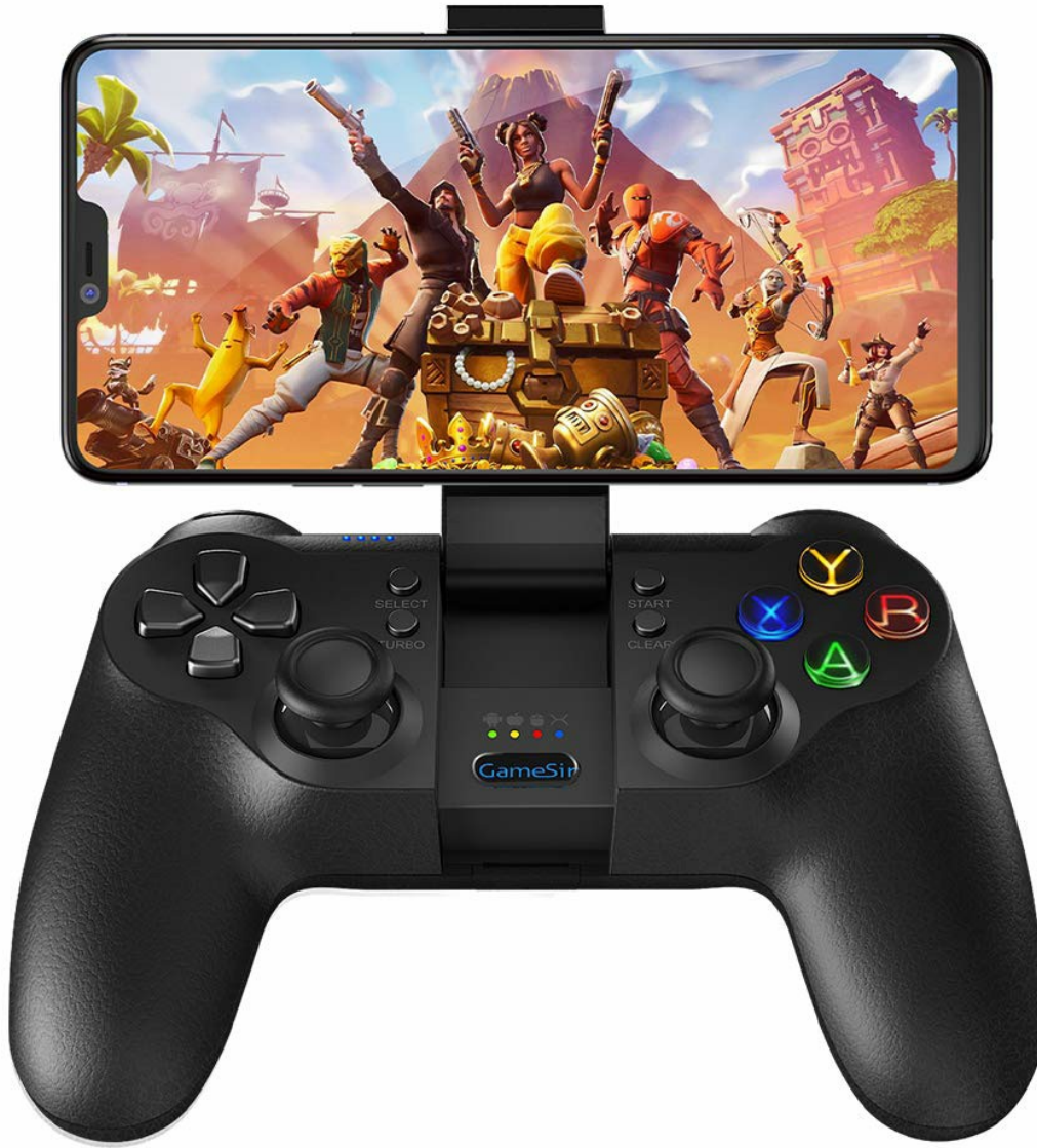
Image: The GameSir T1s Wireless Bluetooth Game Controller, showcasing its ergonomic design and button layout.