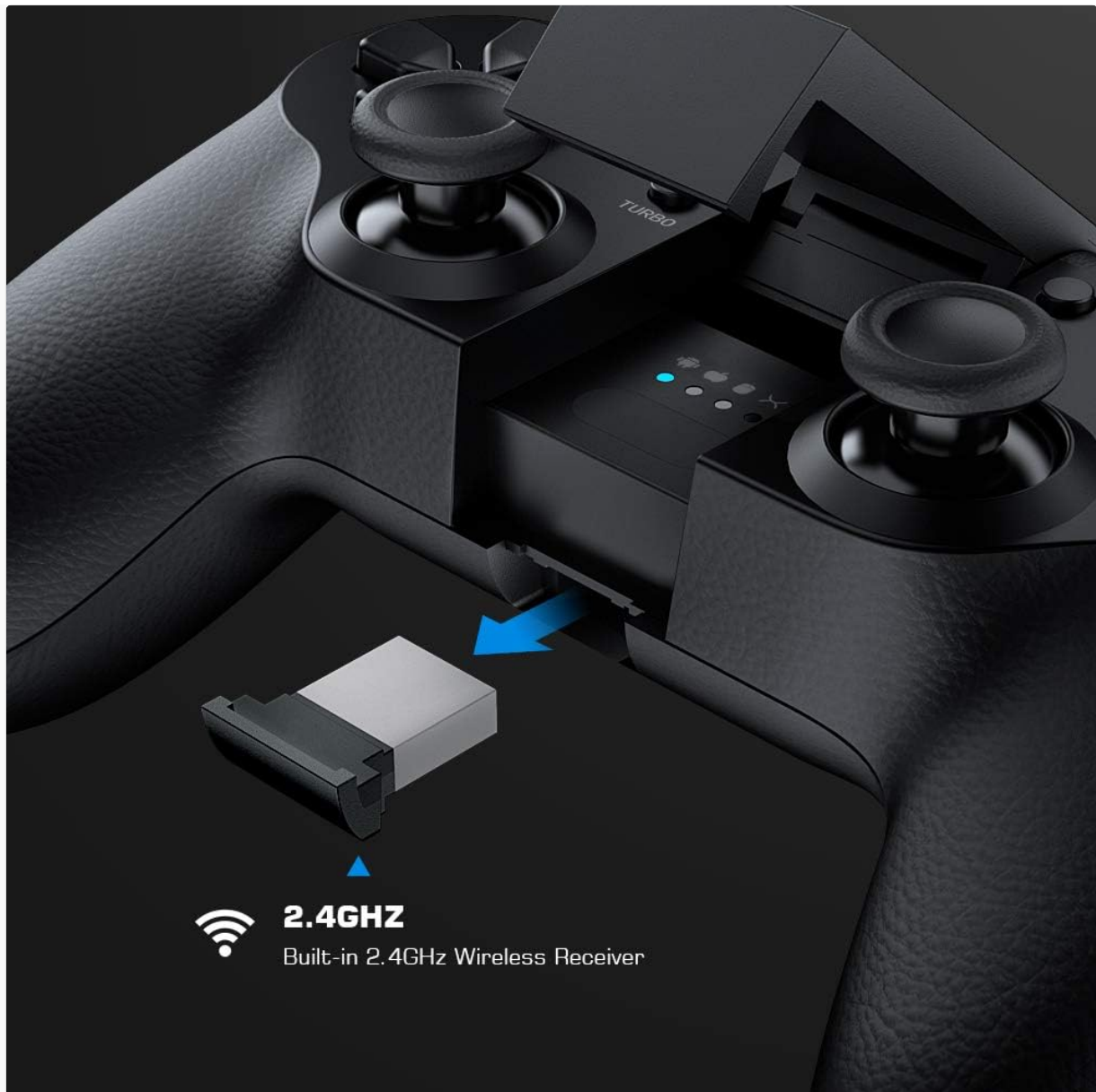
Image: A close-up view of the GameSir T1s controller, showing the built-in compartment for the 2.4GHz wireless receiver and an arrow indicating its removal.