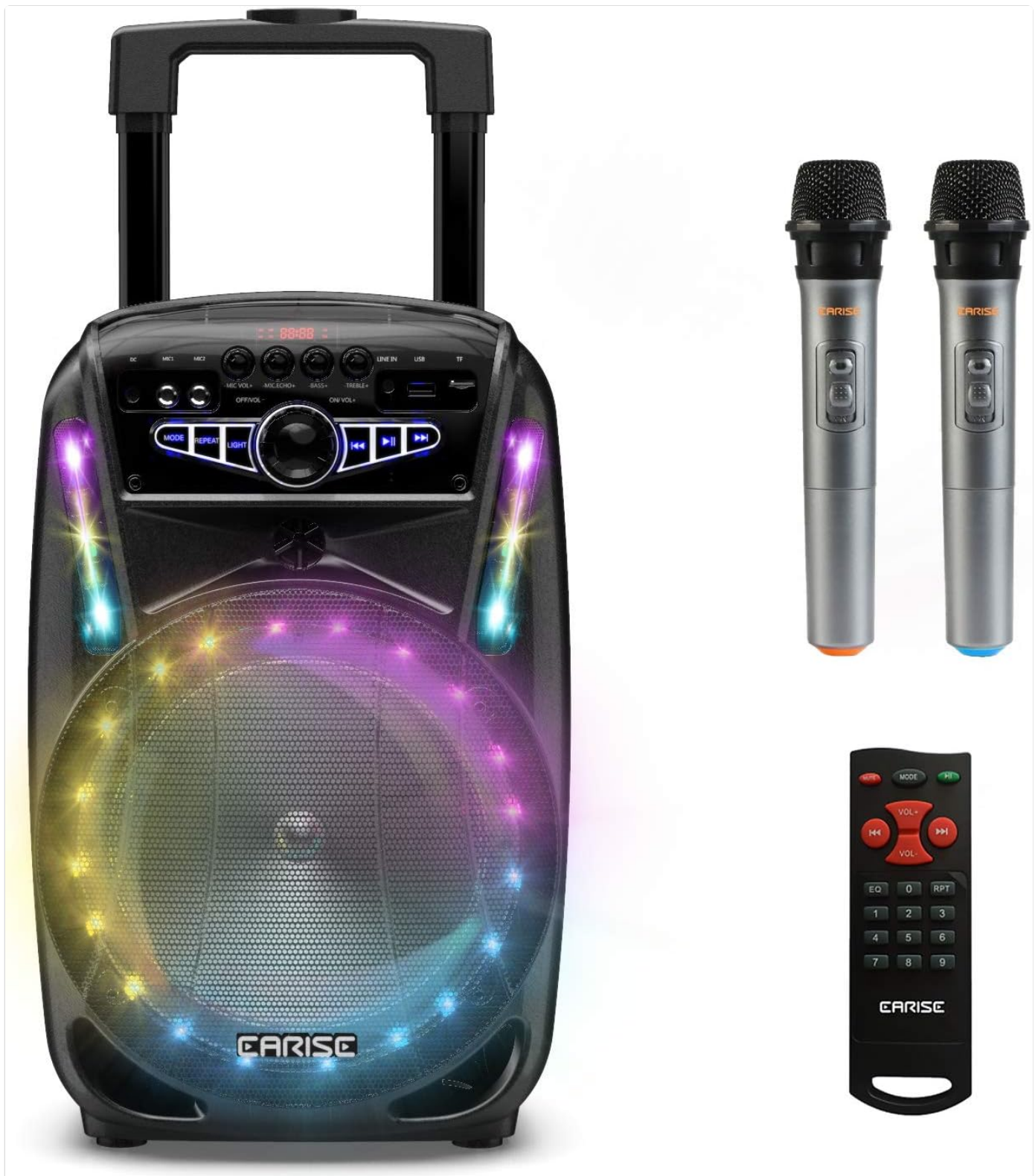
Image: The EARISE M15 Karaoke Machine, a black portable speaker with colorful LED lights on the front, shown with two wireless microphones and a remote control.