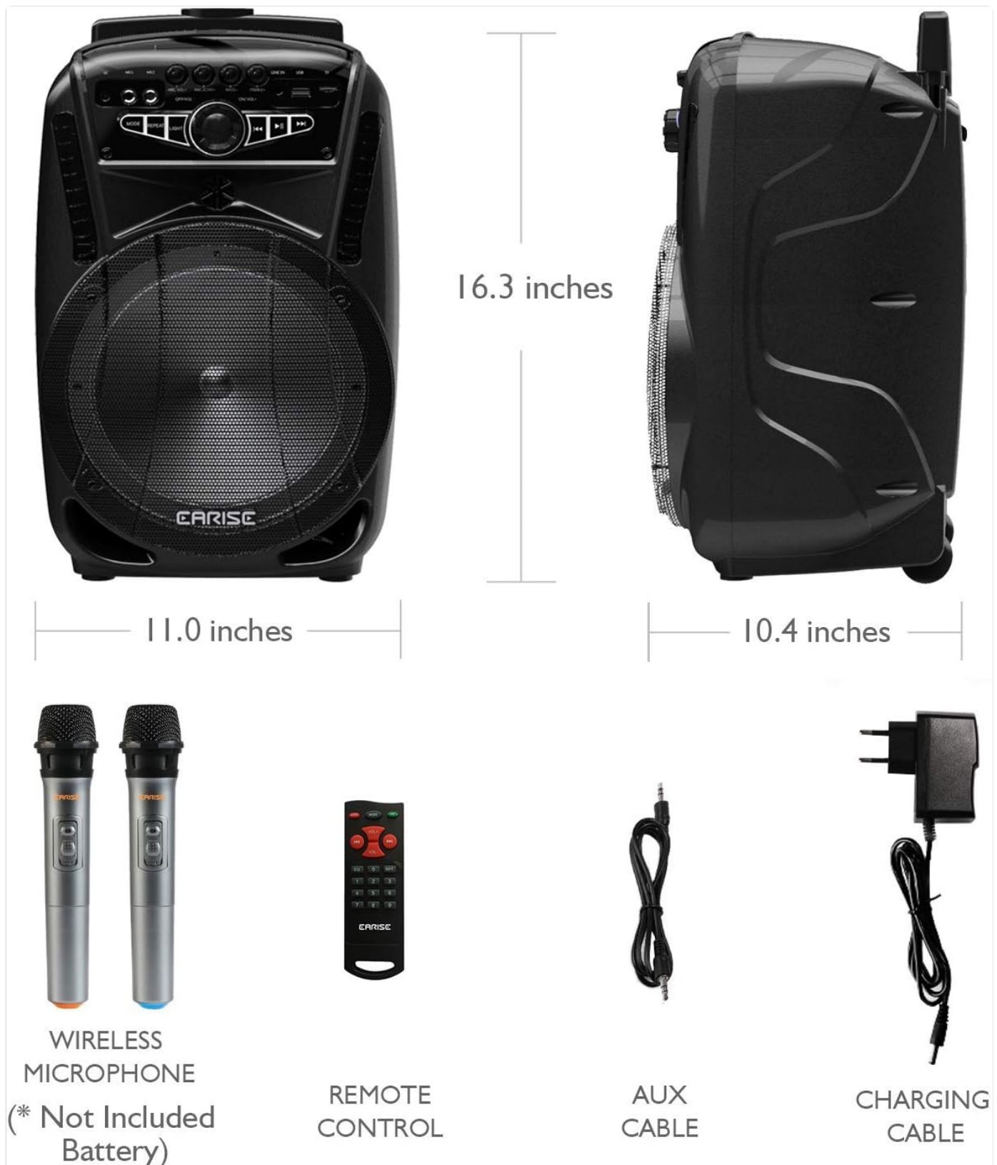
Image: A visual representation of the package contents, showing the M15 speaker, two wireless microphones, a remote control, an AUX cable, and a charging cable.