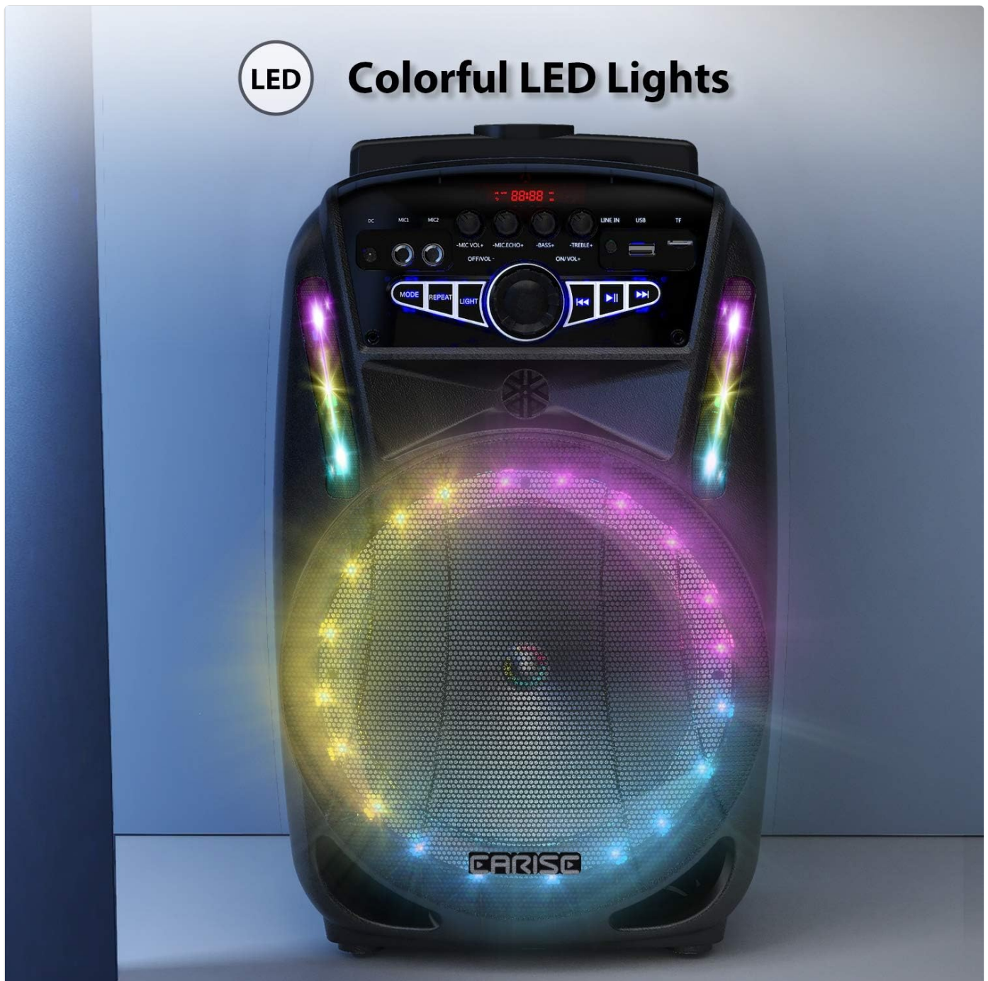
Image: The EARISE M15 speaker with its front-facing LED lights glowing in multiple colors, creating a vibrant visual effect.