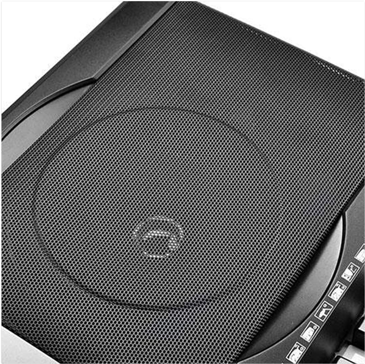
Image: A close-up view of one of the keyboard's integrated speakers, covered by a protective grill.