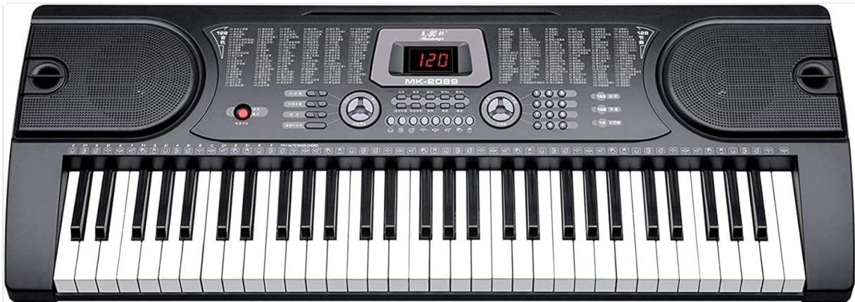
Image: The MK-2089 electronic keyboard, showcasing its 61 keys, control panel, LCD display, and the included music stand.

The MK-2089 is a 61-key electronic keyboard designed for both beginners and enthusiasts. It offers a comprehensive set of features to facilitate learning and creative expression, including a wide range of timbres and rhythms, a built-in metronome, and recording capabilities. This manual provides detailed instructions for setting up, operating, and maintaining your keyboard.