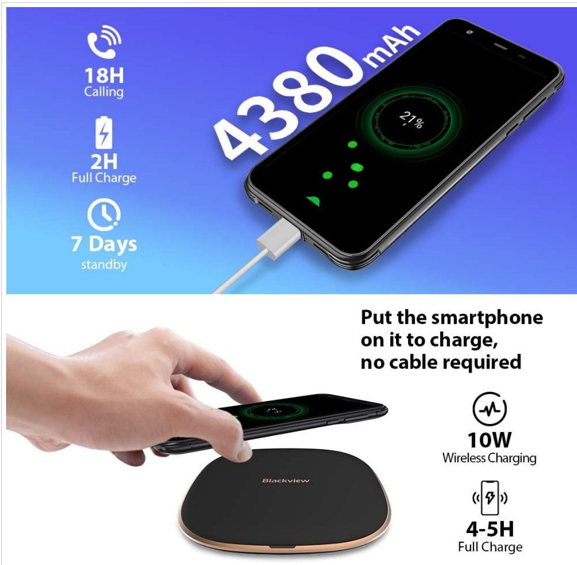
Image: The Blackview BV6300 Pro being charged via its USB-C port and also demonstrating wireless charging capability on a pad.