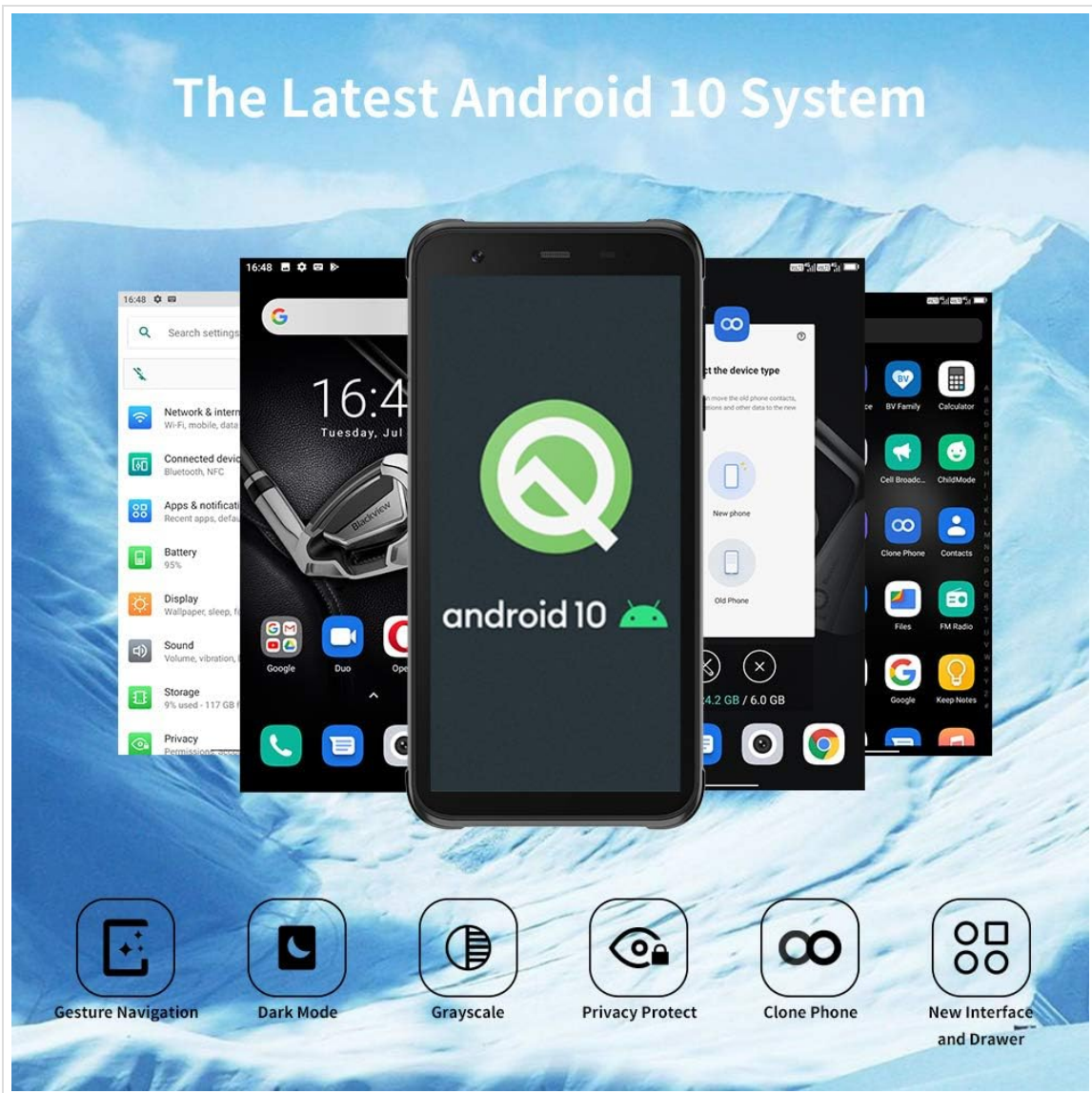
Image: Various screens of the Blackview BV6300 Pro showcasing the Android 10 operating system, including settings, home screen, and feature icons like Gesture Navigation and Dark Mode.