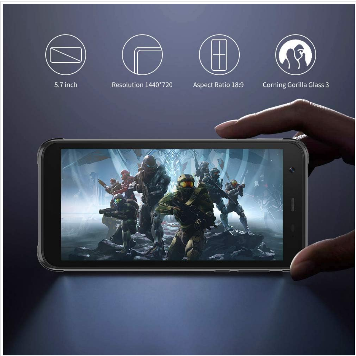
Image: The Blackview BV6300 Pro held in a hand, displaying its 5.7-inch screen with a resolution of 1440x720, an 18:9 aspect ratio, and Corning Gorilla Glass 3 protection.