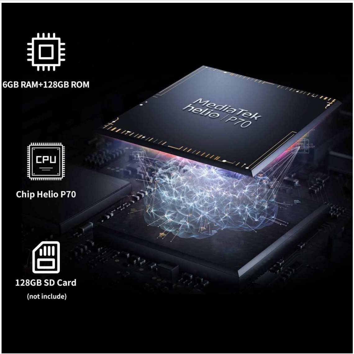
Image: An illustration of the Blackview BV6300 Pro's internal components, highlighting the CPU (MediaTek Helio P70), 6GB RAM, and 128GB ROM, with an indication for an optional 128GB SD card.