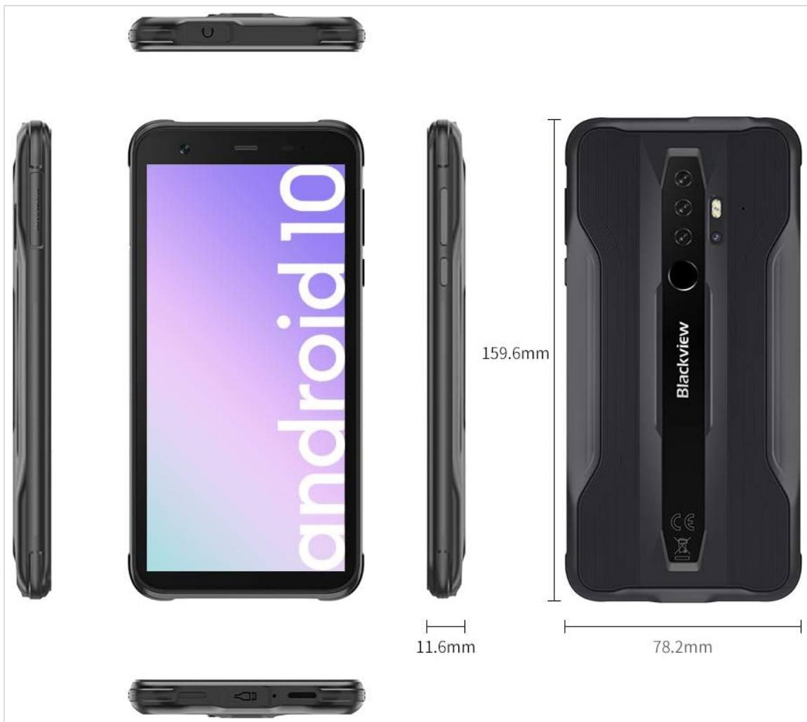
Image: Technical drawing of the Blackview BV6300 Pro showing its dimensions: 159.6mm height, 78.2mm width, and 11.6mm thickness.