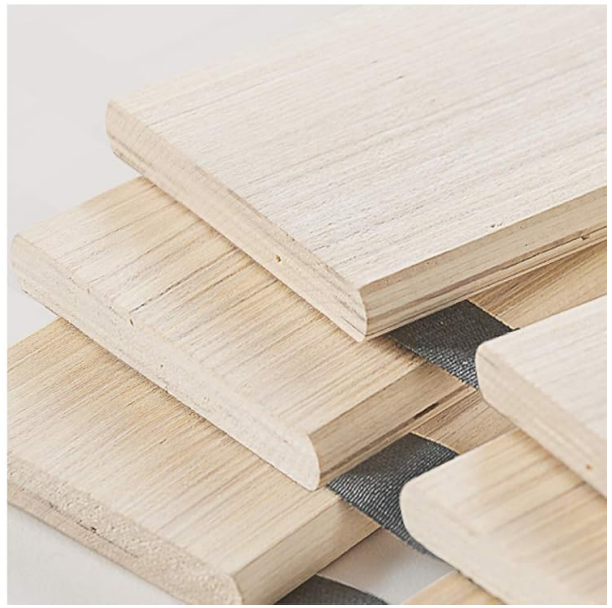
Image: Detail of the wood slats, which attach with Velcro for stability and noise reduction.