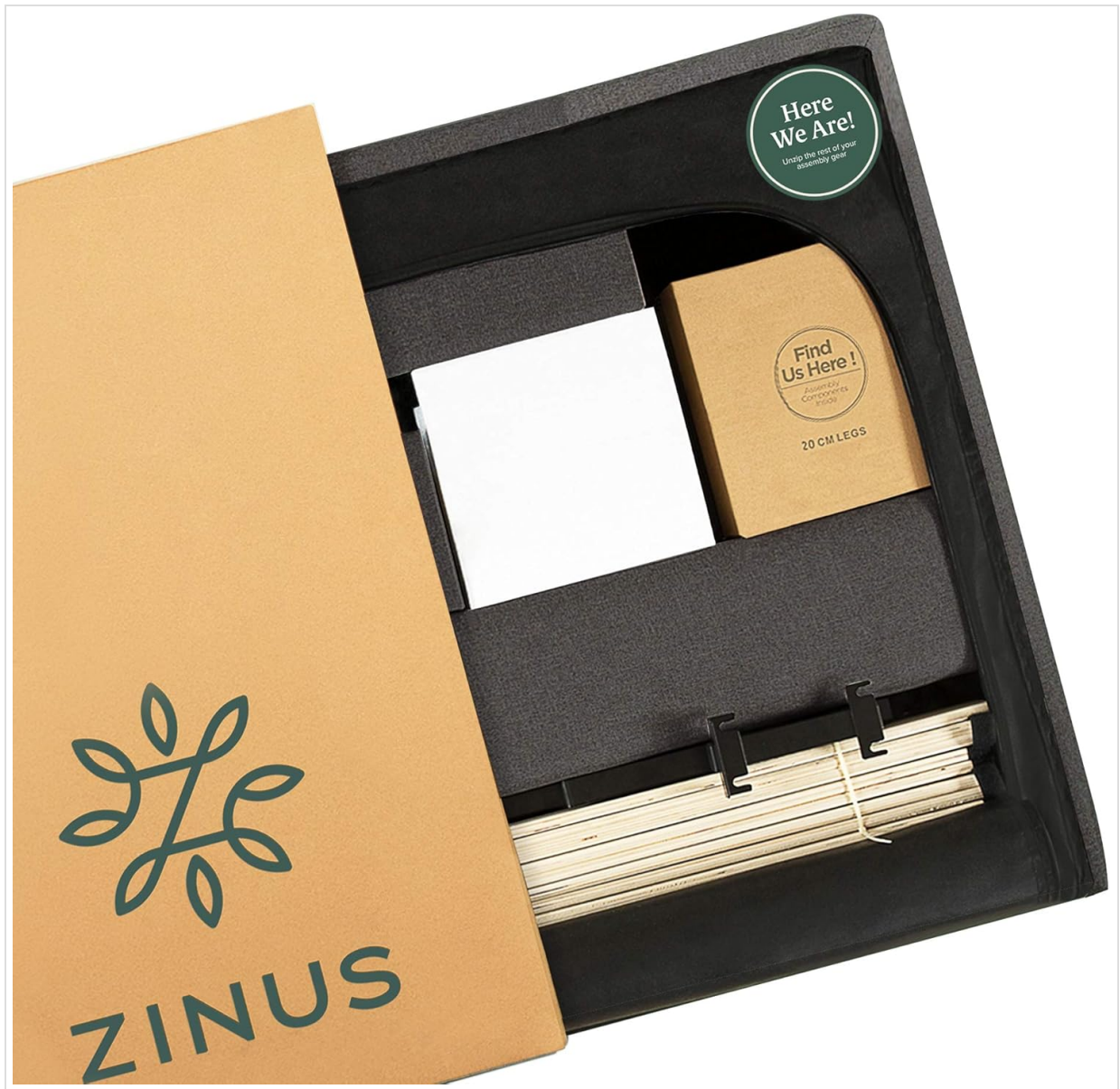
Image: All bed frame components and tools are securely stored within the headboard's zippered compartment for easy access.