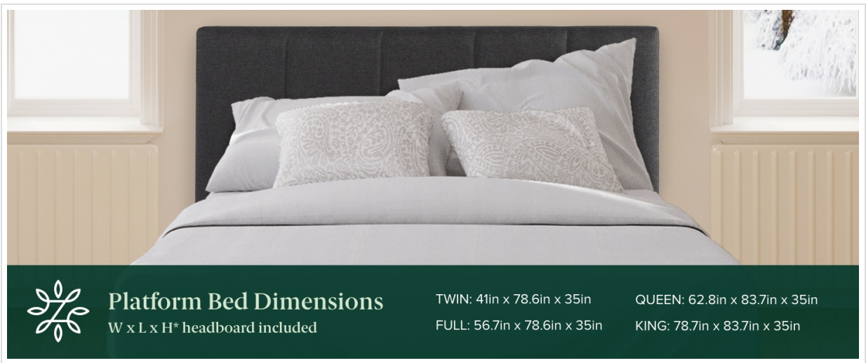
Image: Detailed dimensions for various sizes of the Maddon Platform Bed, including the Twin size (78.6"L x 41"W x 35"H).