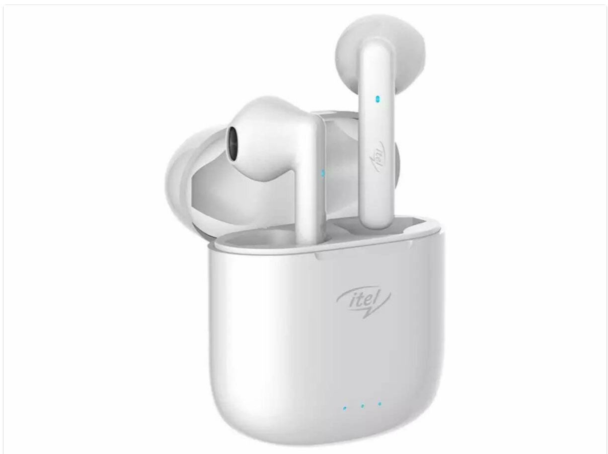
Image: Itel ITW-60 Truly Wireless Earbuds placed inside their open charging case, ready for use or charging.