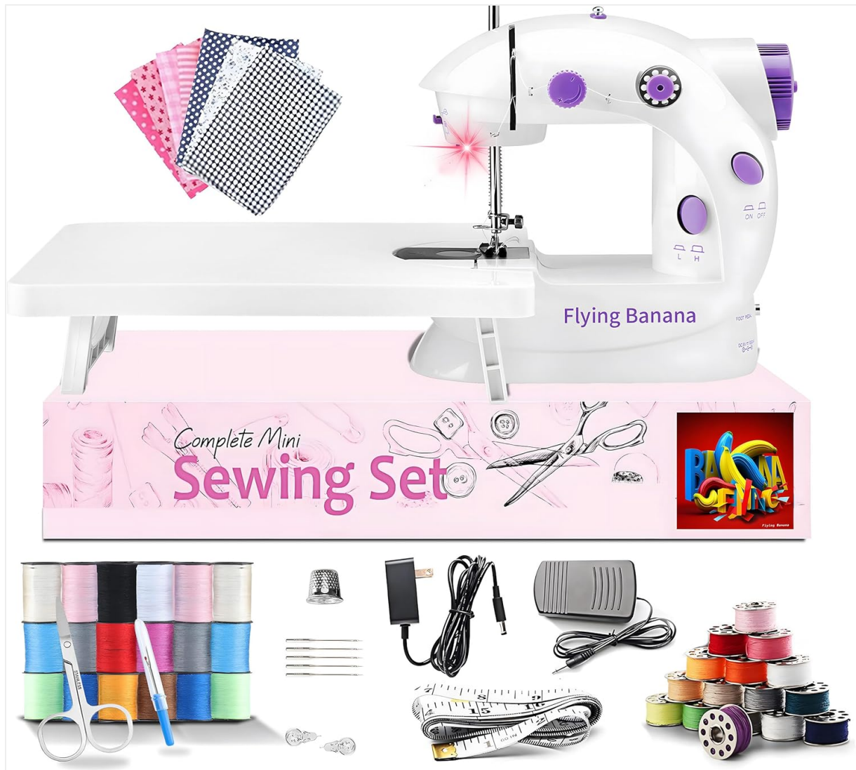
This image displays the Flying Banana Mini Sewing Machine Model 201, featuring its extension table, foot pedal, power adapter, and a variety of sewing accessories such as spools of thread, scissors, thimble, needles, and a measuring tape.