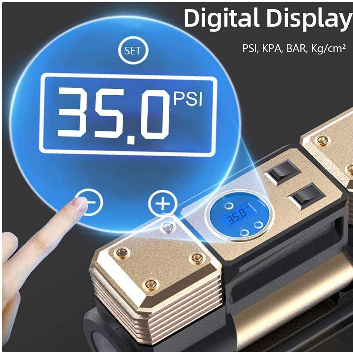
Image: A close-up view of the digital display showing a preset pressure of 35.0 PSI, with buttons for adjustment.

Your browser does not support the video tag.