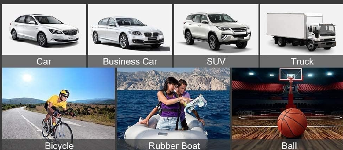
Image: Illustration of the multi-purpose nozzles included with the air compressor, suitable for cars, SUVs, bicycles, rubber boats, and balls.