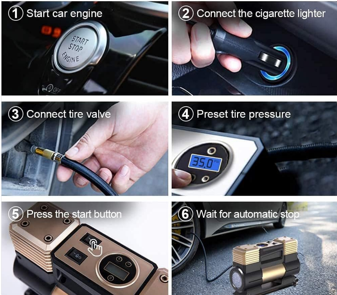
Image: Visual guide demonstrating the setup process, including starting the car engine, connecting to the cigarette lighter, attaching to the tire valve, and setting pressure.