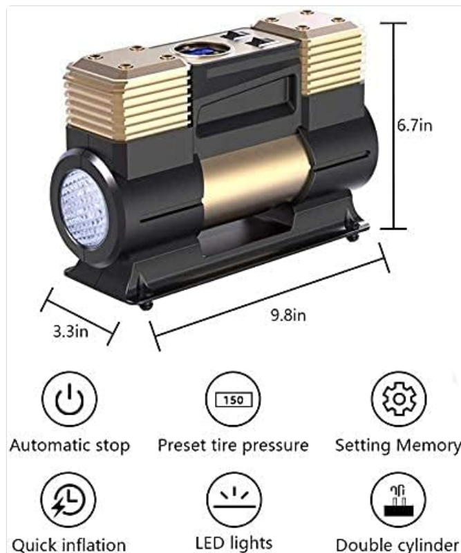
Image: The WOLFBOX Portable Air Compressor showing its compact design and approximate dimensions (9.8in

The WOLFBOX Portable Air Compressor YD-382 is a compact and efficient device designed for inflating various items, primarily vehicle tires. It features a double-cylinder design for rapid inflation, a digital display for accurate pressure readings, and an automatic shut-off function for convenience and safety.