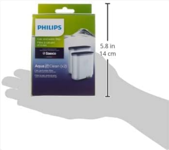
Image: A diagram illustrating the dimensions of the Philips AquaClean filter packaging.

For reliable machine protection, use only Philips AquaClean filters. This product is backed by Philips' commitment to quality. For warranty information, support, or to order accessories, please visit the official Philips website or contact a Philips authorized service center.