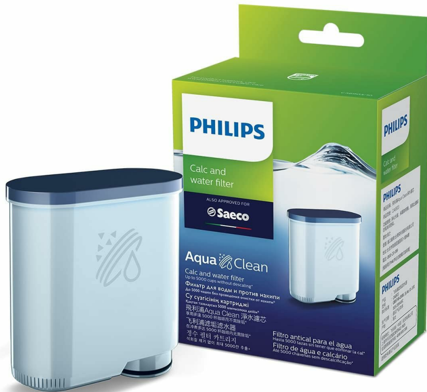
Image: The Philips AquaClean Calc and Water Filter in its retail packaging, showing the filter unit alongside the box.