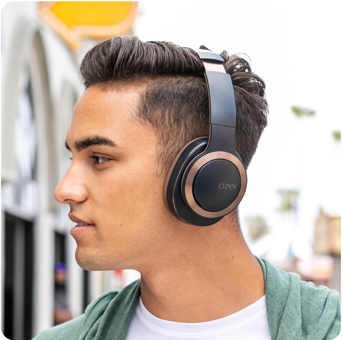
Figure 5: Bluetooth 5.0 and Multipoint Connectivity for seamless device switching.