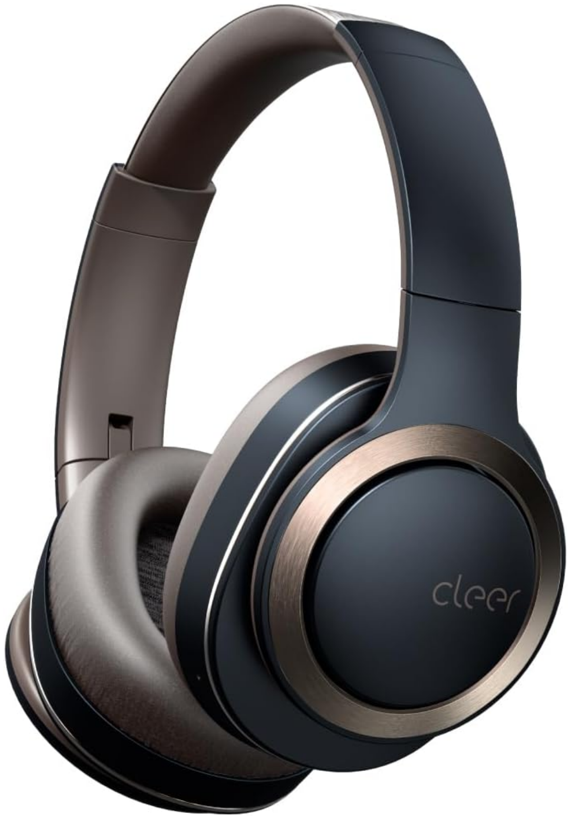
Figure 1: Cleer Enduro ANC Headphones - Dark Navy