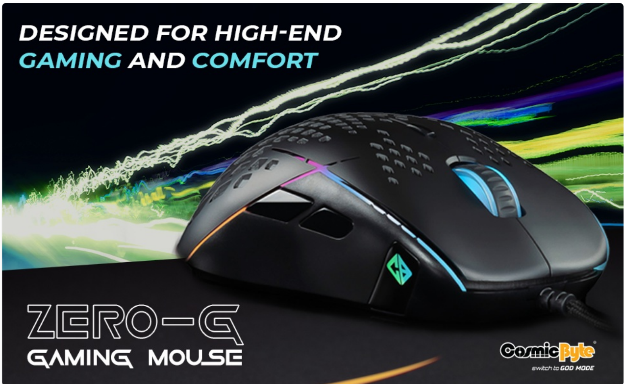
Image 2.1: Overview of the Cosmic Byte Zero-G Gaming Mouse's core features, including its sensor, switches, coating, buttons, and lighting.