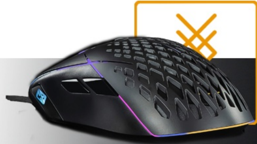
Image 5.1: Illustration of the 8 programmable buttons on the Cosmic Byte Zero-G mouse, which can be customized using the dedicated software.

The Zero-G Gaming Mouse comes with an ascended 1.7 meters braided cord making it ultra-lightweight and flexible that feels wireless