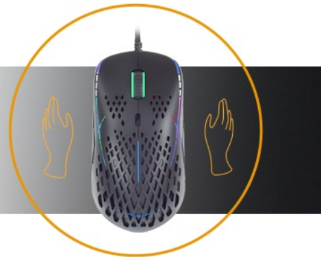
Image 4.1: The 3-step switch on the mouse bottom allows users to select between right-hand mode, LED off, and left-hand mode, optimizing button functionality for ambidextrous use.

The Cosmic Byte Zero-G Gaming Mouse comes with 3 Step Switches to change configuration between Right-hand, LED off, and Left-hand use