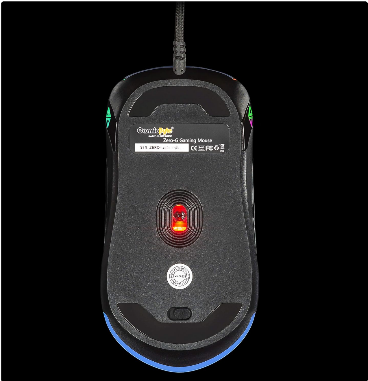
Image 3.1: Bottom view of the mouse, highlighting the optical sensor and the mouse feet. Ensure any protective film is removed from the mouse feet before use.