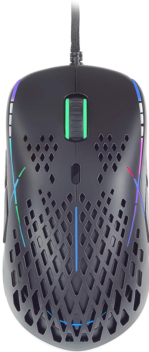
Image 1.1: Front-side view of the Cosmic Byte Zero-G Gaming Mouse, showcasing its lightweight design and vibrant RGB lighting.