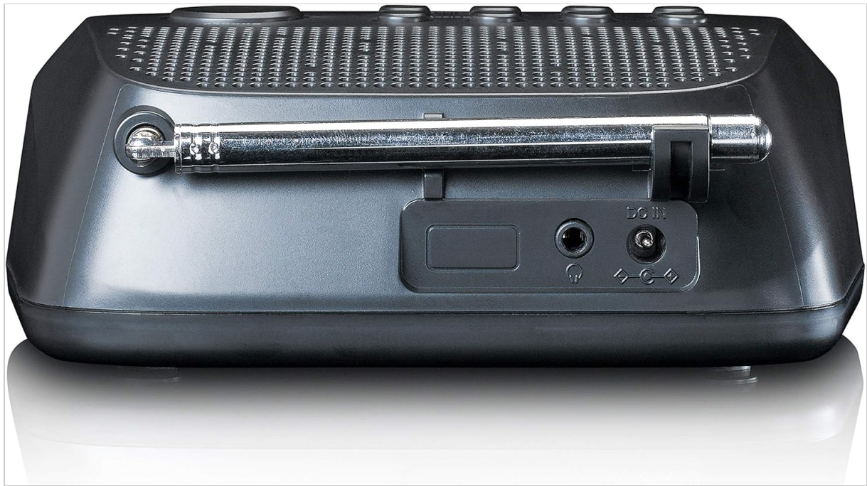
Figure 3: Rear view of the Lenco CR-605, highlighting the DC IN power port and the 3.5mm headphone jack, along with the extendable antenna.