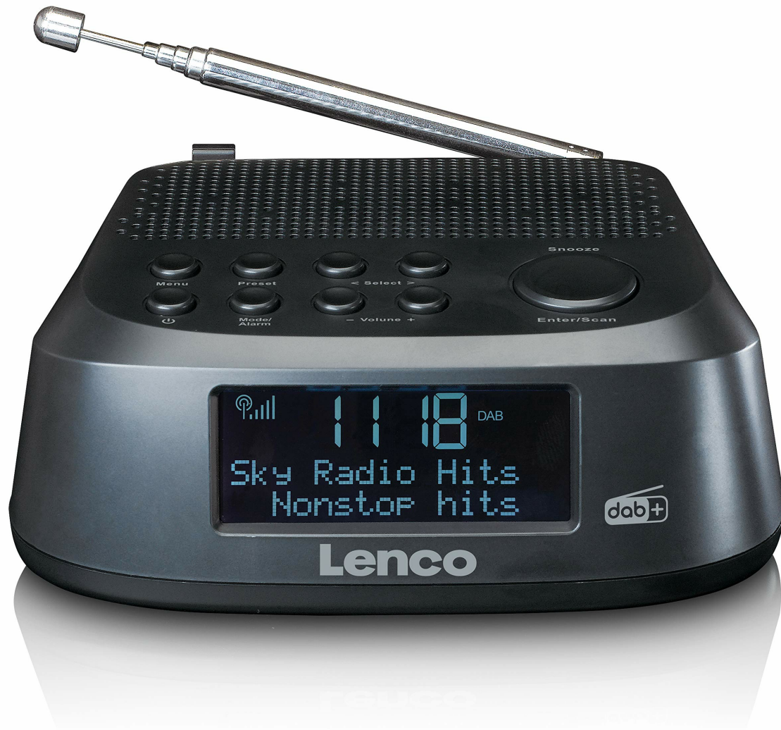
Figure 1: Front view of the Lenco CR-605 Digital DAB+ and FM Radio Alarm Clock, showing the display with time and radio station information, and control buttons.