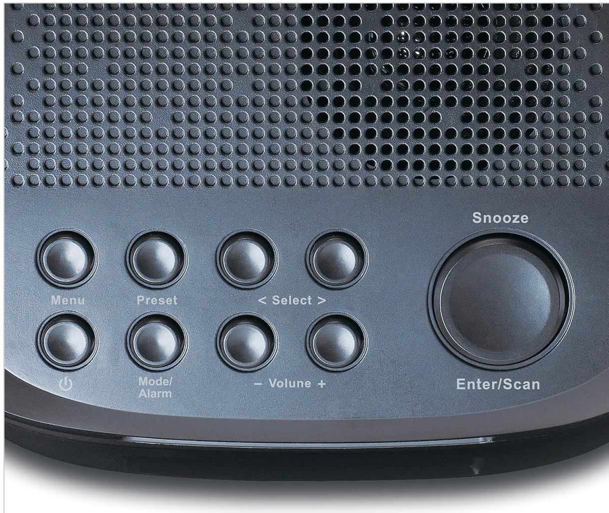
Figure 2: Close-up of the top control panel of the Lenco CR-605, showing buttons for Menu, Preset, Select, Volume, Mode/Alarm, and the Enter/Scan dial with Snooze button.