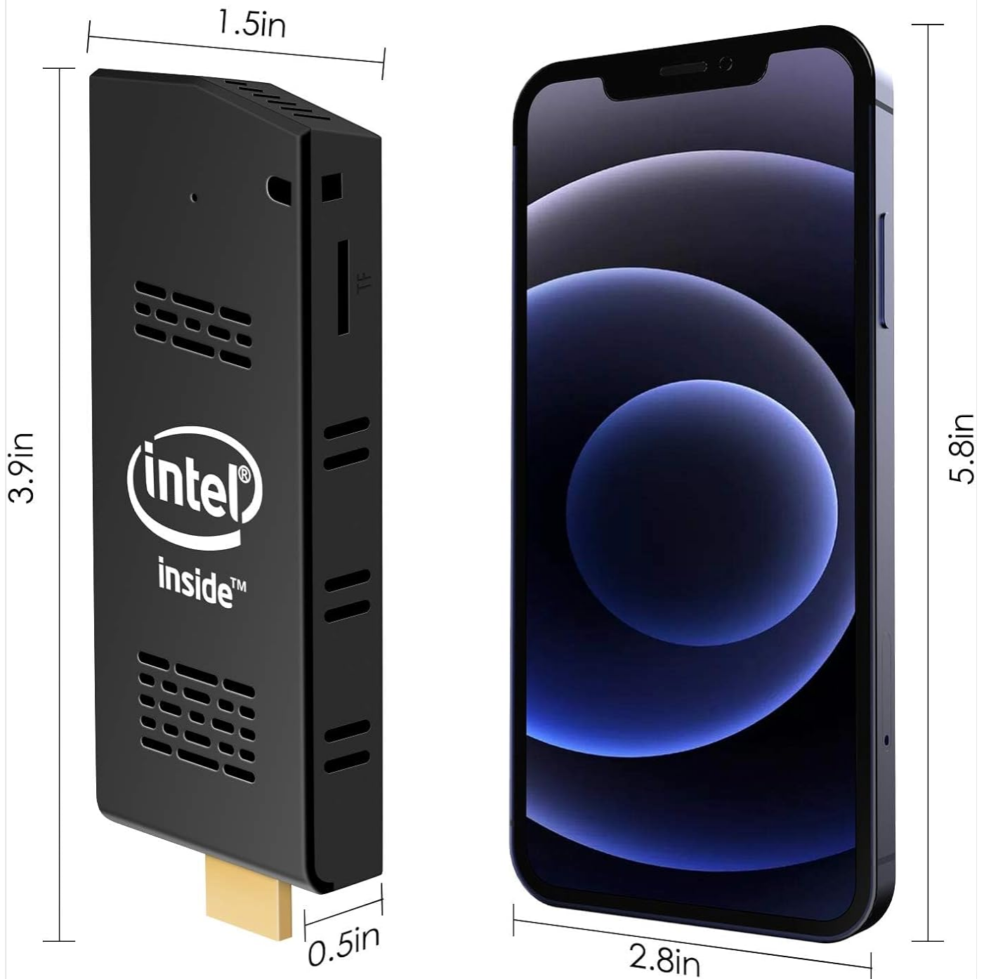
Image: A visual comparison of the AIOEXPC S5 PC Stick's compact dimensions (3.9 x 1.5 x 0.5 inches) next to a smartphone, illustrating its portability.