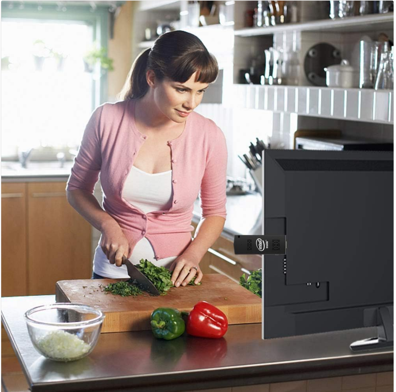
Image: The AIOEXPC S5 PC Stick plugged into the HDMI port of a television, demonstrating a typical setup scenario.

to access, use the included HDMI extension cable.