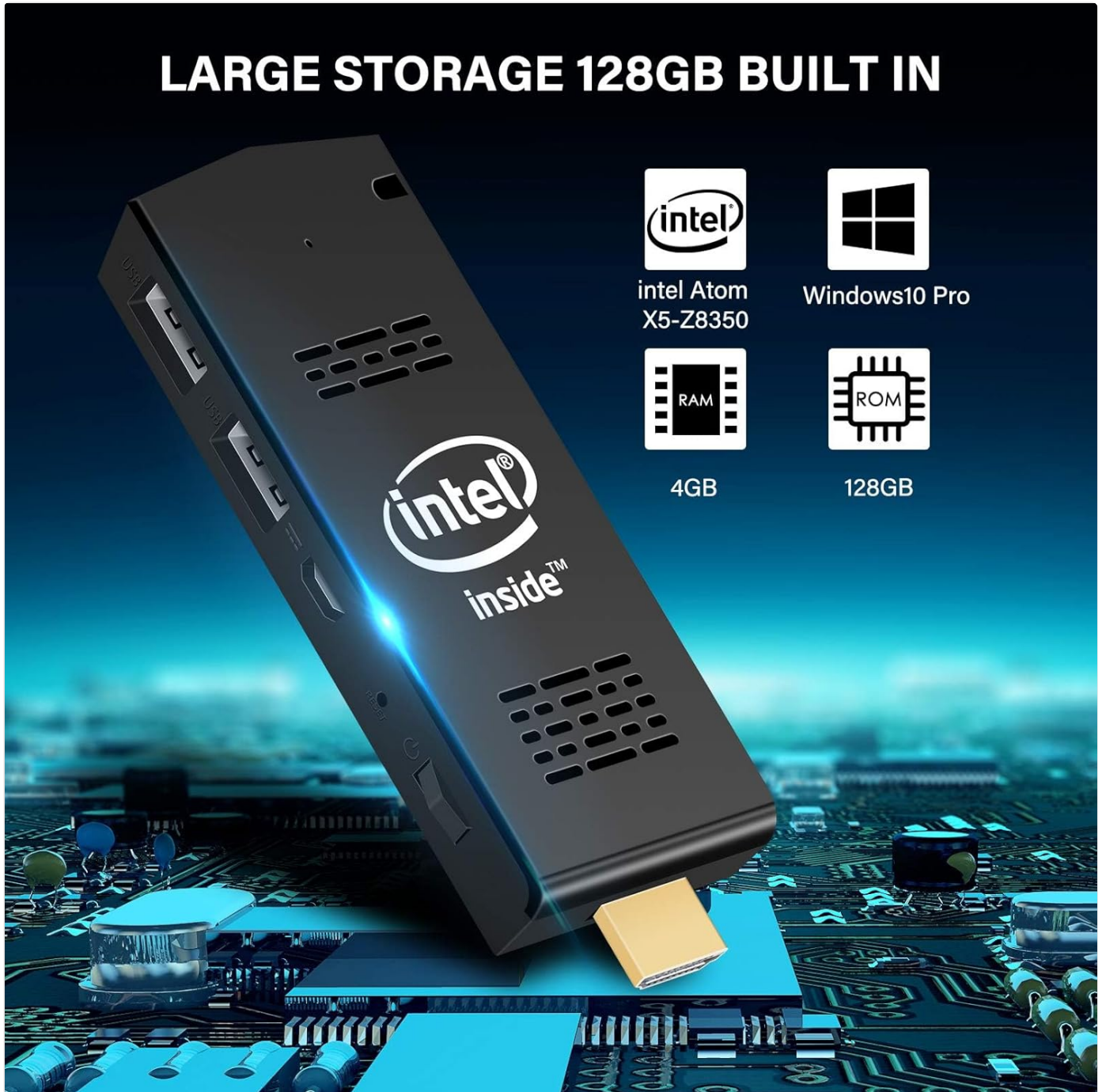
Image: A close-up view of the AIOEXPC S5 PC Stick highlighting the Micro SD card slot, indicating its support for storage expansion up to 128GB.

You can expand the storage by inserting a Micro SD card (TF Card) into the dedicated slot. The device supports cards up to 128GB.