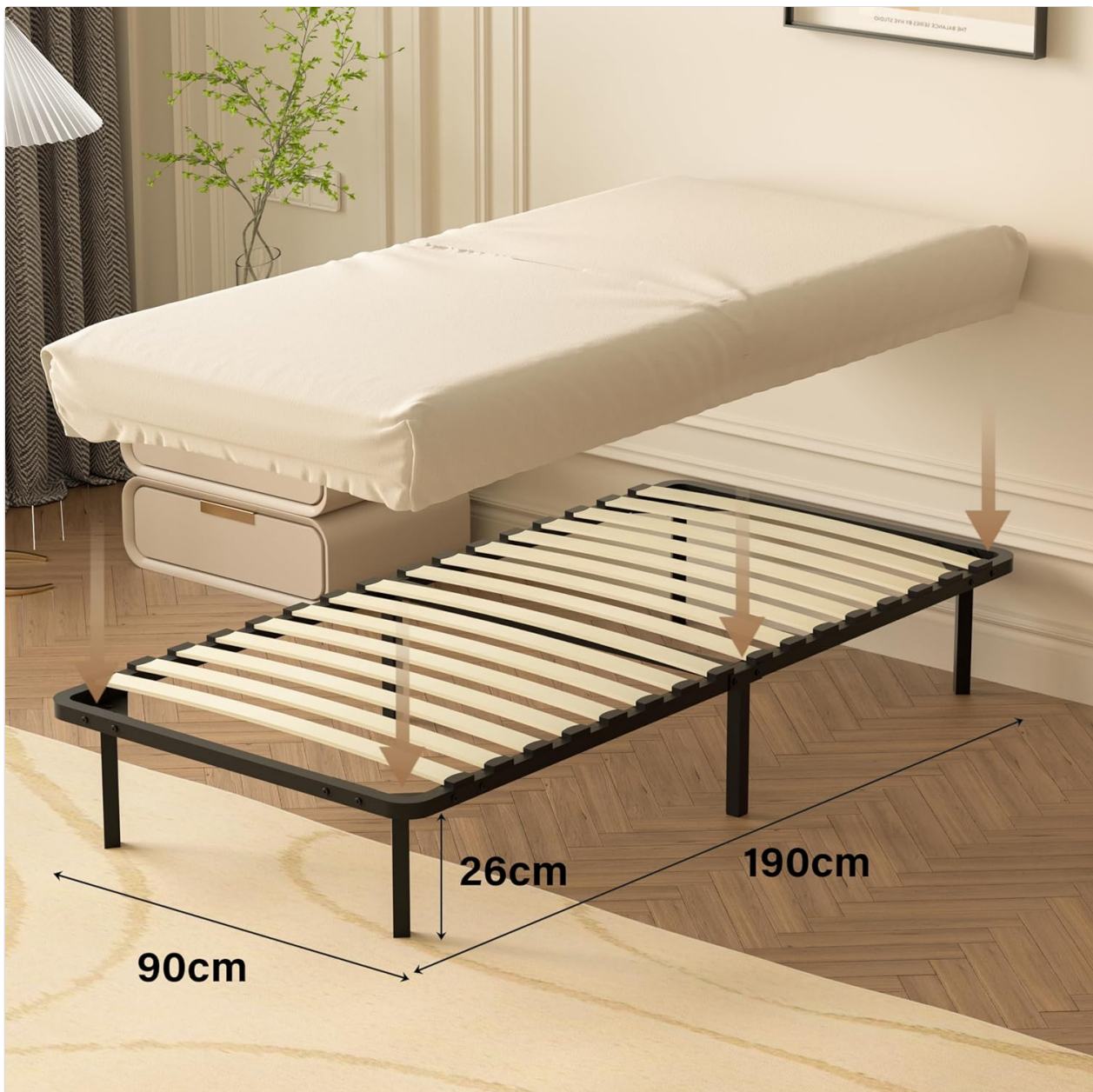
Figure 6: Dimensions of the bed base, highlighting under-bed storage space.