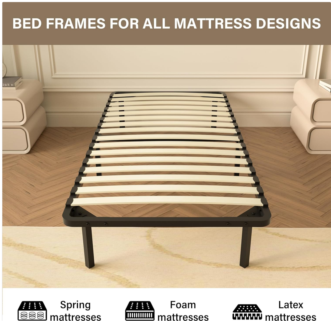
Figure 5: Mattress compatibility for the bed base.

This bed base is compatible with various mattress types, including spring, foam, and latex mattresses.