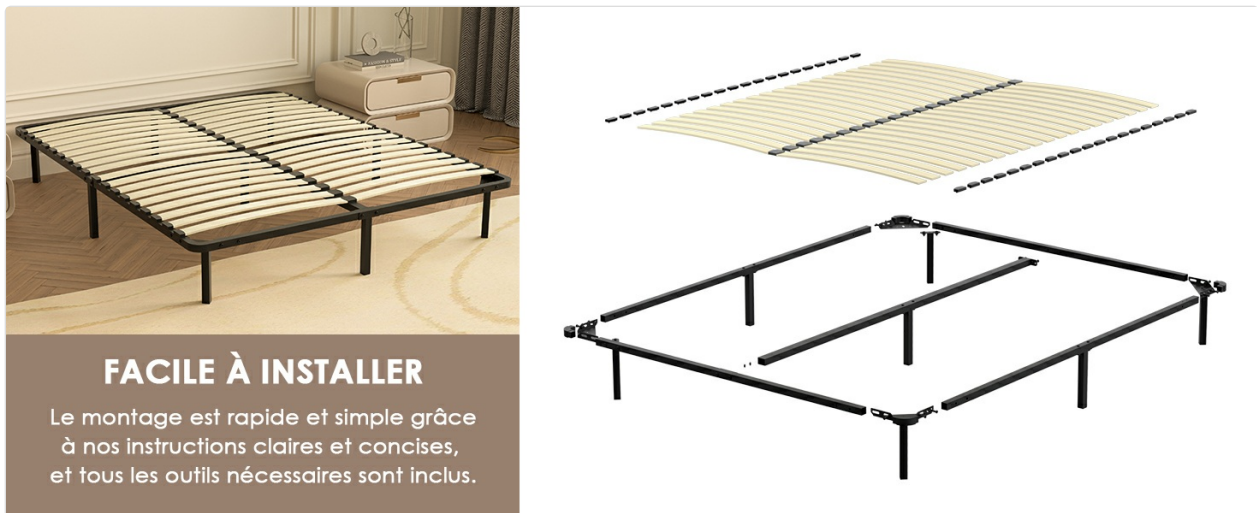
Figure 2: Exploded view of bed base components, showing frame parts, slats, and hardware.

Carefully unpack all components from the box. Lay them out on a clean, flat surface and compare them with the package contents list to ensure everything is present.