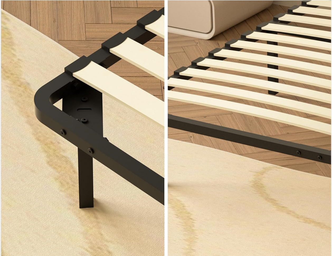
Figure 4: Detail of slat installation and frame construction.

High-quality tubes+High-quality poplar slats