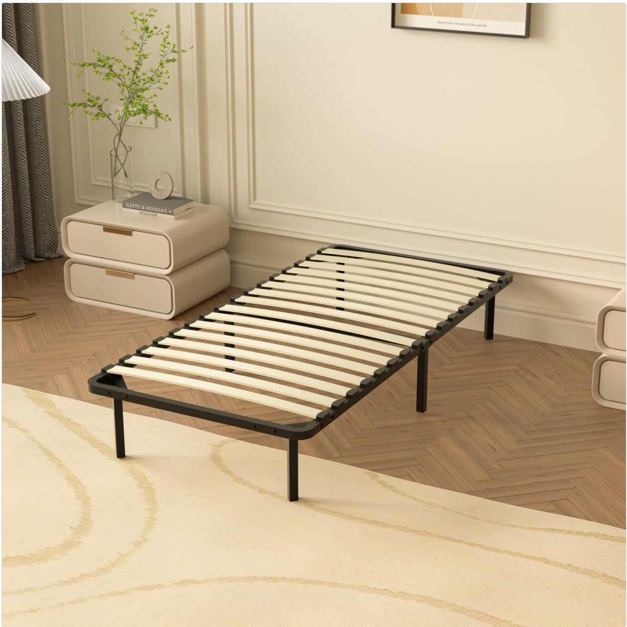
Figure 1: DEWINNER 90x190 Slatted Bed Base, fully assembled.