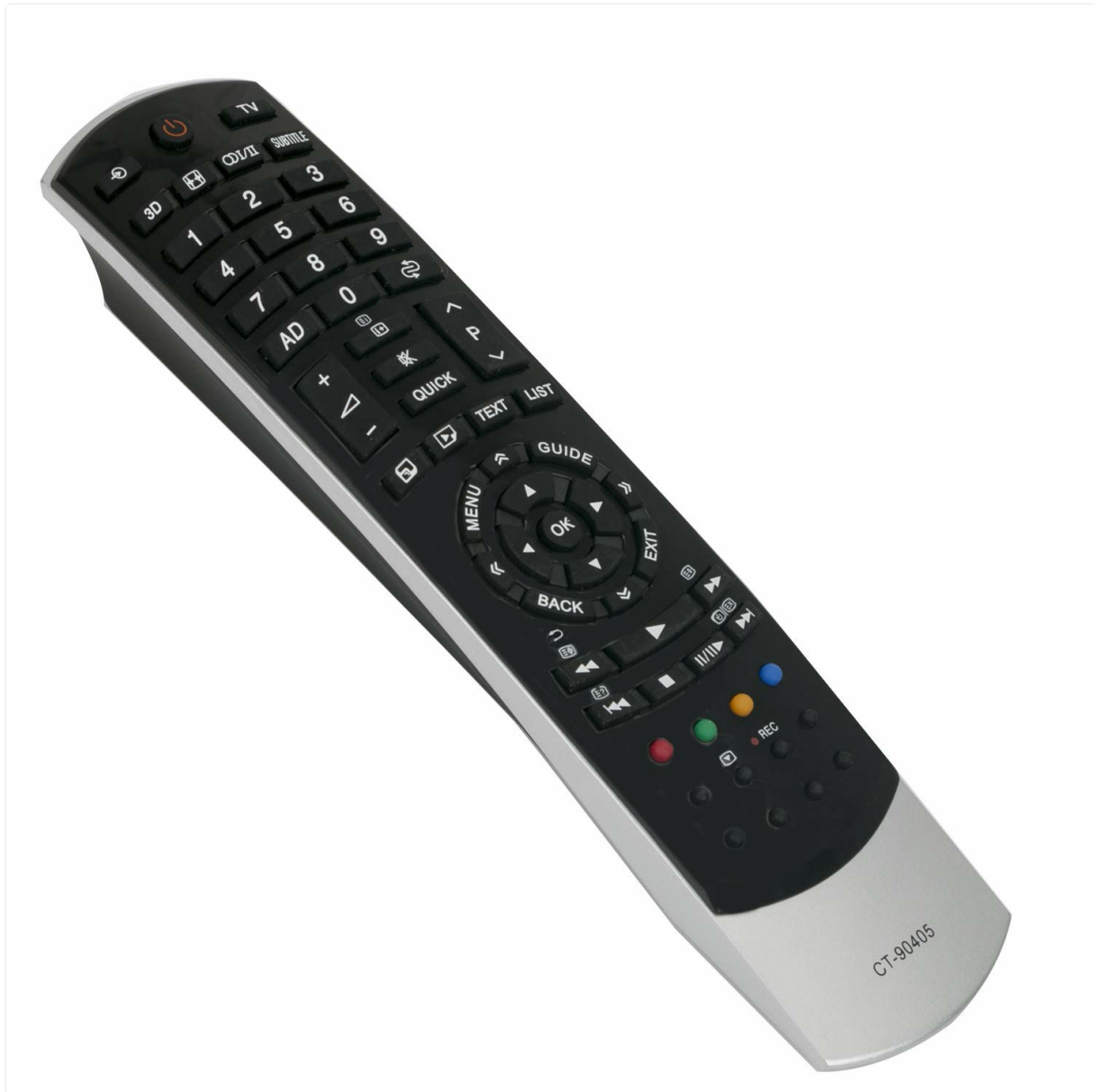
Image: Front view of the VINABTY CT-90405 remote control, displaying all buttons and their labels.

The VINABTY CT-90405 remote control features an ergonomic design for comfortable handling and provides a stable, long-distance transmission for reliable operation. Below is a guide to its primary functions: