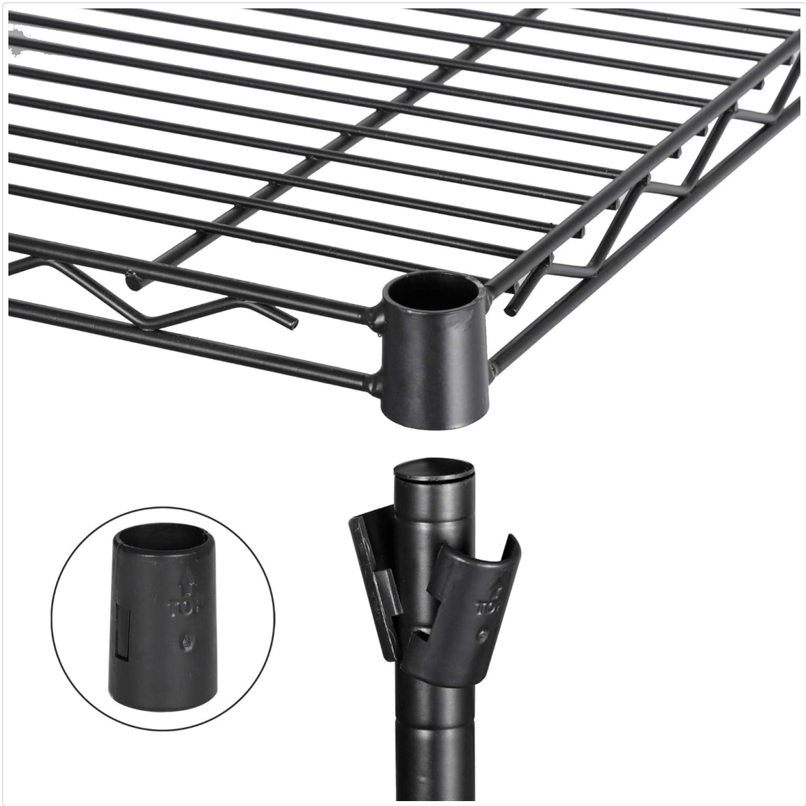
Image: A close-up view of the plastic sleeves securely attached to a pole, highlighting the upward arrow for correct orientation.