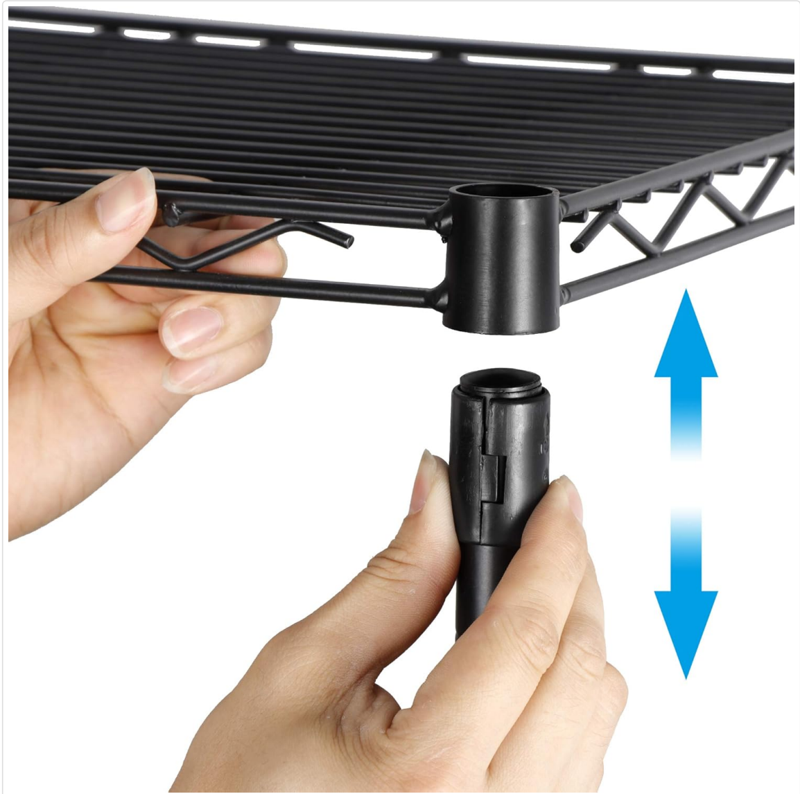
Image: A person's hands demonstrating how to snap the plastic sleeves onto the pole at the desired height.