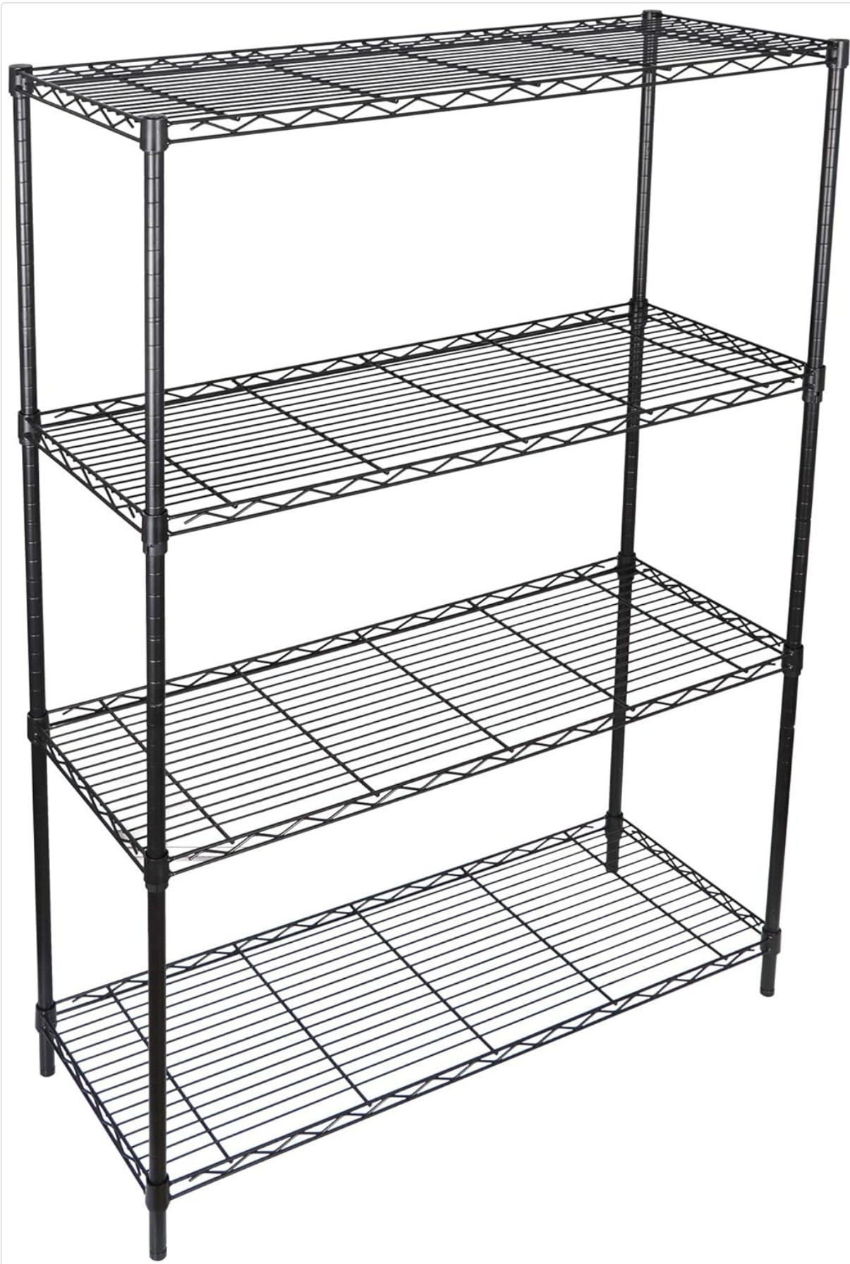
Image: A fully assembled ZENY 4-Shelf Adjustable Heavy Duty Storage Shelving Unit, ready for use.