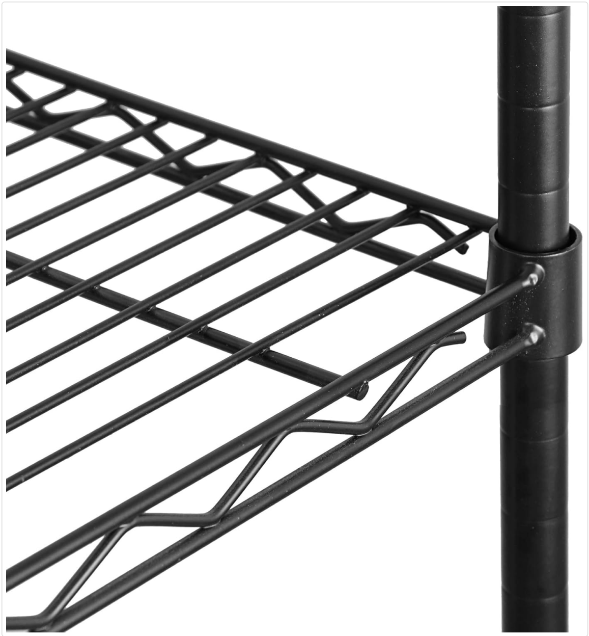
Image: A wire shelf being lowered onto the four vertical poles, aligning with the plastic sleeves.