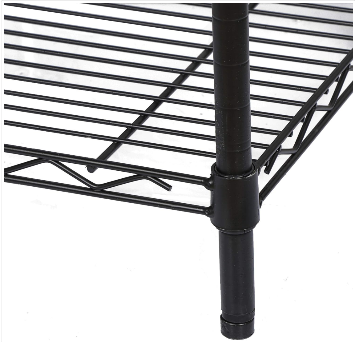
Image: A wire shelf fully seated and stable on the poles, with the corner collars resting on the plastic sleeves.