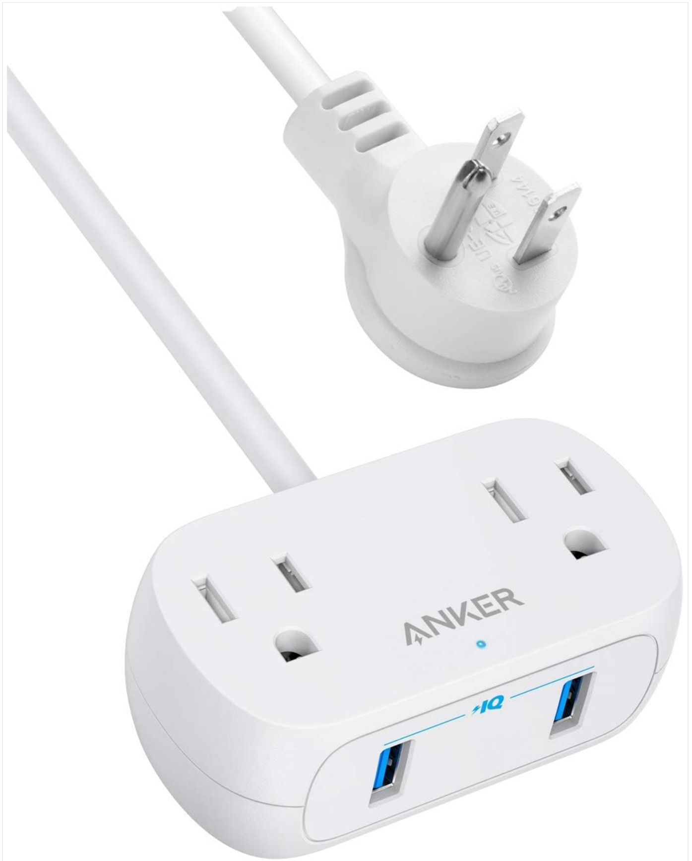
Front view of the Anker PowerExtend USB 2 mini, highlighting its two AC outlets and two USB-A ports.