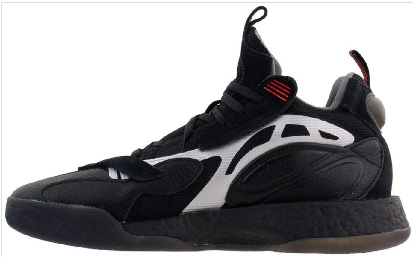
Image: Alternate side view of the adidas ZoneBoost shoe, detailing the heel structure and ankle collar design.