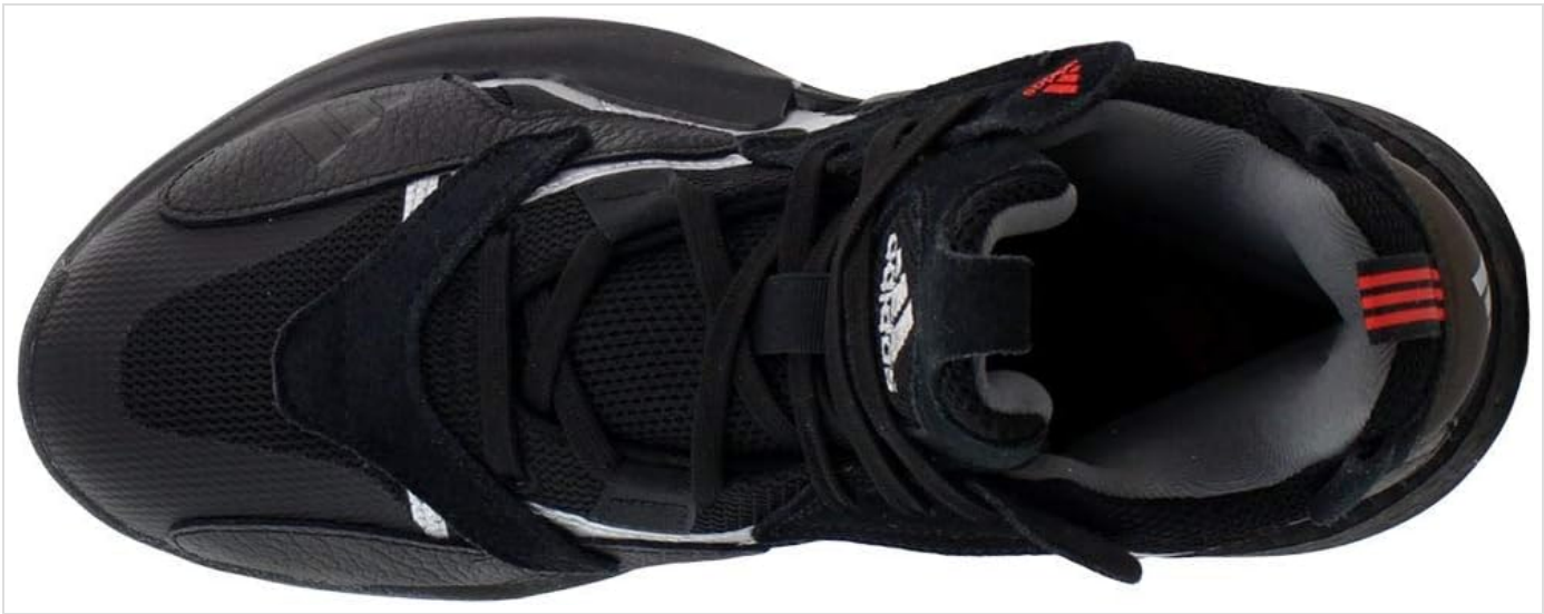
Image: Top-down view of the adidas ZoneBoost shoe, illustrating the tongue and the full extent of the lacing system.

Warranty information for adidas products is typically provided at the point of purchase or can be found on the official adidas website. Please retain your proof of purchase for any warranty claims. For further support, product inquiries, or to view additional resources, please visit the official adidas store or contact adidas customer service.