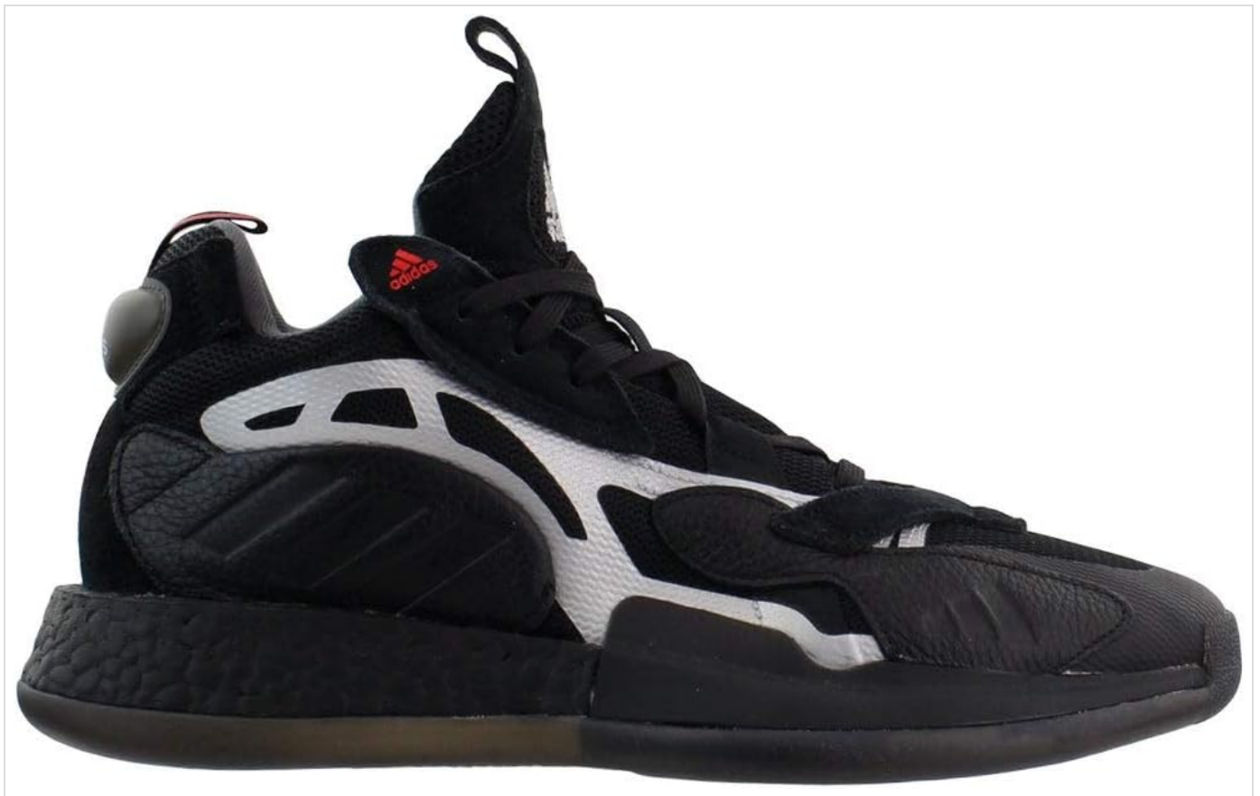
Image: Side profile of the adidas ZoneBoost shoe, highlighting the intricate lacing system and the design of the sole.