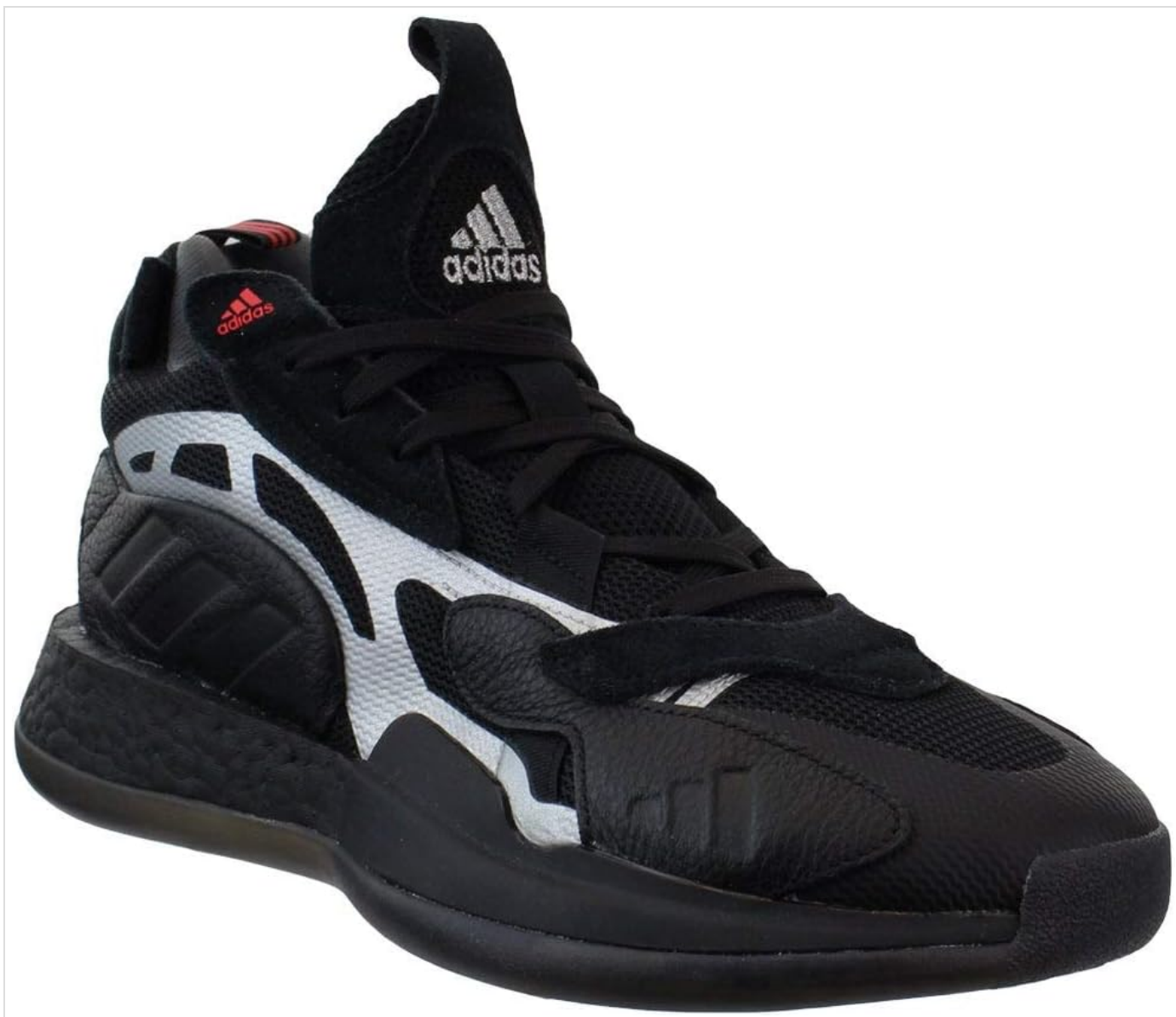
Image: Front-side view of the adidas Men's ZoneBoost Basketball Shoe, showcasing its black upper with prominent silver design elements and a black sole.