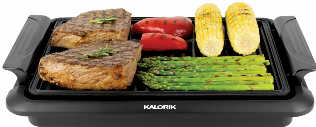
Image: Kalorik Electric Indoor Grill, showcasing its sleek black design and grill surface.