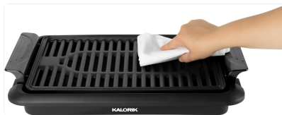
Image: A hand wiping down the non-stick cooking surface of the grill with a soft cloth.