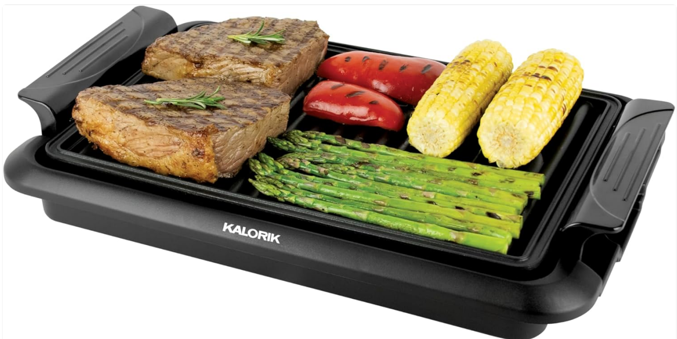
Image: The indoor grill in operation, cooking various foods such as steaks, sausages, corn on the cob, and asparagus.