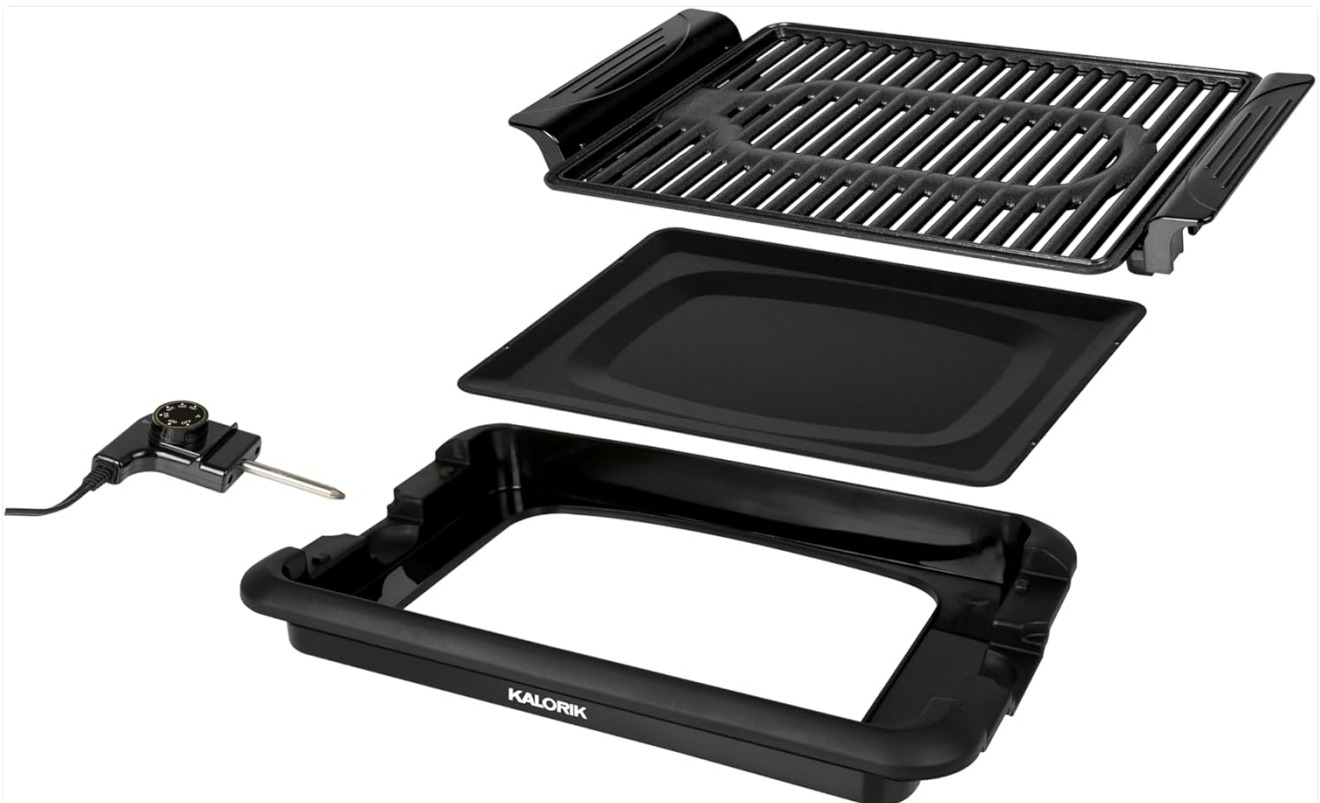
Image: Exploded view showing the grill base, drip tray, cooking plate, and temperature control with probe.