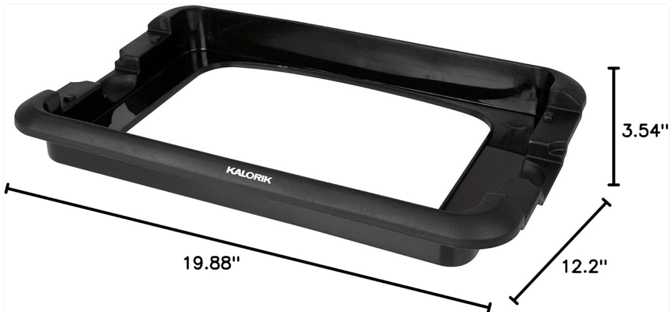
Image: Diagram illustrating the dimensions of the grill base: 19.88 inches deep, 12.2 inches wide, and 3.54 inches high.