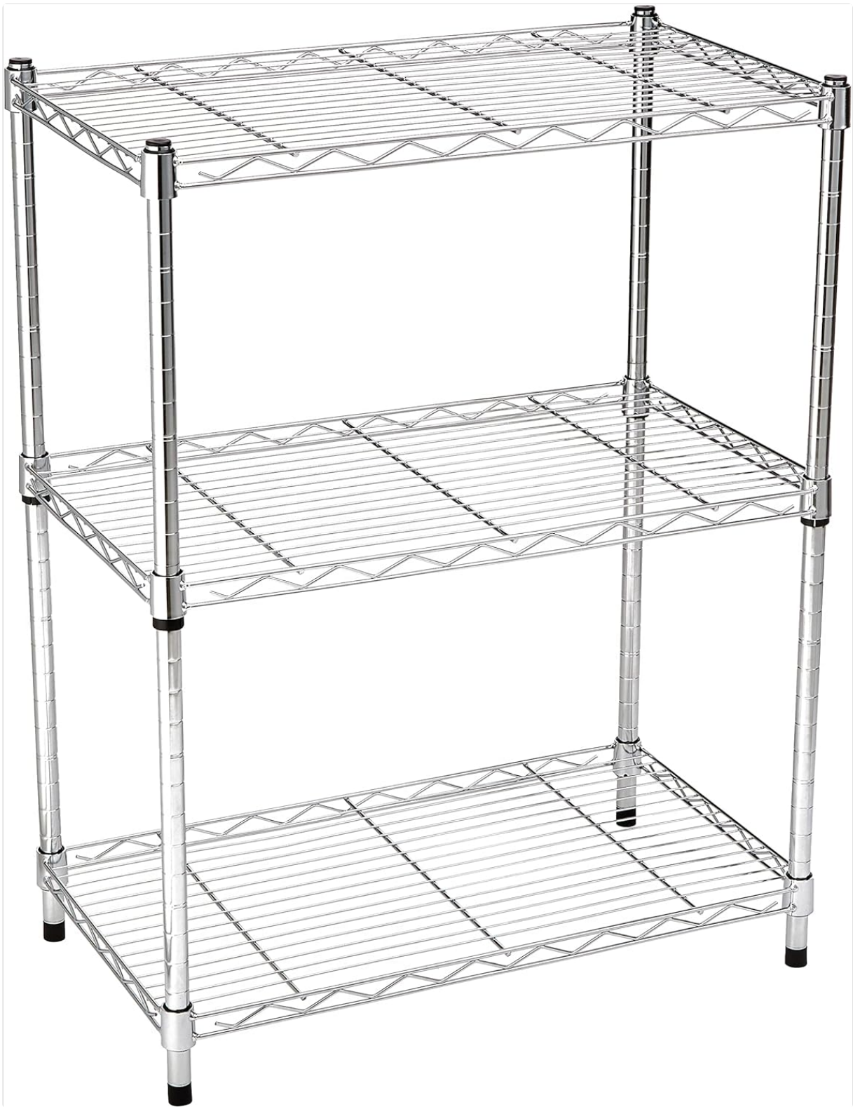
Image: An assembled 3-shelf shelving unit with leveling feet, ready for use.