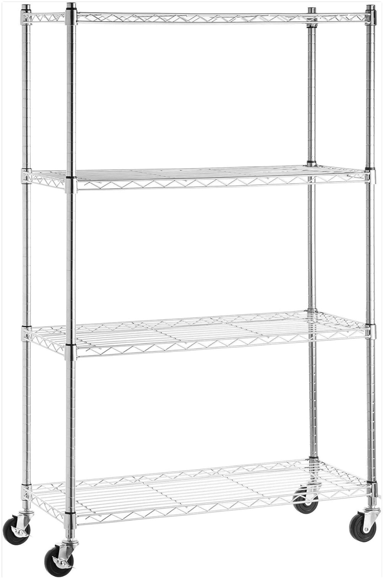
Image: An assembled 4-shelf shelving unit with casters, ready for use.