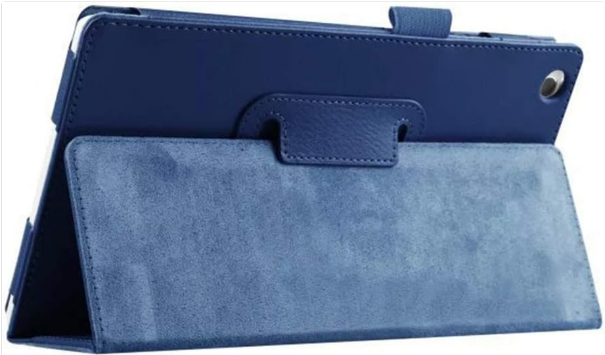
Figure 6.3: A rear view of the tablet case demonstrating the folding mechanism that creates the stable viewing stand.