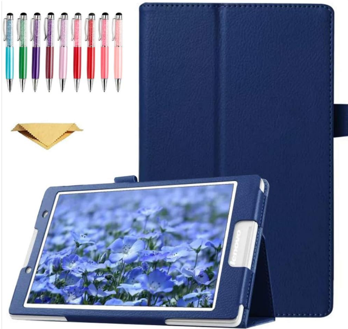
Figure 4.1: Contents of the package, including the blue tablet case, a set of colorful stylus pens (one random stylus is included), and a cleaning cloth.