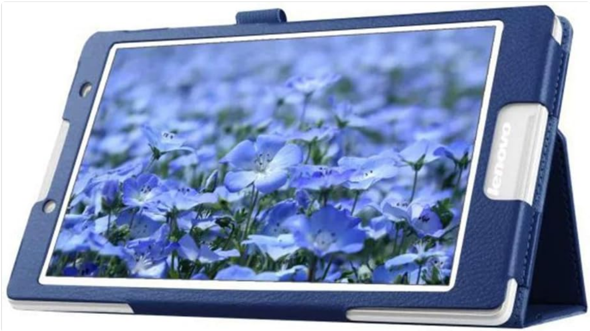
Figure 6.2: The tablet case folded into a horizontal viewing stand, providing a stable base for media consumption or video calls.