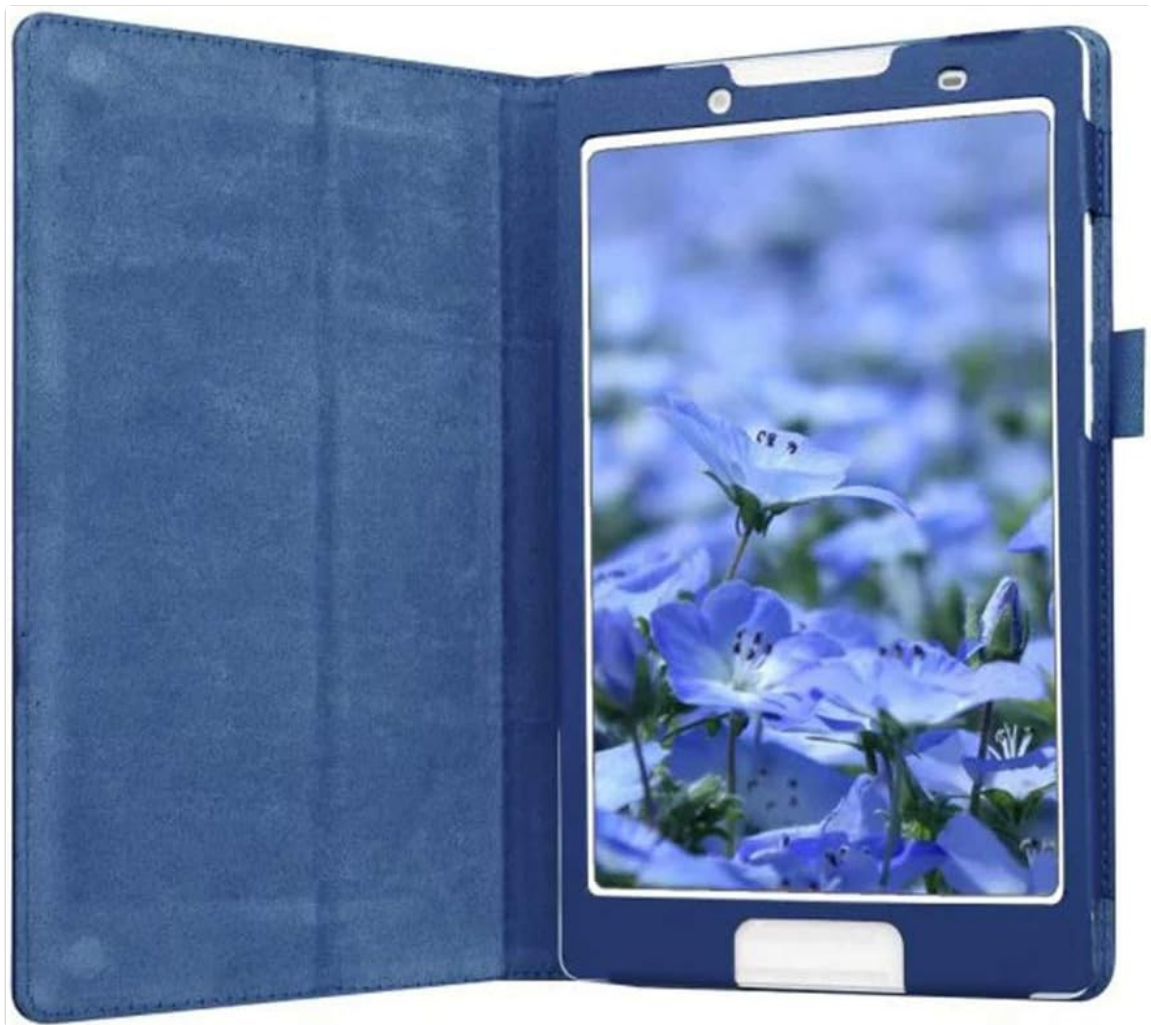
Figure 5.1: View of the tablet securely placed inside the open folio case, showing the precise cutouts for ports and buttons.