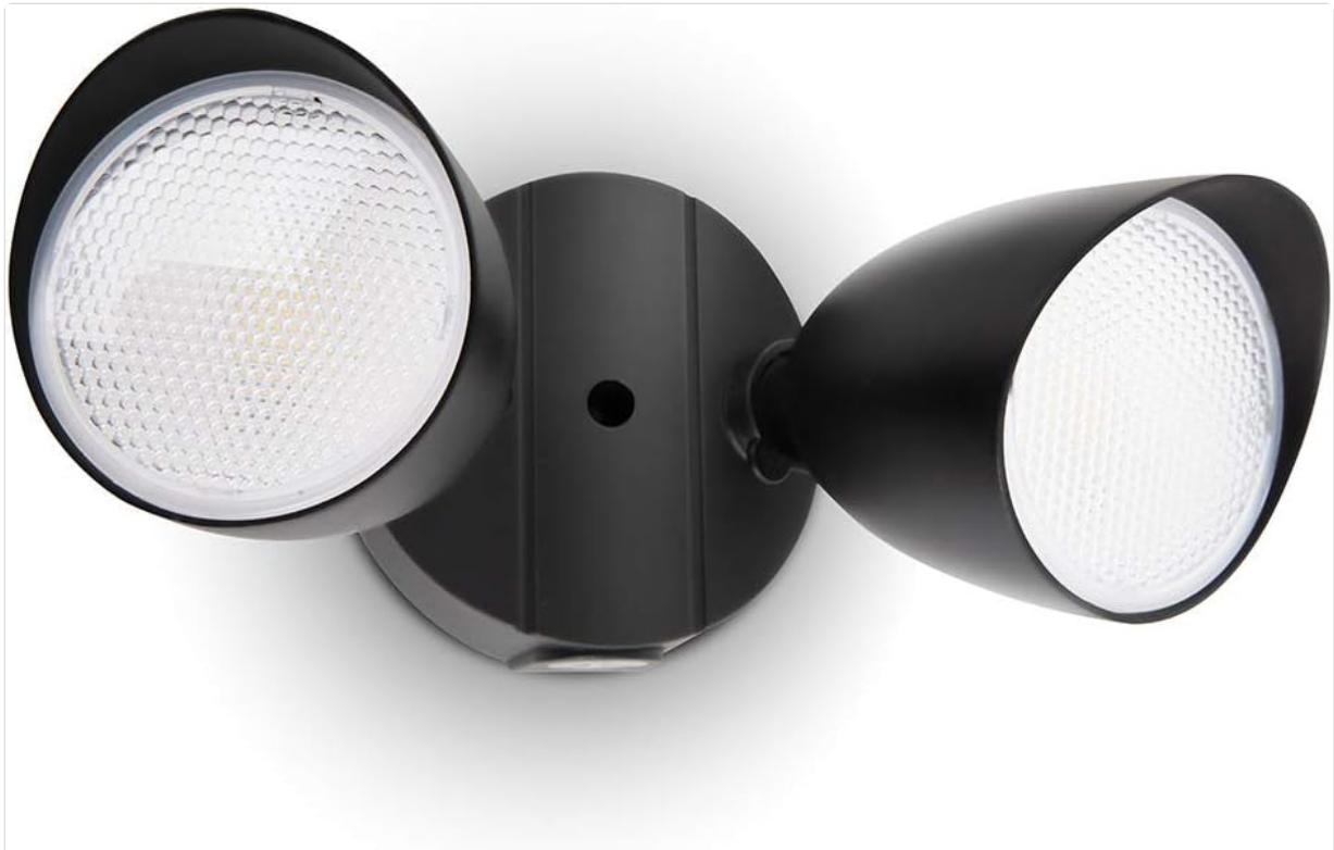
Image: Front view of the LUTEC 6222B Dual-Head LED Floodlight.

The LUTEC 6222B Dual-Head LED Floodlight is designed for outdoor use, providing bright and adjustable illumination for various areas such as patios, gardens, and yards. This fixture features a durable full metal design and is waterproof for reliable exterior security lighting.