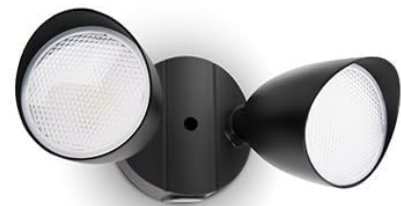
Image: The floodlight heads demonstrating their adjustable range, allowing for customized light direction.

SUPER BRIGHTNESS FOR YOUR PATIO 32W PROVIDES 3500 LUMENS HIGH BRIGHTNESS .