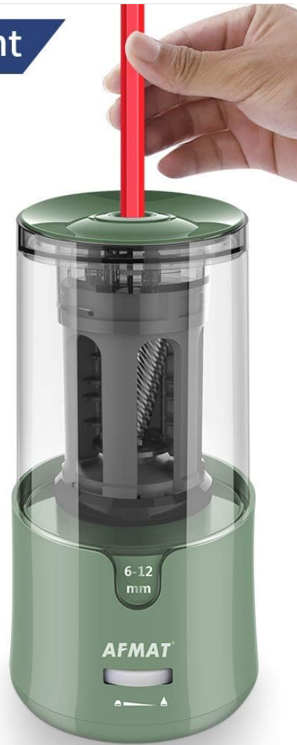
Figure 4: Auto-stop function and broken lead ejection.