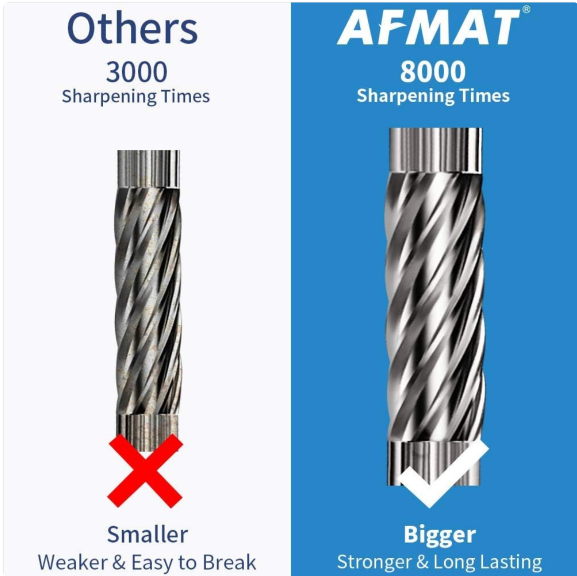
Figure 6: Durable helical blade design.