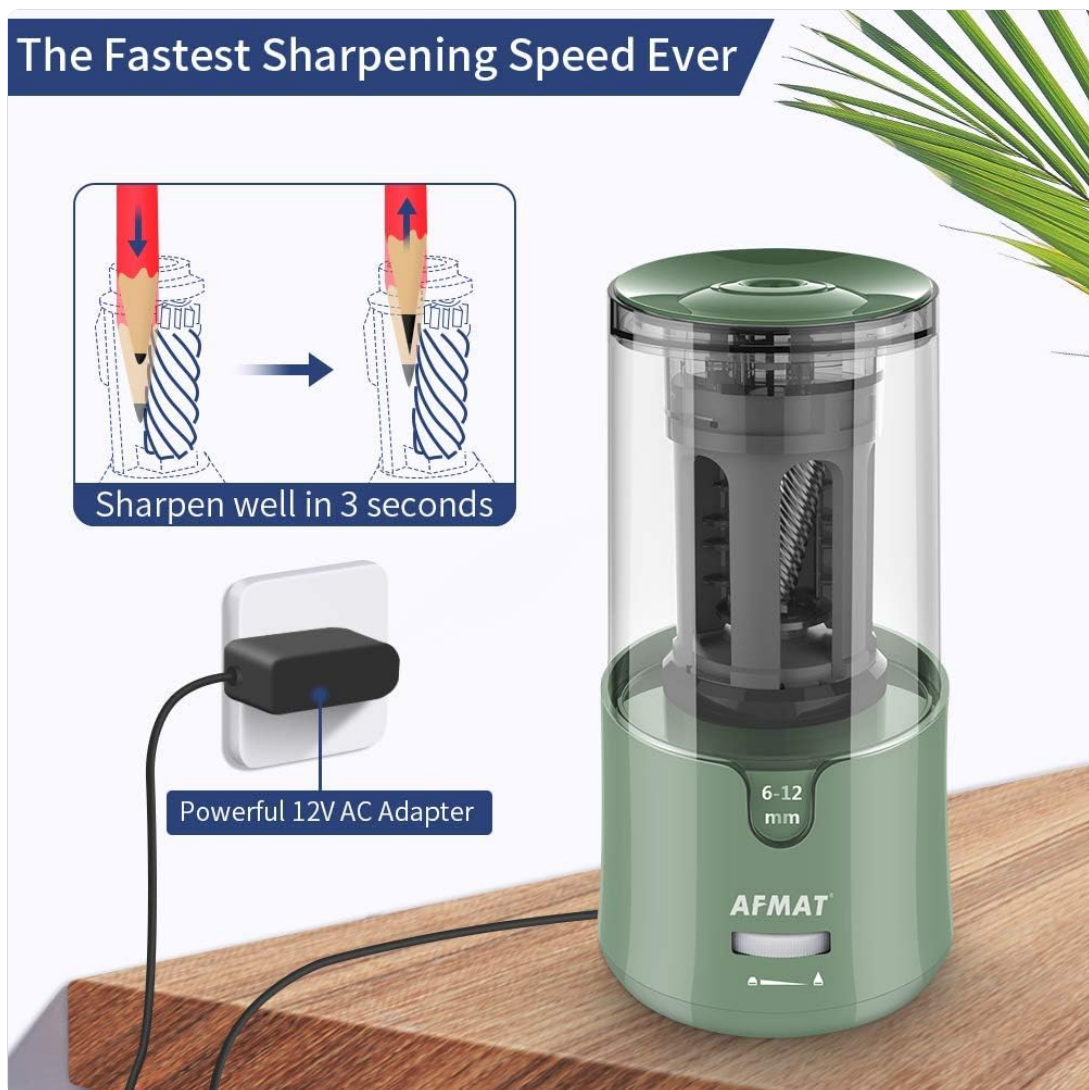
Figure 2: Connecting the power adapter to the sharpener.