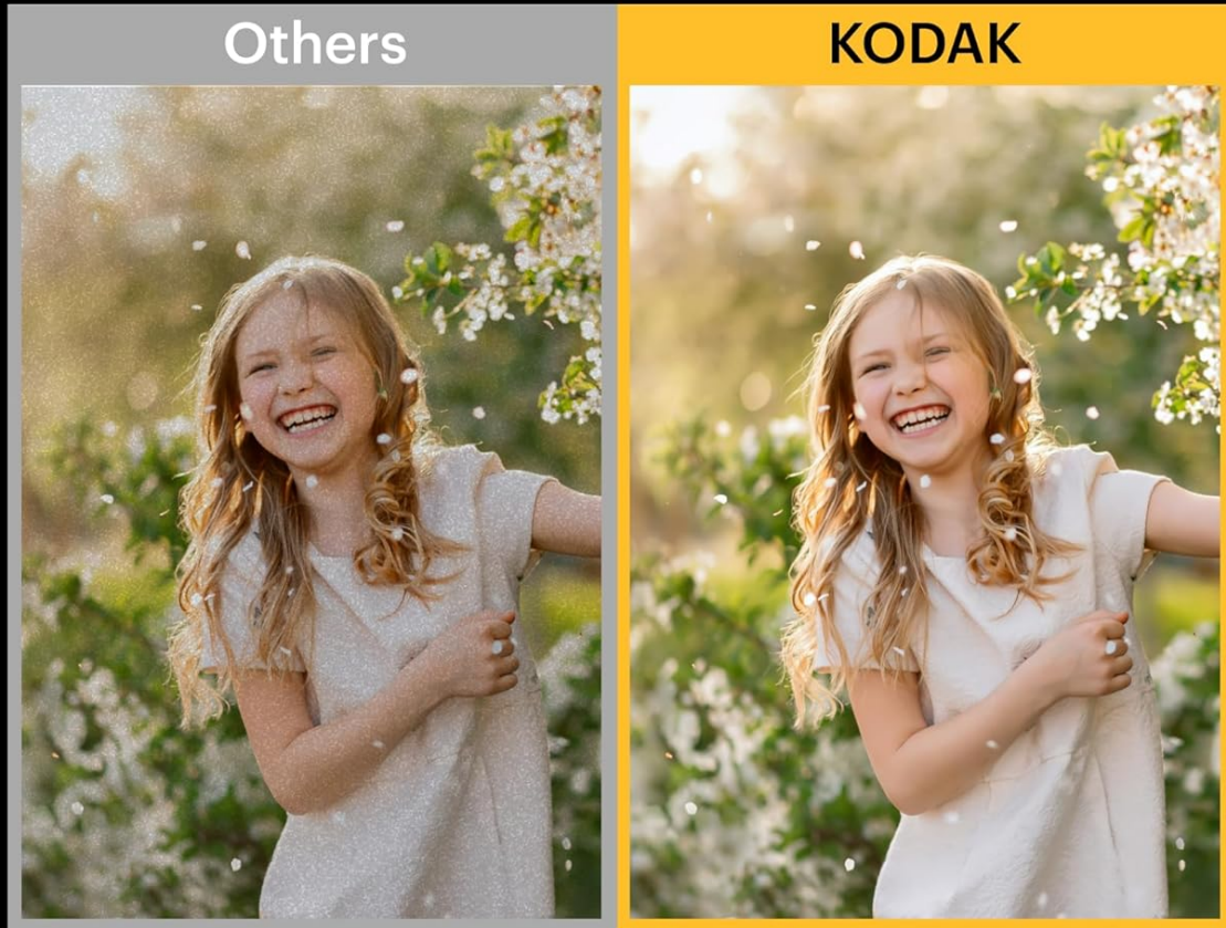
Image: A side-by-side comparison demonstrating the superior image quality of KODAK 4PASS prints compared to other printing methods, highlighting enhanced clarity and color vibrancy.