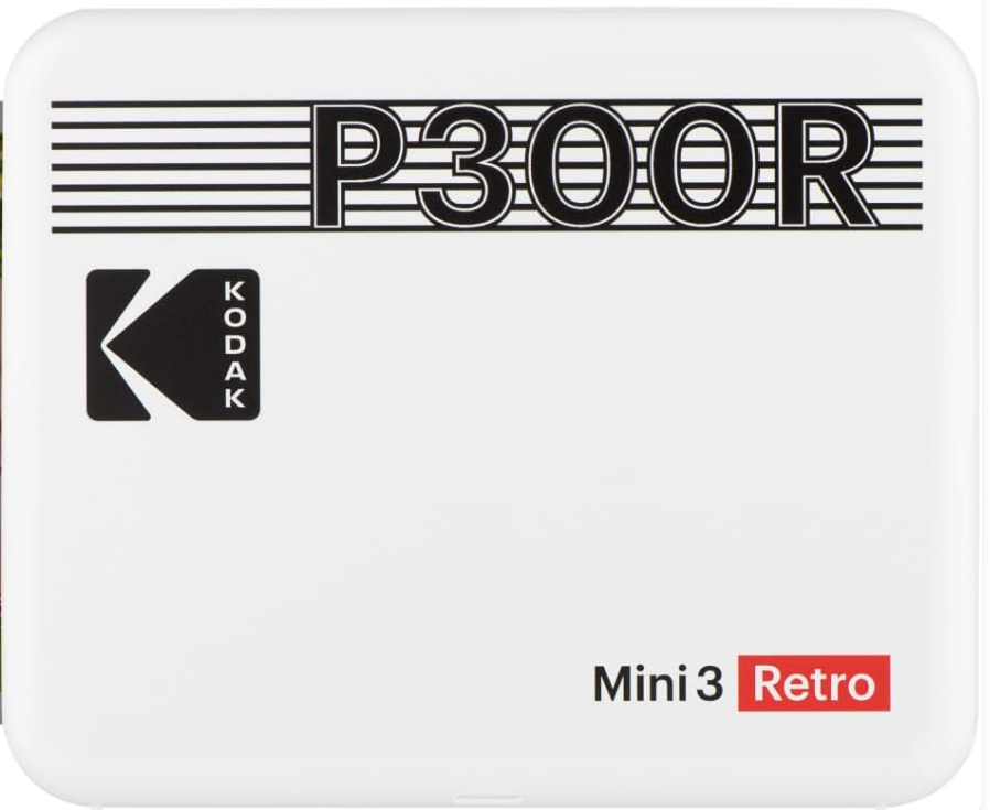
Image: The KODAK Mini 3 Retro Portable Photo Printer, a compact device designed for instant photo printing.