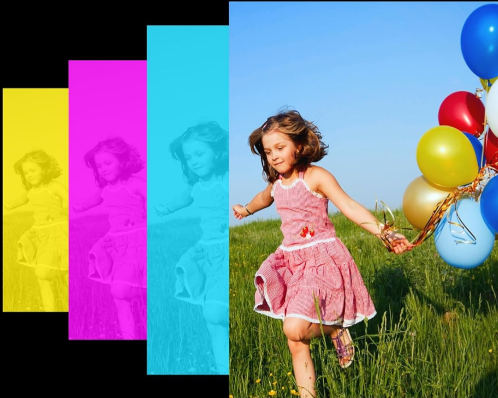
Image: A graphic illustrating the 4PASS printing process, showing how yellow, magenta, and cyan layers are applied sequentially to form the final image, ensuring superior image quality.