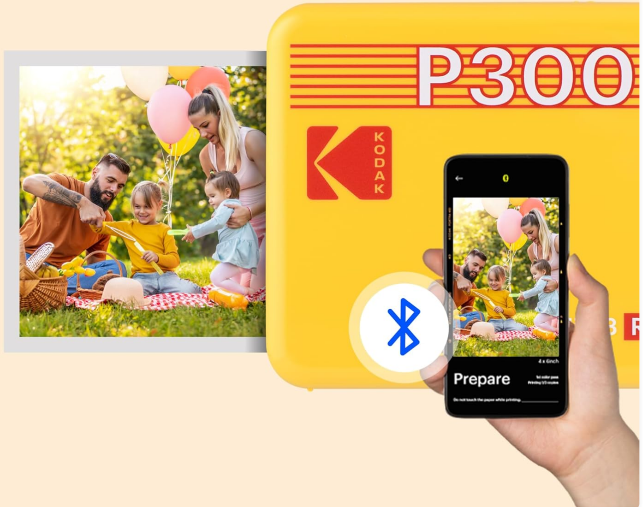
Image: A KODAK Mini 3 Retro printer shown next to a smartphone displaying the KODAK Photo Printer app interface with a Bluetooth connection icon, indicating readiness to print.