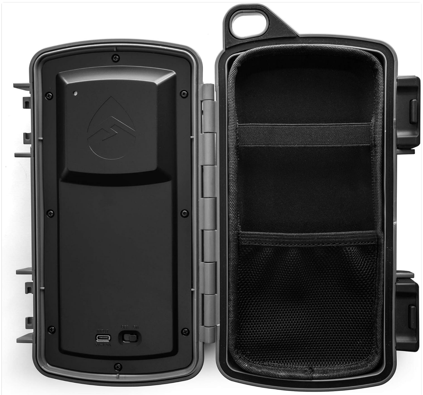
Figure 2: Interior view of the EcoExtreme 2 dry box with charging port.