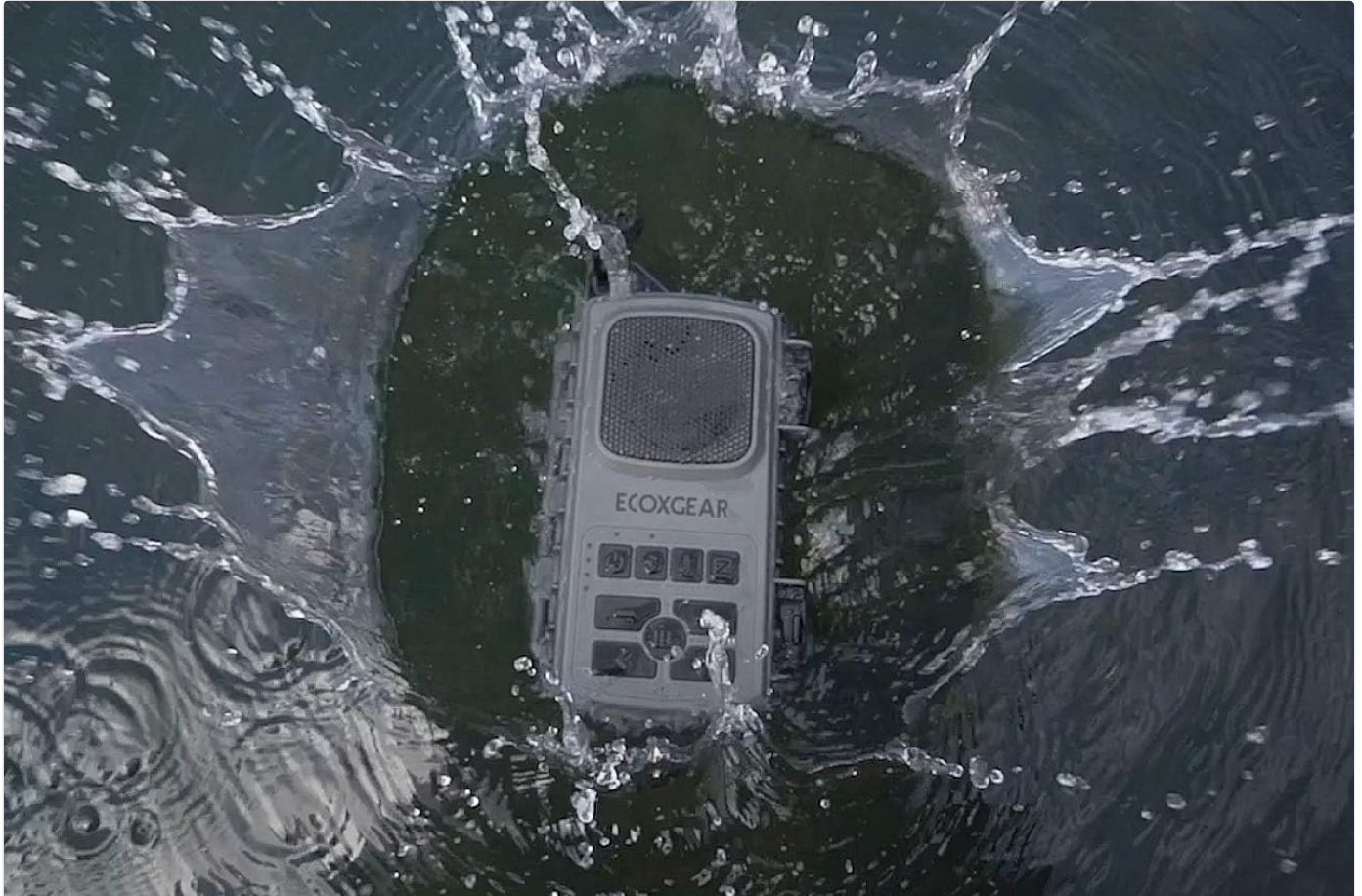
Figure 4: EcoExtreme 2 floating in water.

The EcoExtreme 2 meets IP67 international standards for waterproofing and dustproofing. To maintain its waterproof integrity, always ensure the dry box lid is securely closed and both side latches are fastened before exposing the speaker to water or dust. Regularly inspect the rubber gasket around the dry box opening for any signs of wear, tears, or debris. A damaged gasket can compromise the waterproof seal.