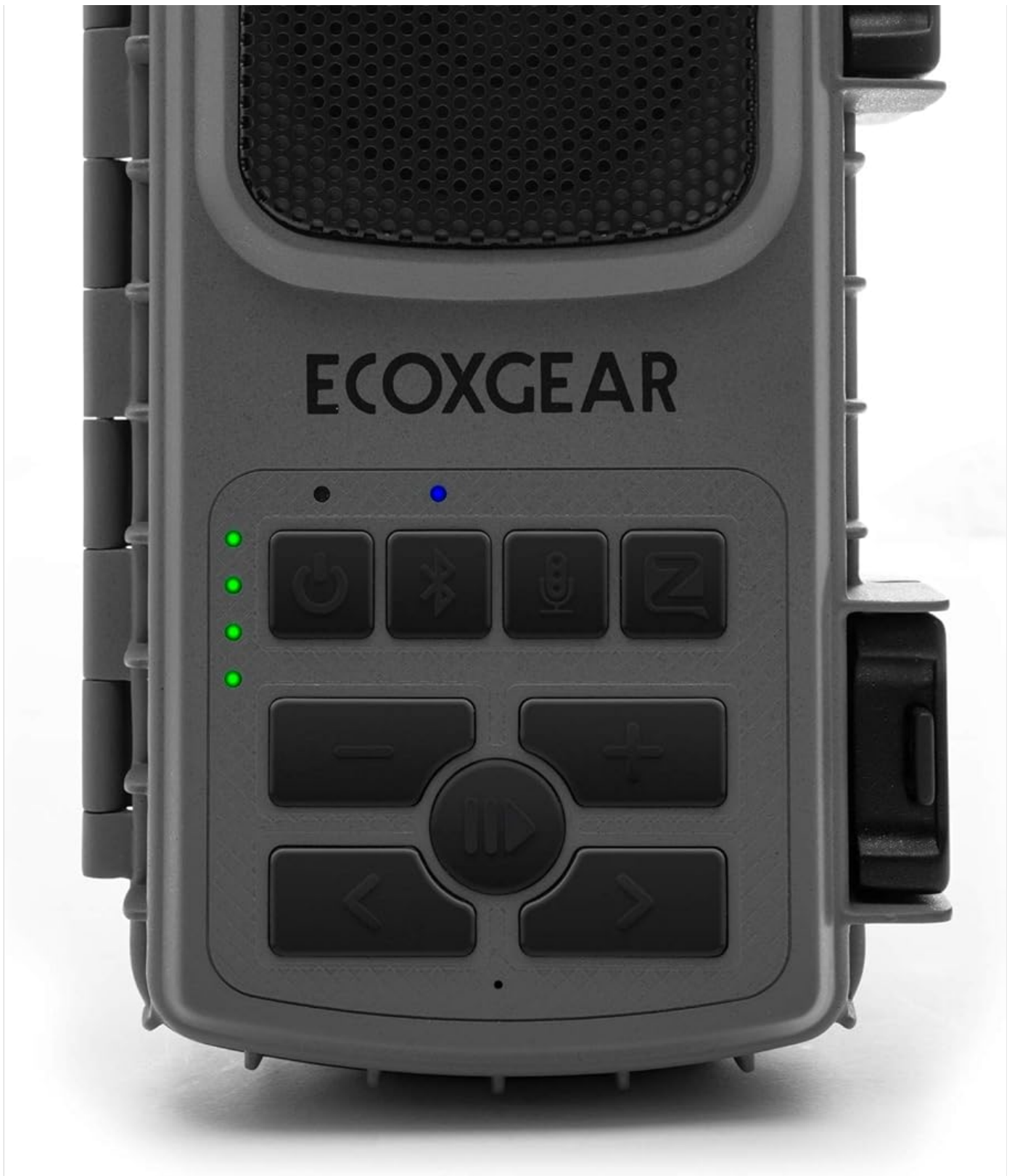
Figure 1: Front view of the EcoExtreme 2 speaker with control panel.