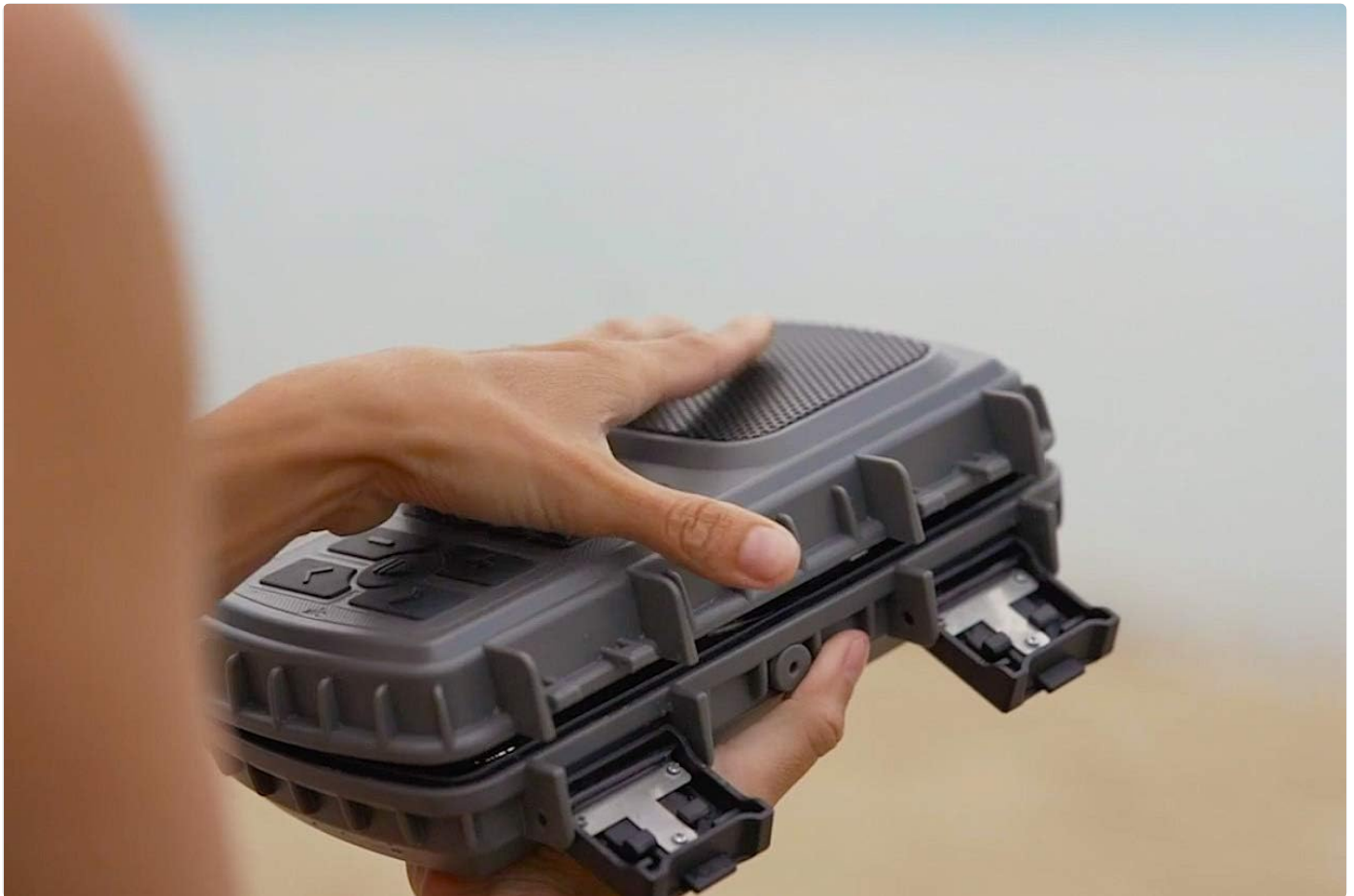
Figure 3: Securing the dry box latches.

The EcoExtreme 2 features a watertight dry storage compartment for your smartphone, keys, and other small items. To open, unlatch the side clips and lift the lid. Place your device inside. Ensure the compartment is clean and free of debris before closing. Securely close the lid and fasten both side clips to maintain the waterproof seal.