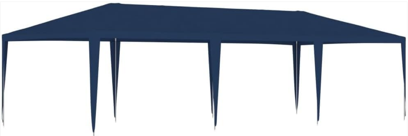
Image: The vidaXL Party Tent (4x9m, blue) fully assembled, providing a large sheltered area.

The vidaXL Party Tent is designed to provide a sheltered space for outdoor parties and gatherings. It features a UV and water-resistant polyethylene (PE) cover and a sturdy iron frame, ensuring stability and durability for outdoor use.