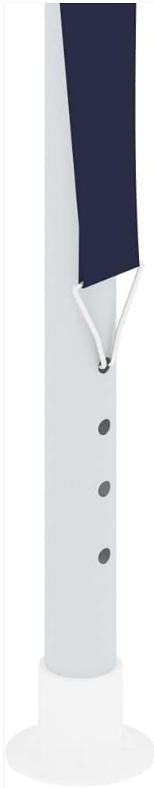
Image: A tent leg with multiple holes, likely for height adjustment or securing the canopy.