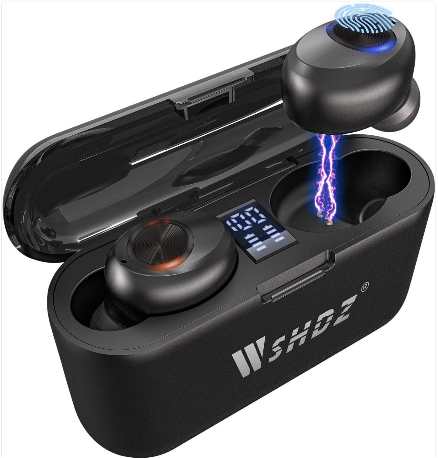
Image: WSHDZ T7 Earbuds in their charging case, displaying battery levels on the LED screen. The earbuds are illuminated, indicating charging.