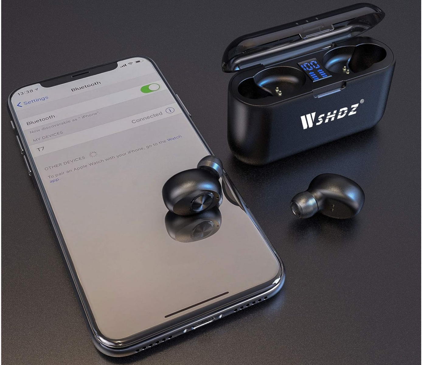
Image: The WSHDZ T7 earbuds, one in the charging case and one outside, next to a smartphone, demonstrating the flexibility of using them in single or twin mode.