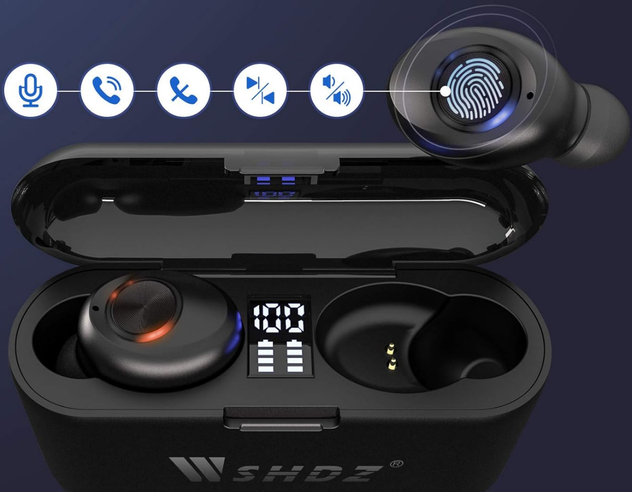
Image: A visual representation of the WSHDZ T7 earbud's touch control area, accompanied by icons illustrating various functions like microphone, phone calls, music playback, and volume adjustment.

Easy to control music playback, volume adjustment and phone answering with a simple touch.