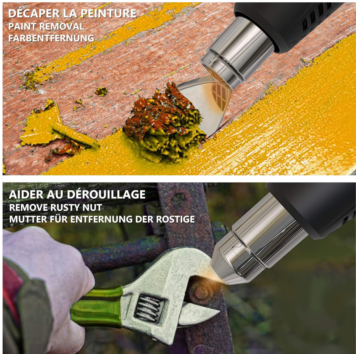
Figure 4.3: Additional applications: removing paint from a surface using a flat nozzle and assisting in loosening a rusty nut with a reduction nozzle.