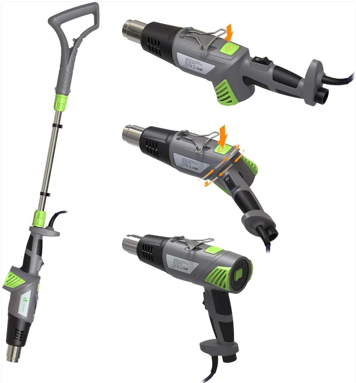
Figure 2.1: The VOUNOT Electric Weed Burner shown as a long-handled weed burner, a short-handled hot air gun, and a compact handheld hot air gun.