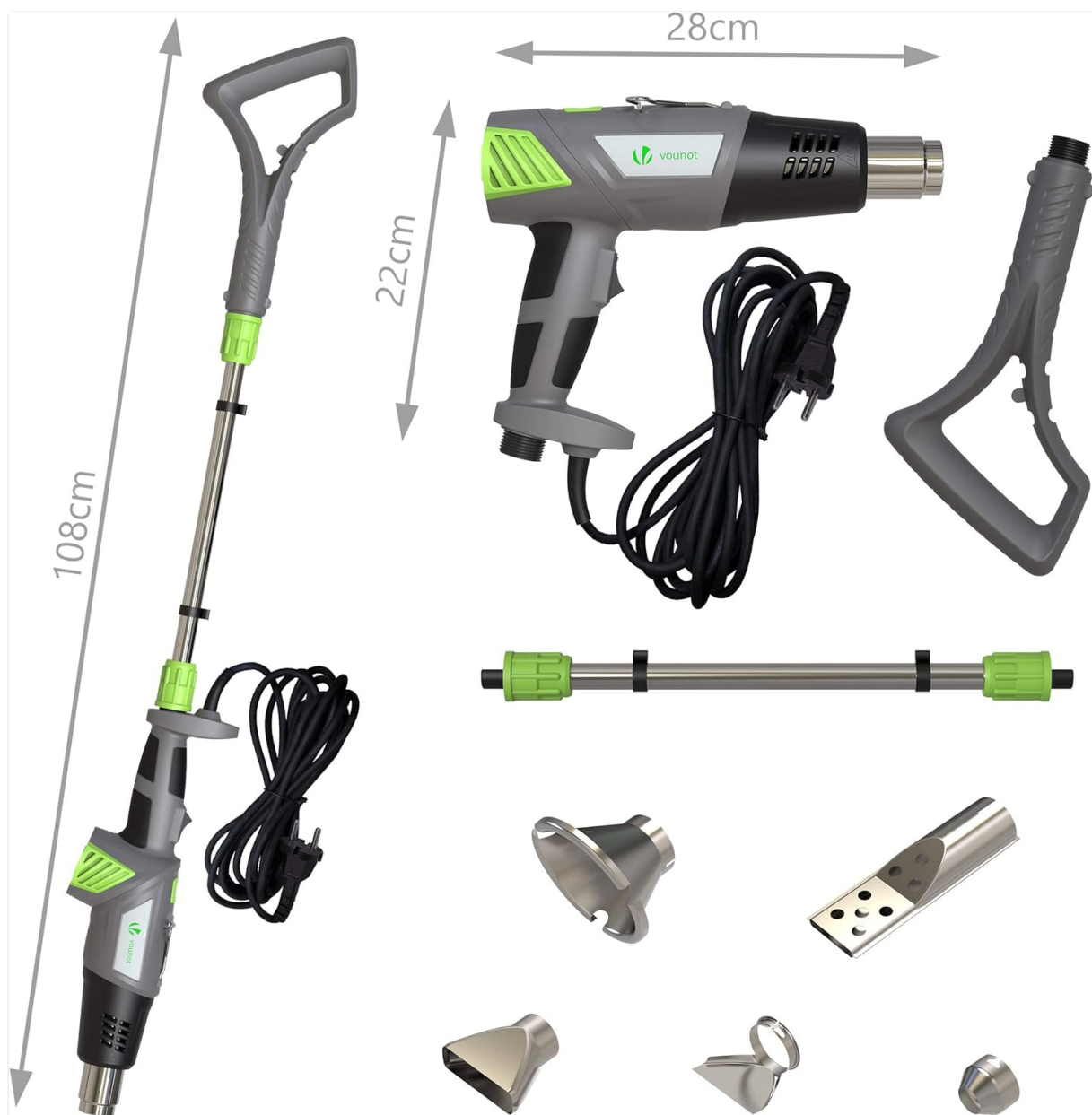
Figure 2.2: All components of the VOUNOT Electric Weed Burner, including the main unit, handle, extension pole, power cable, and various nozzles. Dimensions are also indicated.