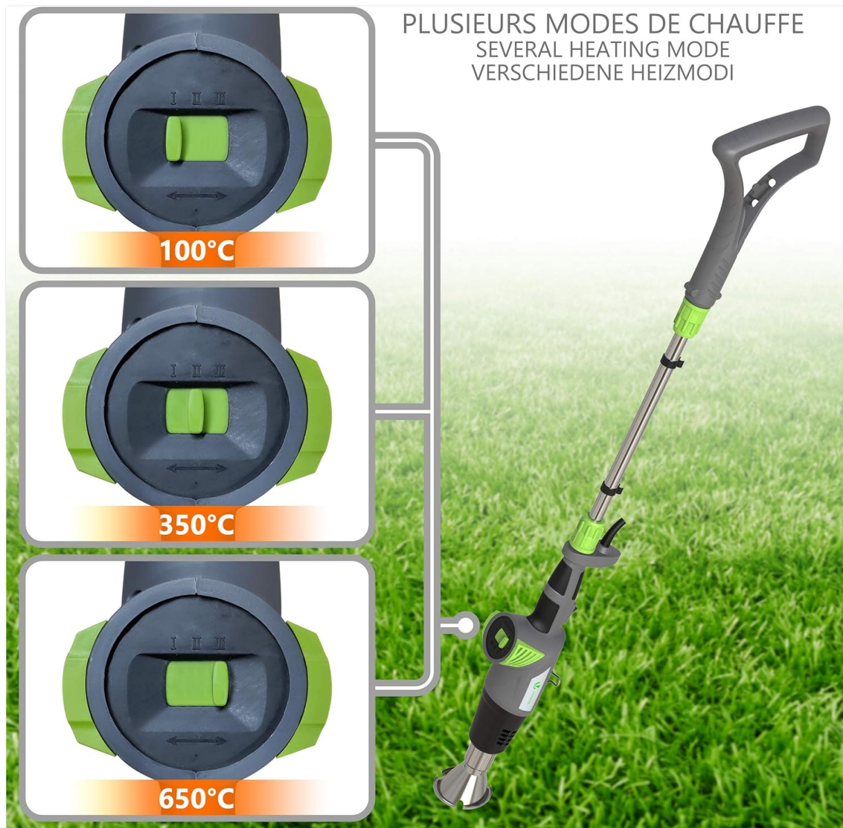
Figure 4.1: The three selectable temperature modes: 100°C, 350°C, and 650°C, controlled by a switch on the main unit.

The VOUNOT Electric Weed Burner offers three temperature settings and various nozzles for different applications.