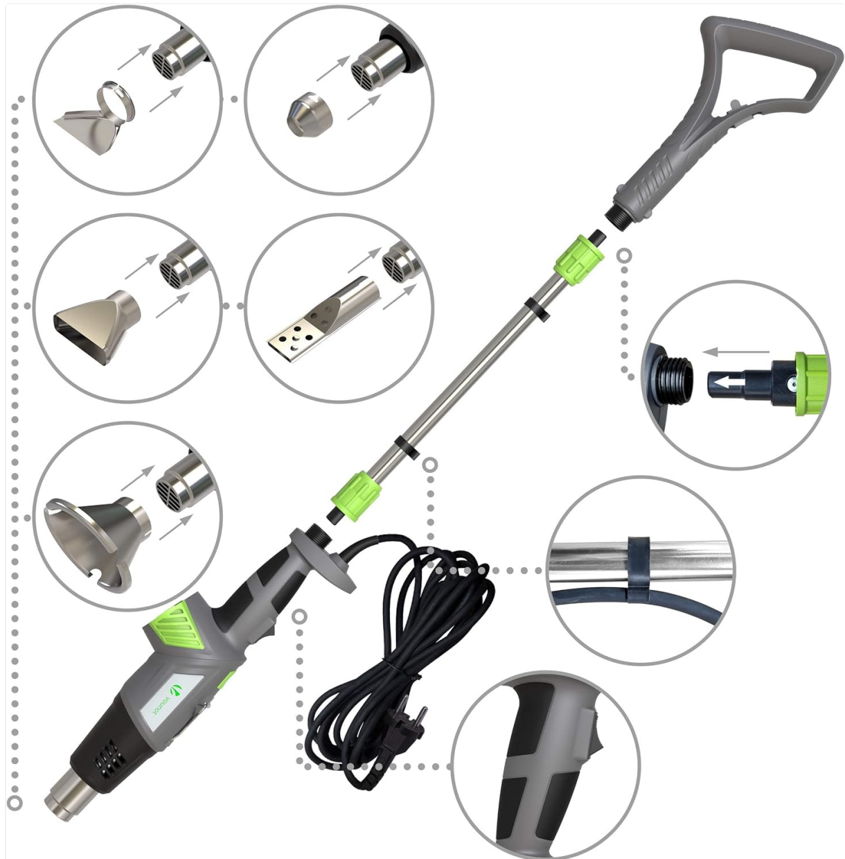
Figure 3.1: Detailed assembly steps showing how to attach the extension pole, handle, and various nozzles to the main unit.