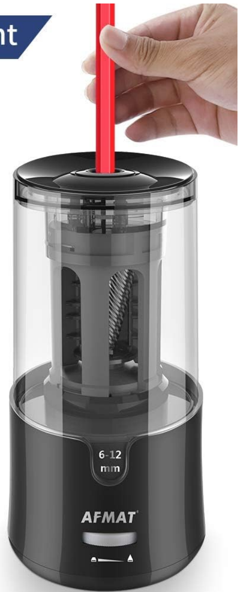
Image: The AFMAT Electric Pencil Sharpener highlighting its auto-stop feature for a perfect point and automatic broken lead ejection. A red pencil is shown being sharpened to a fine tip.