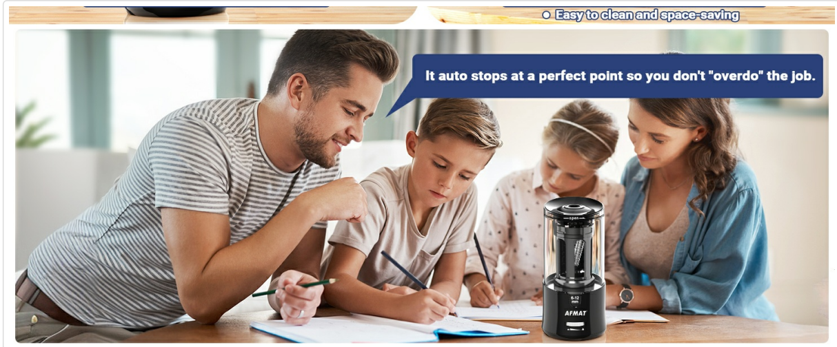
Image: The AFMAT Electric Pencil Sharpener demonstrating its top-open and vertical design, which facilitates easy removal of the shavings box for cleaning.