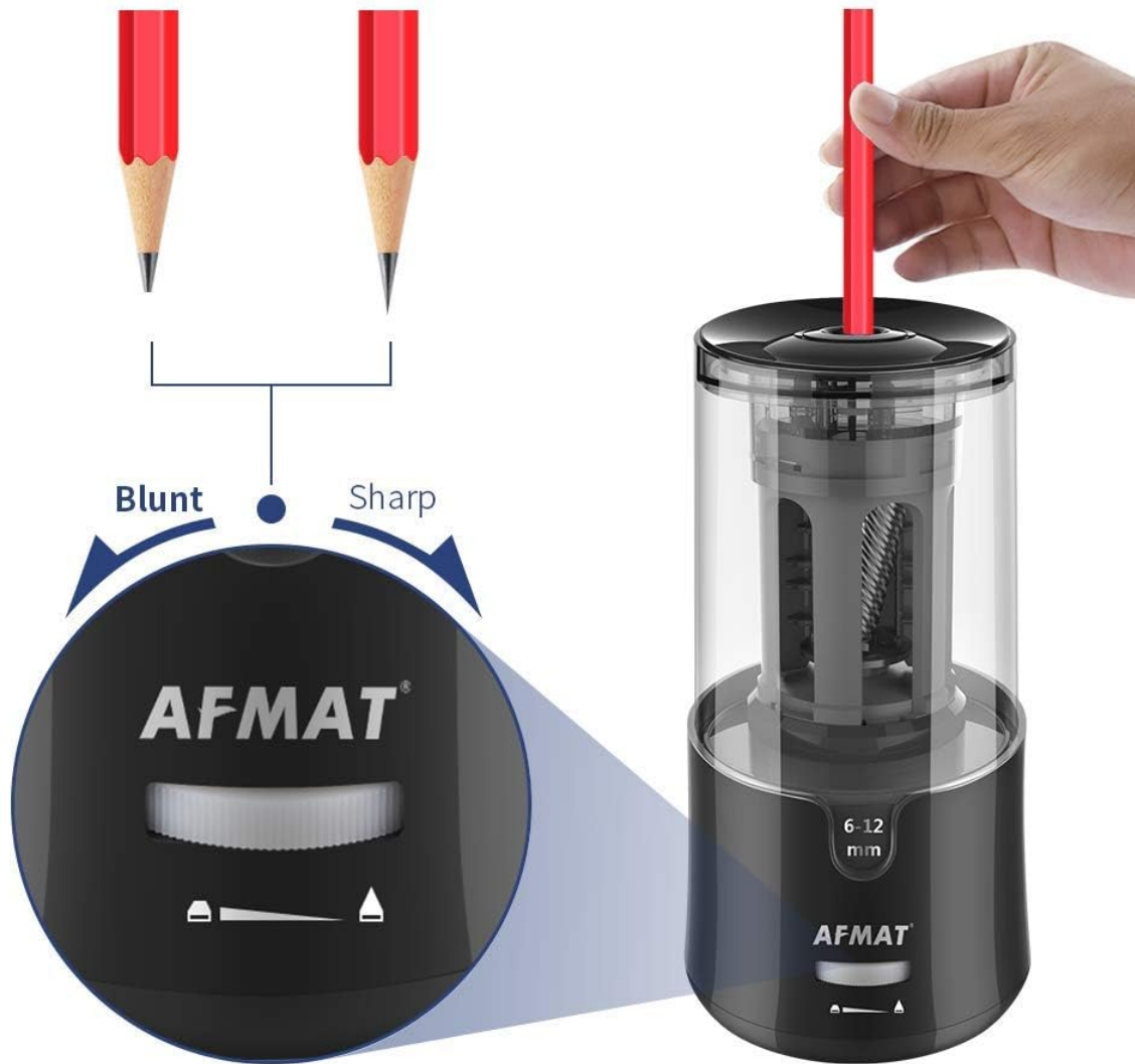
Image: The AFMAT Electric Pencil Sharpener illustrating its two adjustable pencil point settings: blunt and sharp. A hand is shown adjusting the selector dial on the sharpener.