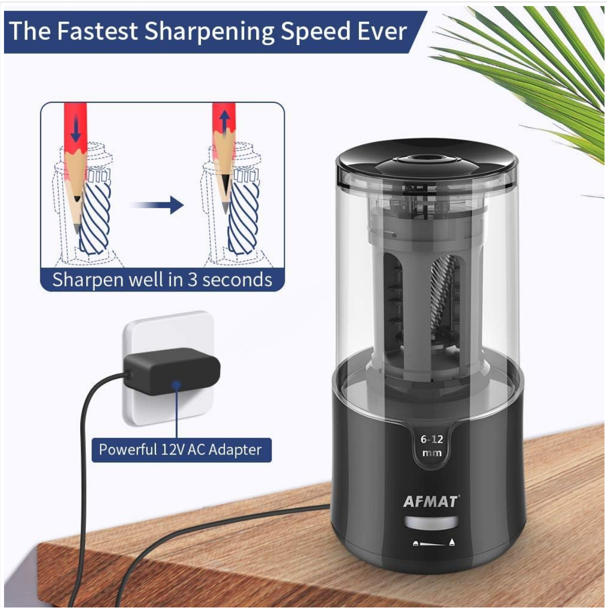
Image: The AFMAT Electric Pencil Sharpener in black, demonstrating its fast sharpening capability, achieving a sharp point in 3 seconds. A 12V AC adapter is shown connected to the unit.