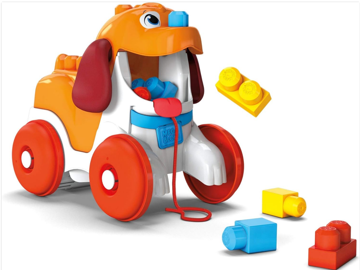
Image: Demonstrating how to place blocks into the puppy's mouth.

To 'feed' the puppy, place the big building blocks into its open mouth. The blocks will be stored inside the puppy's body, ready for the next play action.