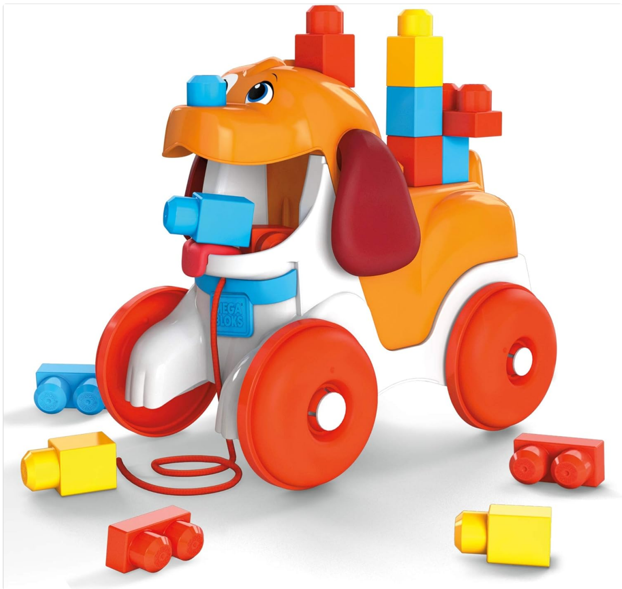
Image: The Mega Bloks Pull-Along Puppy with several colorful building blocks.