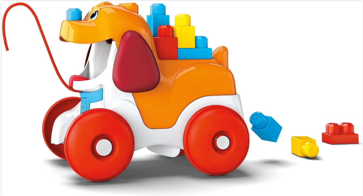
Image: The Pull-Along Puppy ready for play, showcasing its design and blocks.

assembly is required. Simply remove the toy and blocks from the packaging.