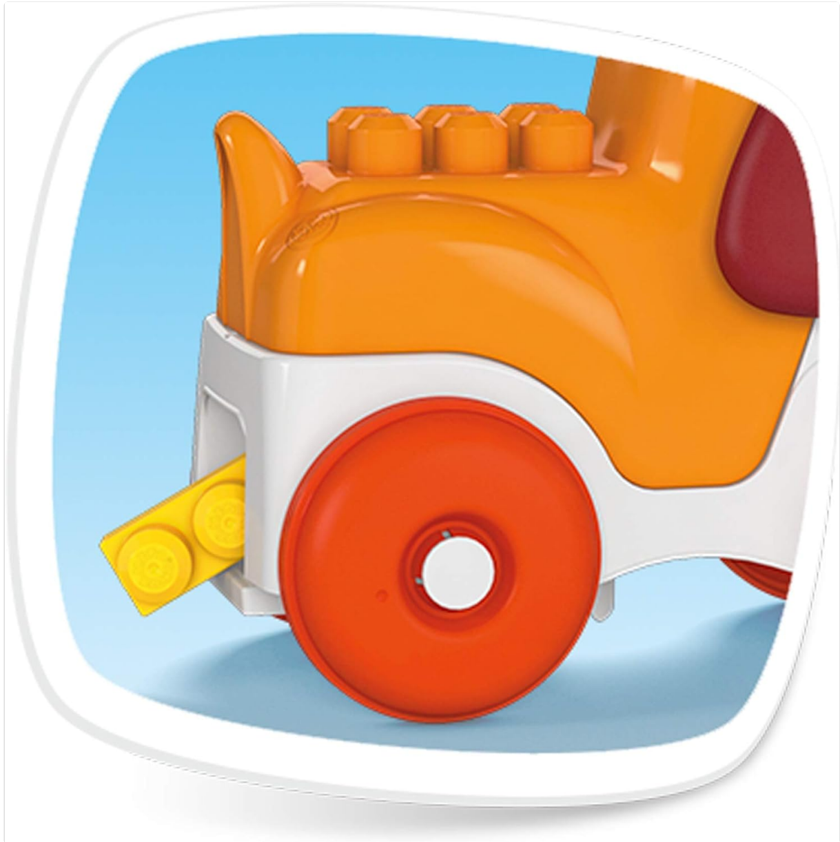
Image: The puppy releasing a block from its rear.

Hold the red leash attached to the puppy's collar. Gently pull the puppy along a flat surface. As the puppy moves, the blocks previously stored inside will be released from its rear, simulating a 'pooping' action. This encourages cause-and-effect learning and gross motor skill development.