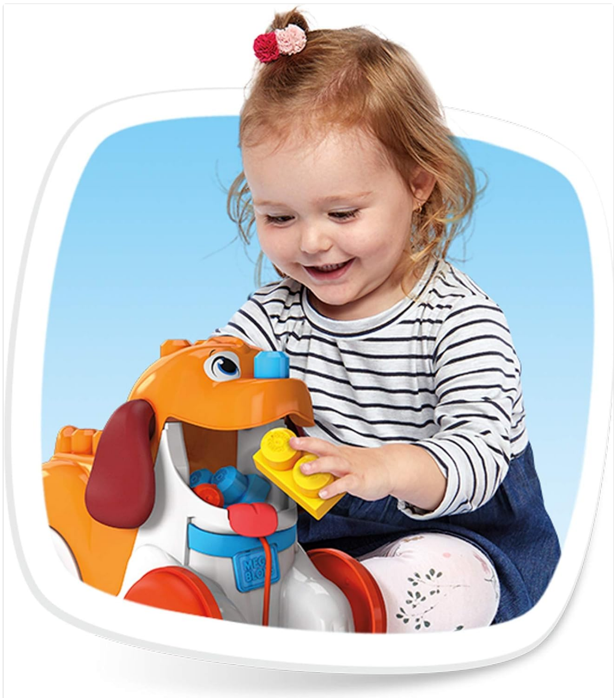
Image: A child engaging with the pull-along feature of the puppy.