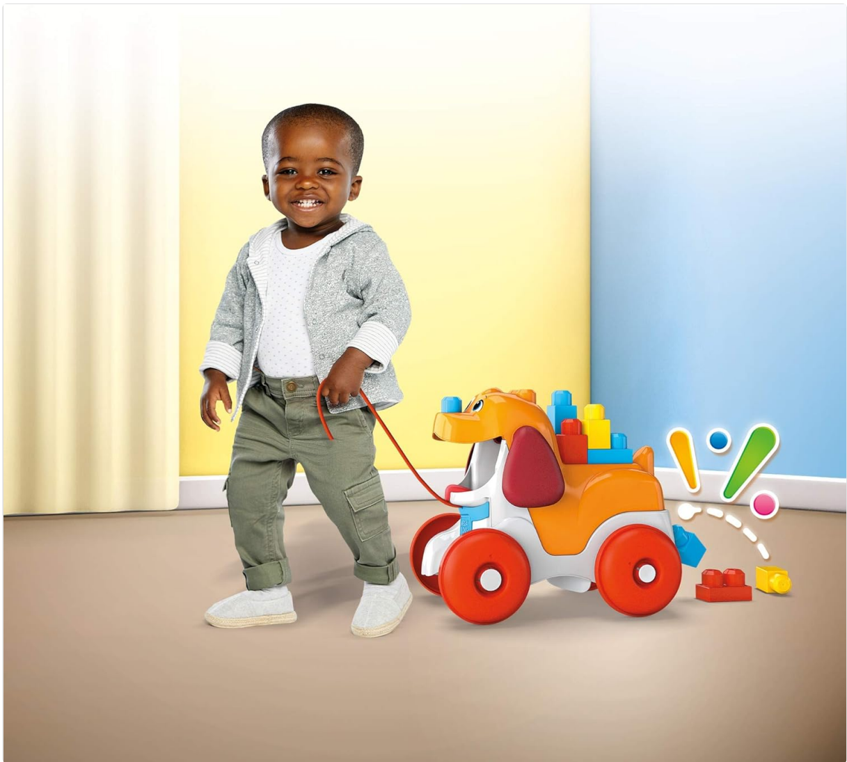
Image: Blocks built onto the puppy's back, demonstrating its building surfaces.