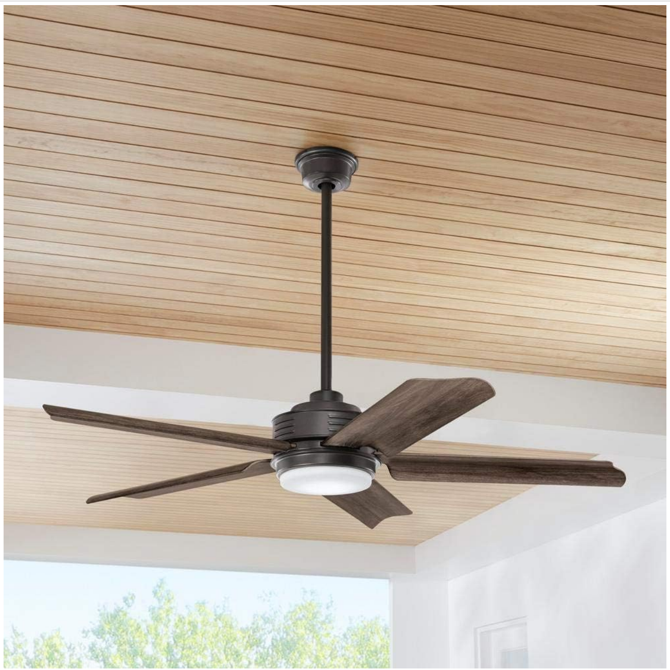
Image 4.0: The Hansfield ceiling fan installed, demonstrating its appearance with a downrod.

Before You Begin: Ensure power is disconnected at the circuit breaker. Read all instructions carefully.