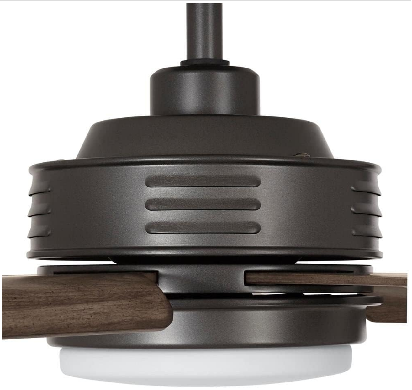
Image 4.3: View of the fan's motor housing and the integrated LED light fixture.