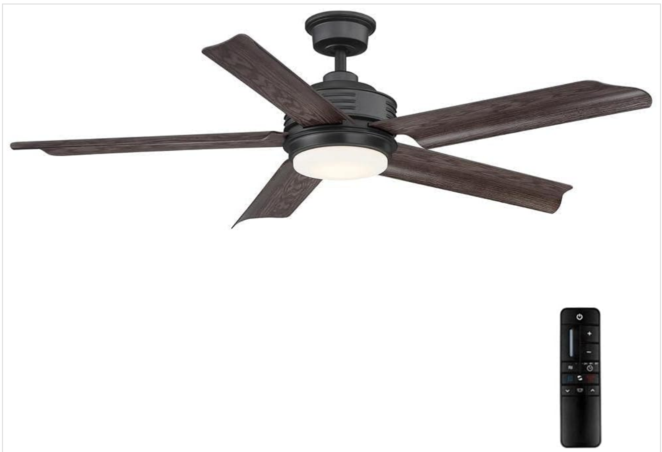
Image 1.1: The Hansfield 56-inch LED Outdoor Natural Iron Ceiling Fan with its remote control.