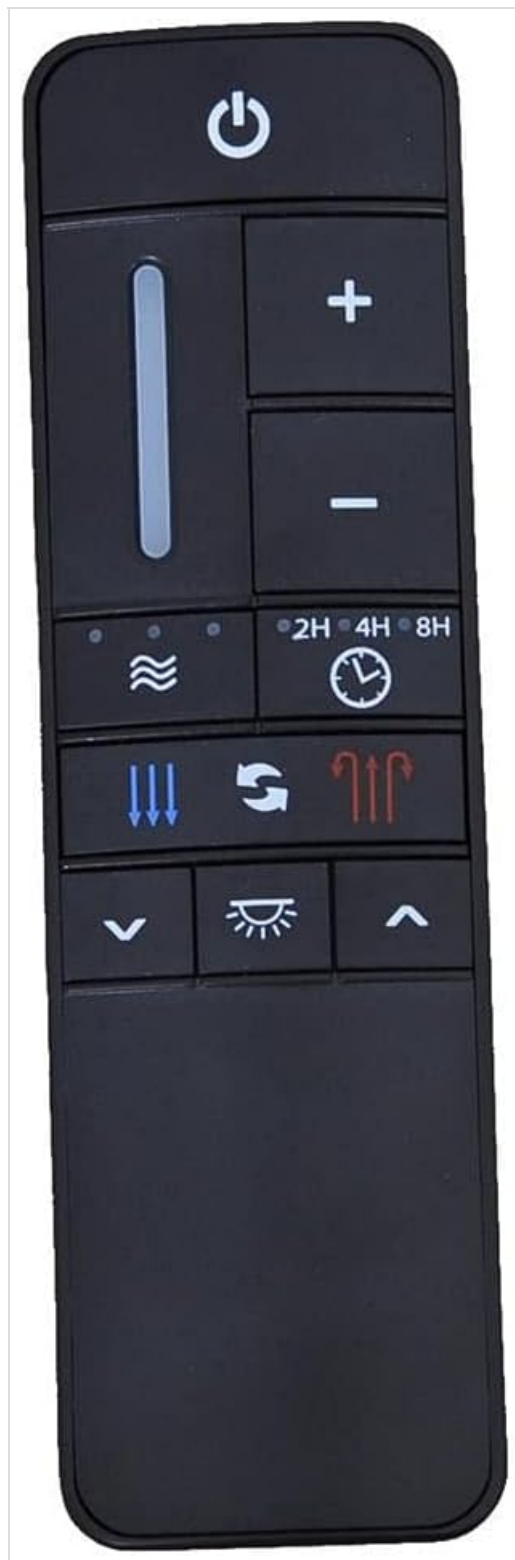
Image 5.1: The handheld remote control for the Hansfield ceiling fan.